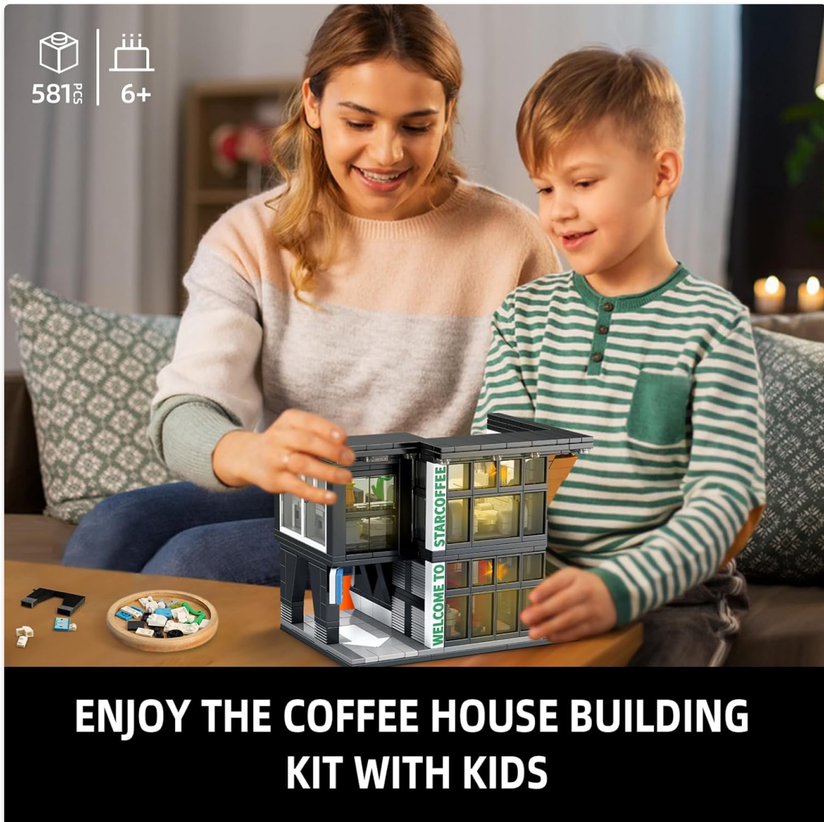
Image 4.1: The coffee house with its light feature both off and on, showcasing the illuminated interior.