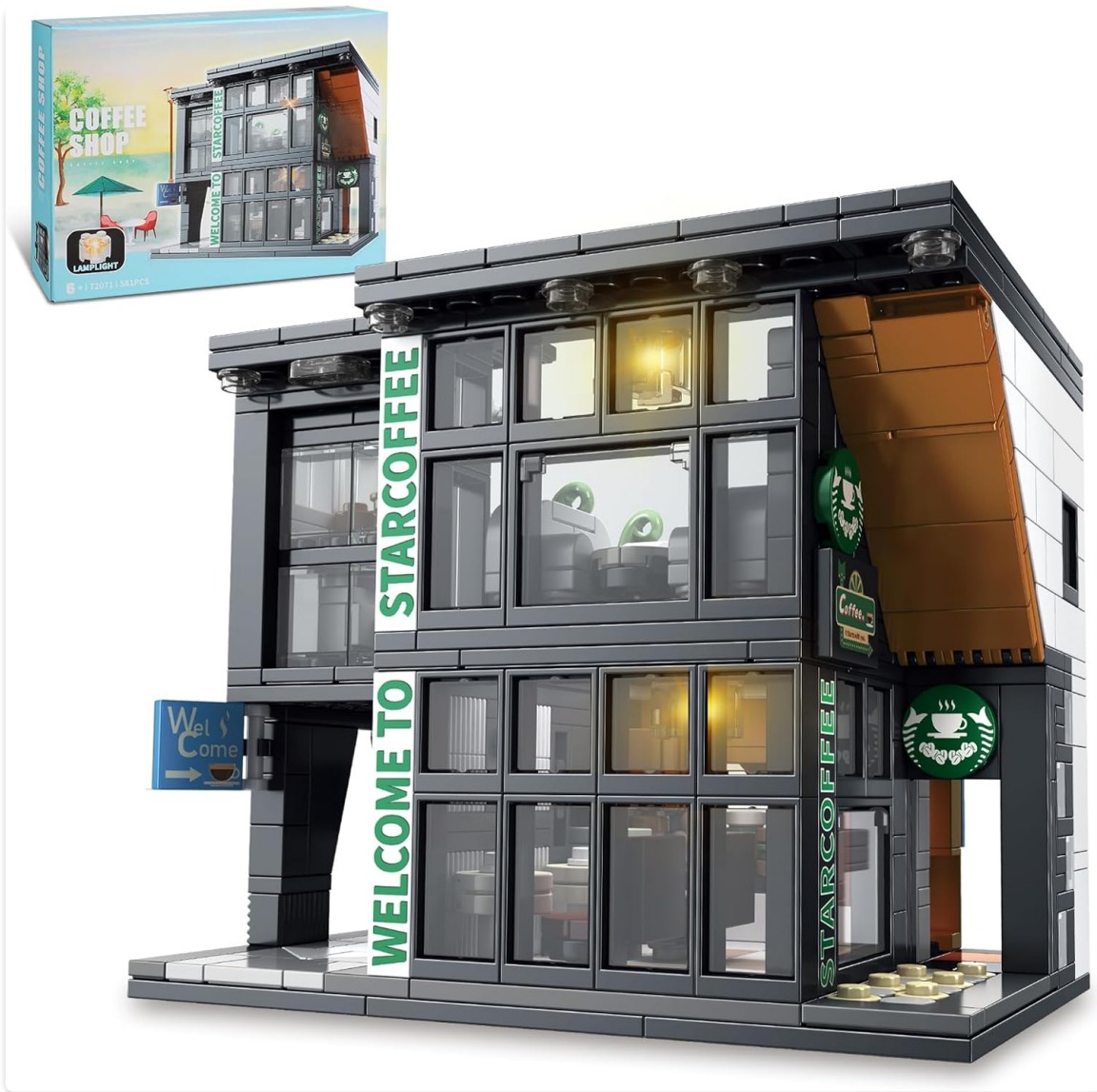
Image 1.1: The NEWABWN City Coffee House Architecture Building Blocks Set, showing the product box and the fully assembled model.