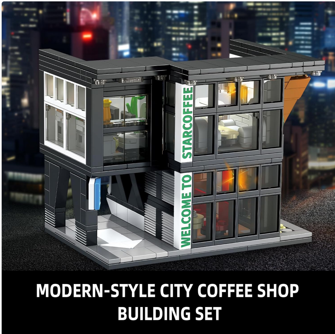
Image 4.3: A view of the coffee house interior, showcasing the detailed furniture and accessories.