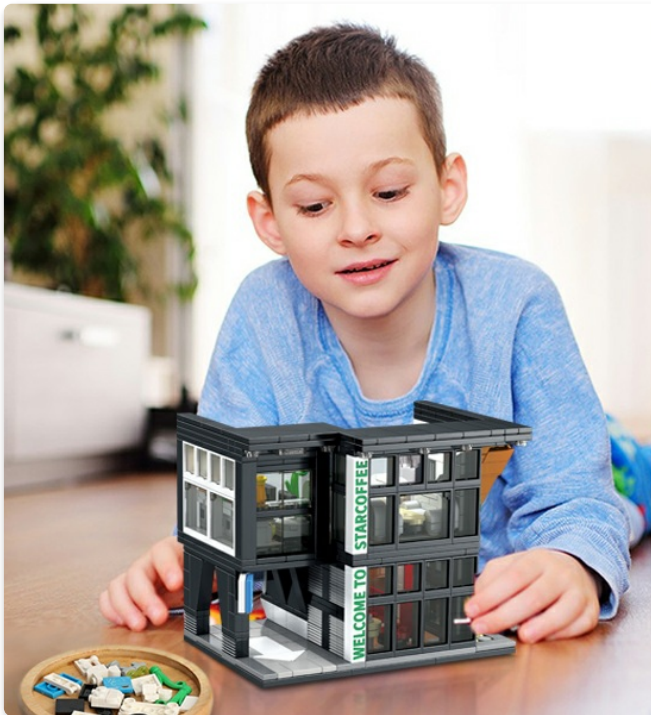
Image 3.2: The modular design allows for easy access to the interior during and after assembly.