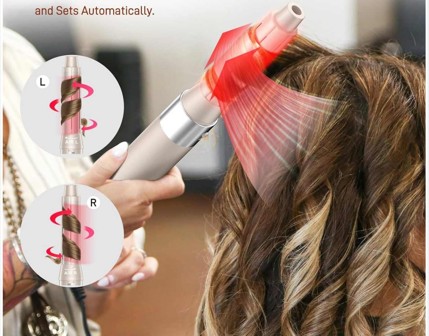
Image 5.2: The MESCOMB Airstyler with the auto-wrap curlers, illustrating how hair is automatically drawn and wrapped around the barrel for curling. Includes indicators for left (L) and right (R) curling directions.

Simply Place a Strand of Hair Near the Curler and it Wraps, Curls, and Sets Automatically.