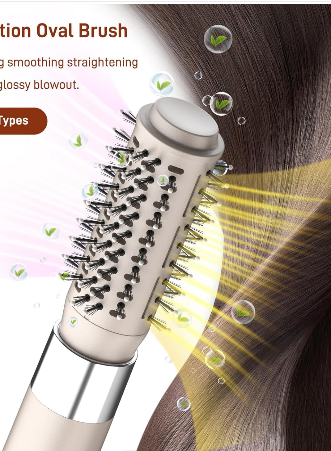
Image 5.3: Detailed view of the MESCOMB Airstyler's multi-function oval brush, highlighting its dual bristle types designed to volumize hair at the root, prevent tangles, and add shine for a glossy blowout.