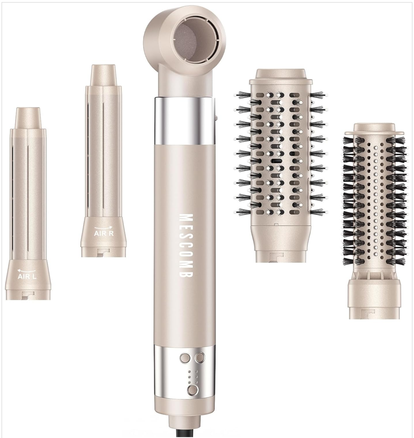
Image 1.1: The MESCOMB 5-in-1 Airstyler Multi Styler showing the main unit and its five interchangeable attachments: two auto-wrap curlers (left and right), a round brush, an oval brush, and the main drying nozzle.

This multi-styler is engineered to minimize heat damage while providing professional-quality results, making it suitable for various hair types and styling needs.