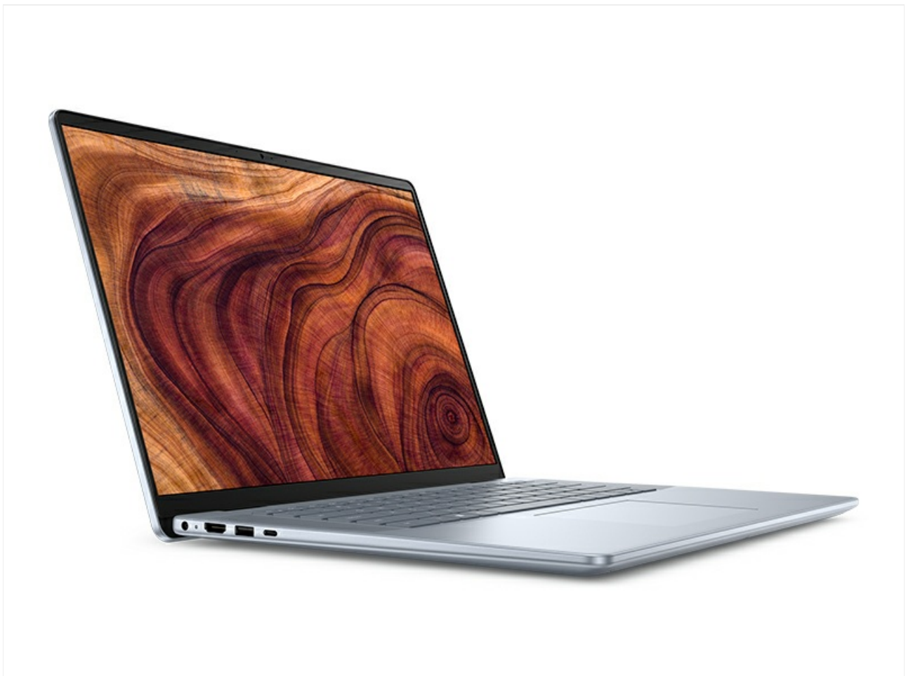
Figure 5: Laptop designed for extended use with less charging.

The laptop is equipped with a high-capacity battery, providing an average battery life of approximately 964 minutes (over 16 hours) under typical usage conditions. Actual battery life may vary based on usage patterns and settings.