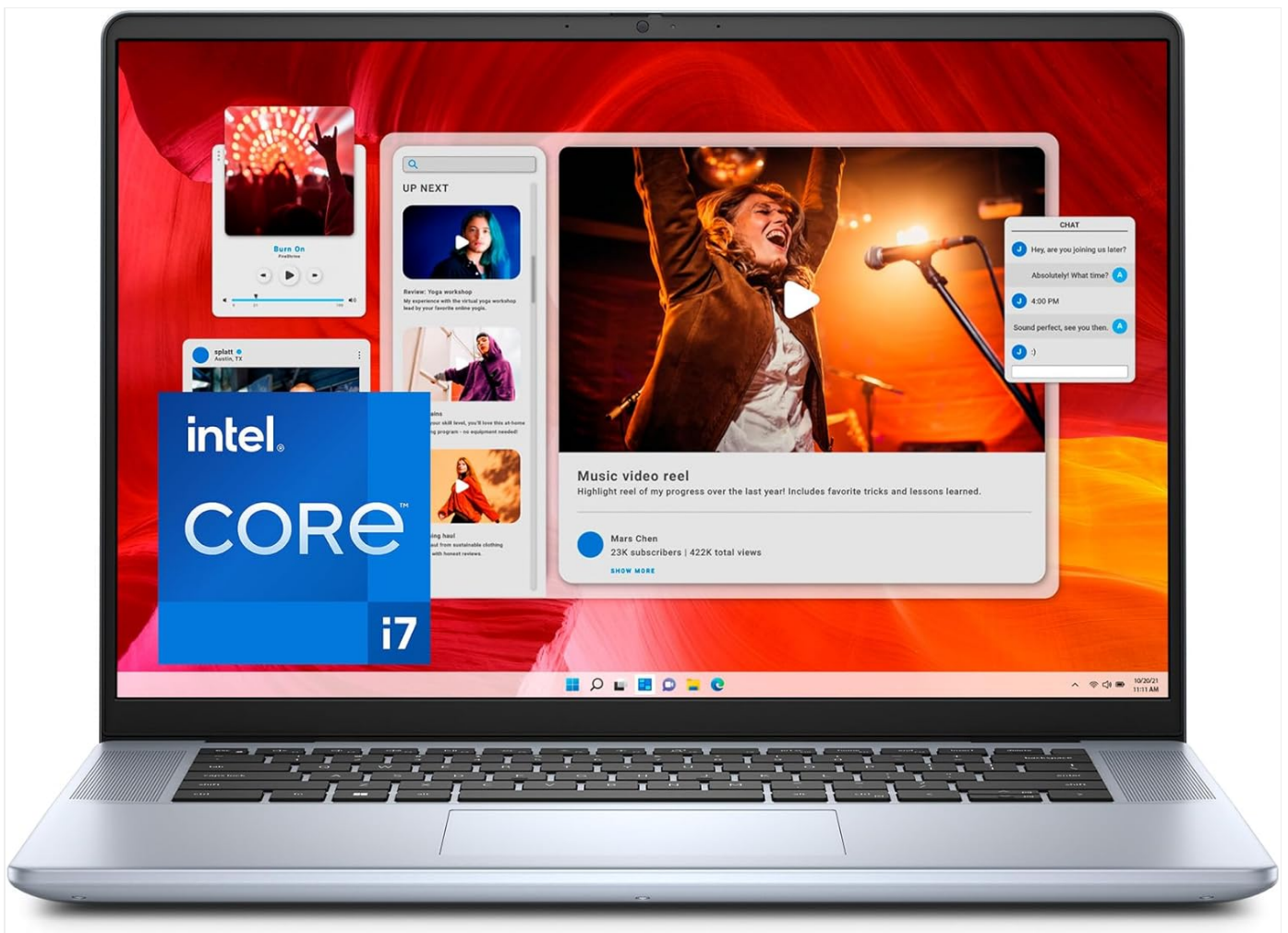
Figure 1: Dell Inspiron 16 Plus 7640 Laptop

This manual provides essential information for setting up, operating, maintaining, and troubleshooting your Dell Inspiron 16 Plus 7640 Laptop. Please read this manual thoroughly to ensure proper use and to maximize the performance and longevity of your device.