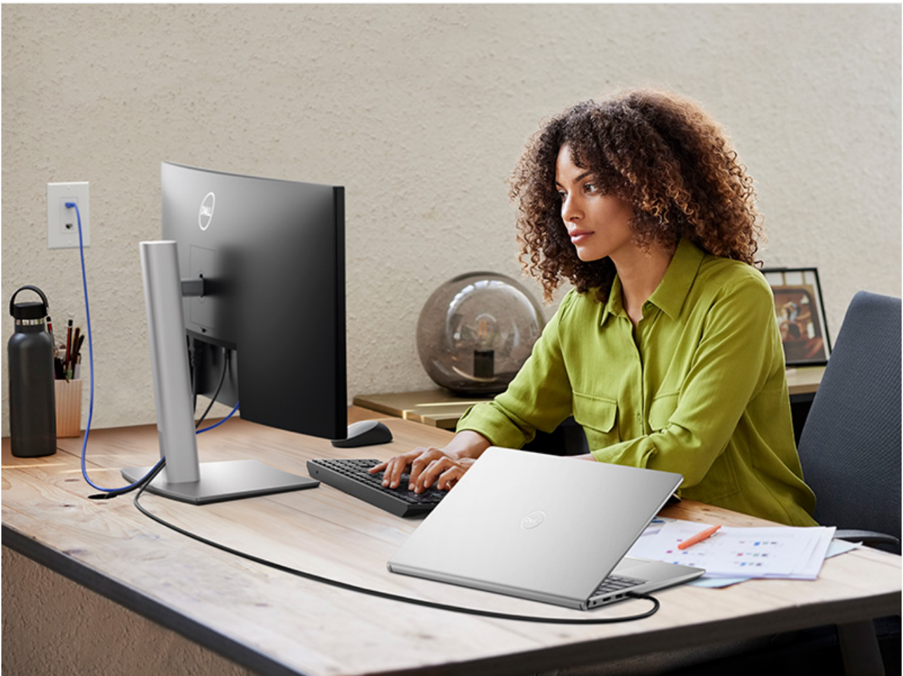
Figure 9: Benefits of Dell's support services.