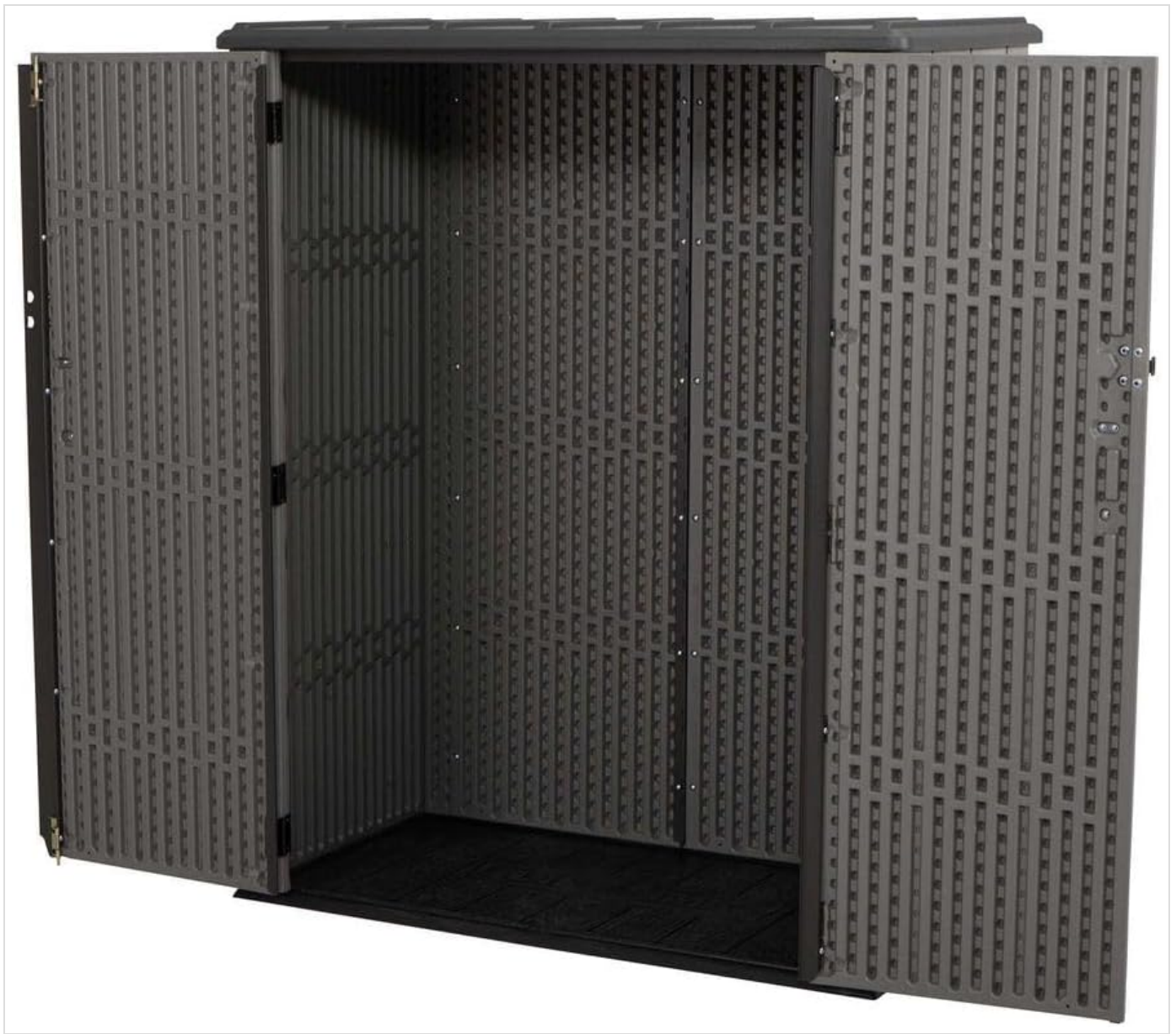
Image: Interior view of the shed with both doors fully open, showing the spacious storage area and textured inner walls.

Important Note: Some users have reported challenges with hinge screw alignment during door attachment. Ensure careful alignment of metal posts and plastic components as per instructions to avoid issues.