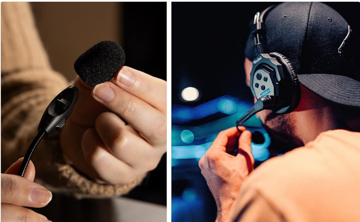
Figure 4: Attaching wind protection and adjusting the microphone arm.