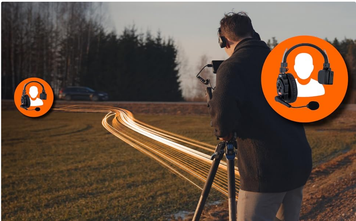
Figure 8: Illustration of the 350-meter communication range.

The XTALK X5 operates on a 2.4GHz frequency, providing a stable and reliable connection with an operational range of up to 350 meters. This extended range ensures mobility and uninterrupted communication in various professional environments.