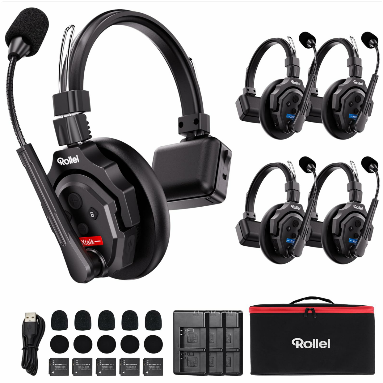
Figure 1: The Rollei XTALK X5 intercom headset, designed for professional wireless communication.