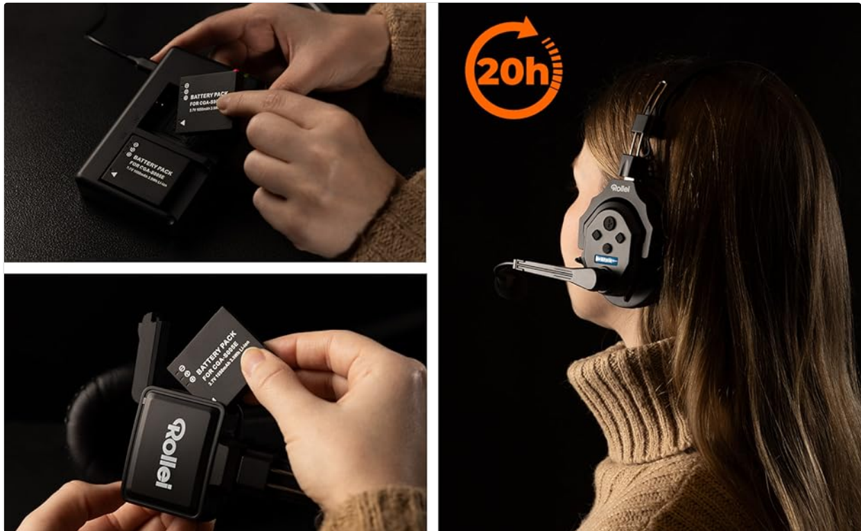
Figure 2: Battery installation and visual representation of 20-hour battery life.