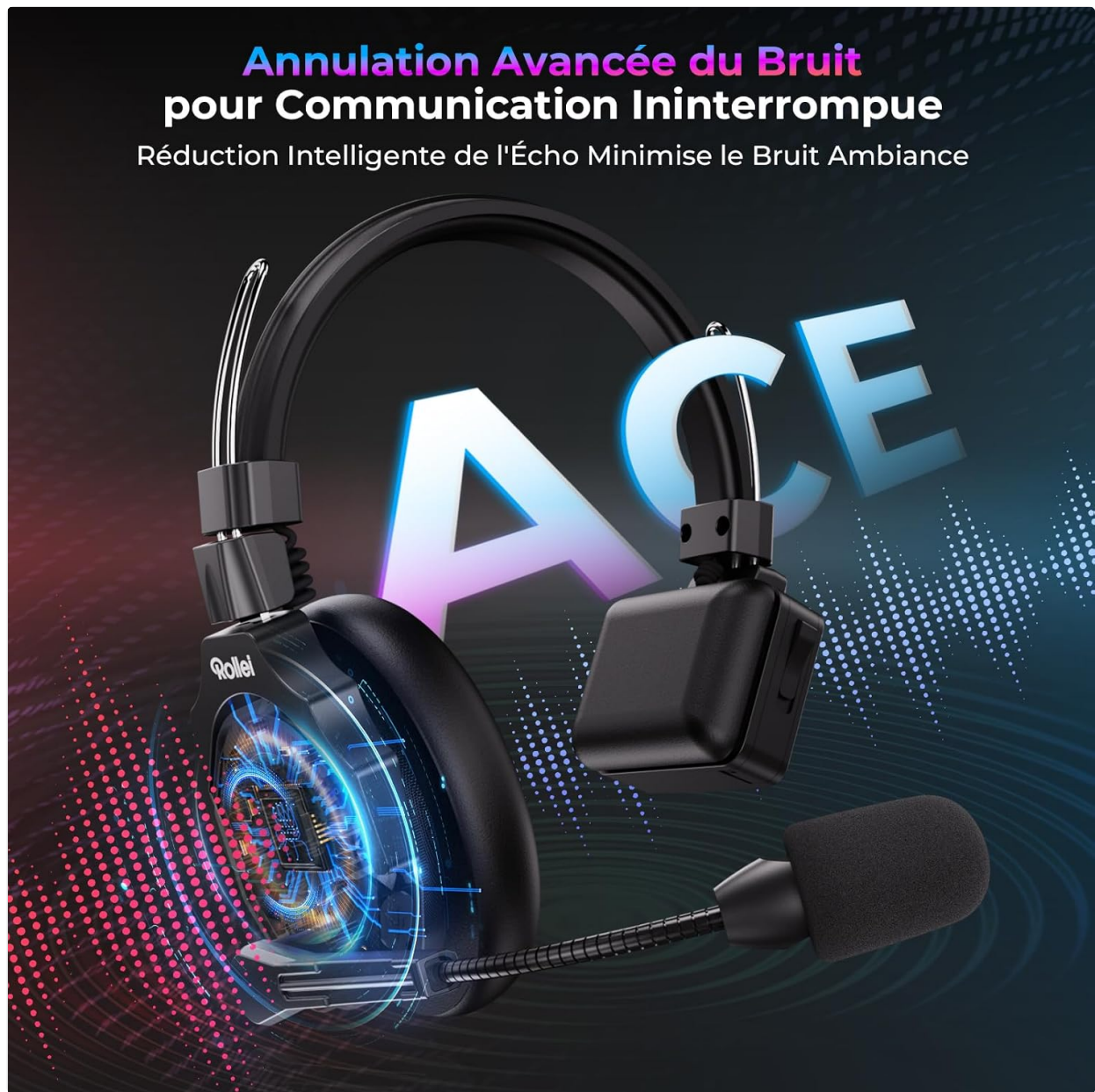
Figure 6: Advanced noise cancellation technology in the XTALK X5.