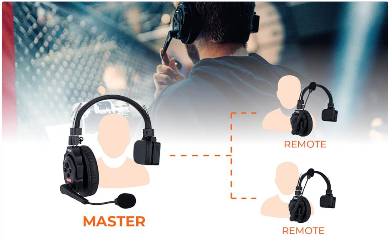
Figure 5: Master and Remote headset configuration diagram.

The XTALK X5 headsets can be configured as Master or Remote units and divided into two independent groups. Refer to the specific pairing instructions provided in the full user manual for detailed steps on establishing communication groups.