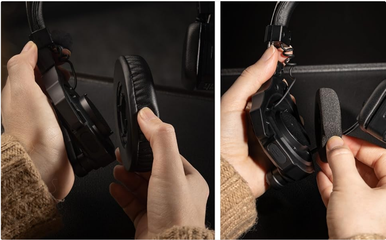
Figure 3: Replacing ear cushions for customized comfort.