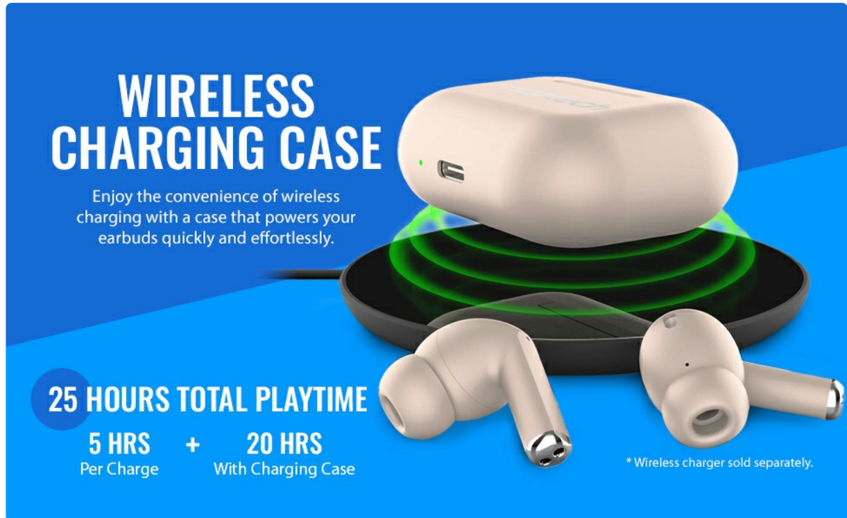
Image: Naztech Xpods PRO charging case on a wireless charging pad, illustrating 25 hours total playtime and quick charge feature.