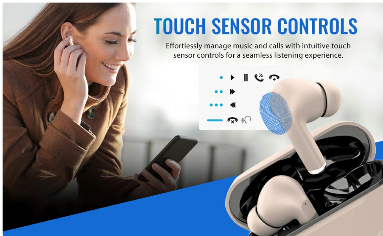
Image: Visual guide to touch sensor controls on the Naztech Xpods PRO earbuds.