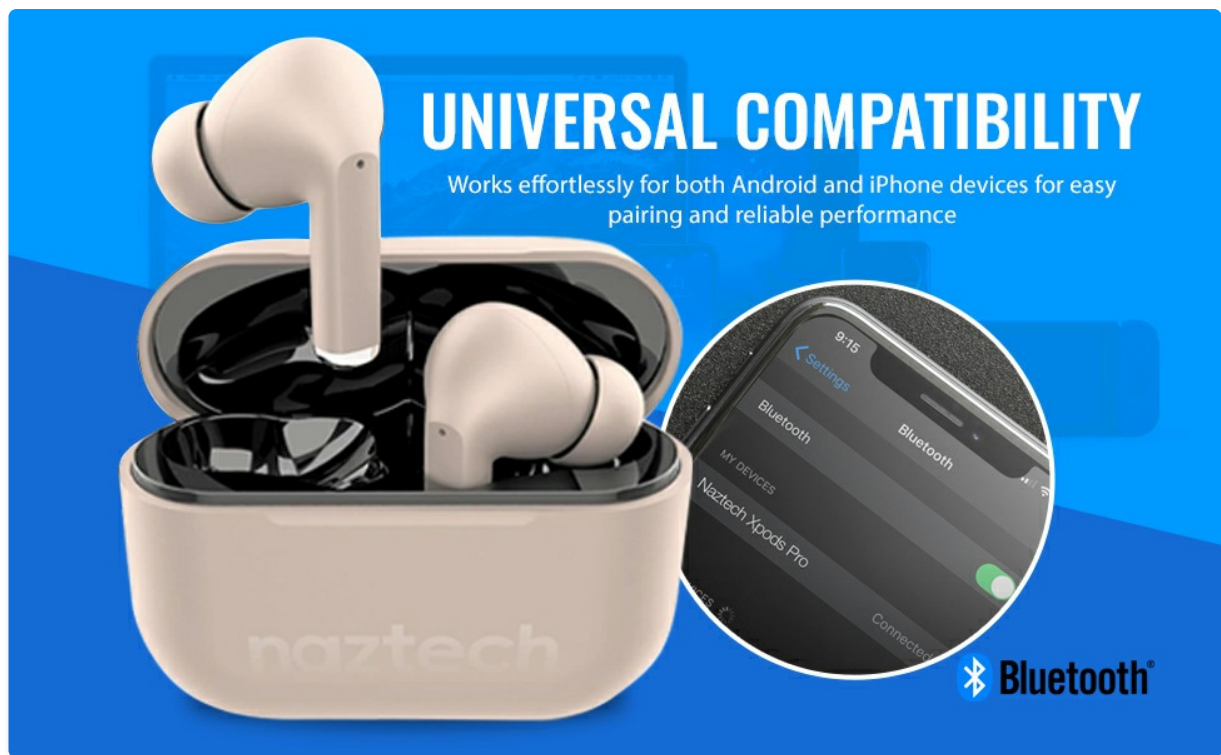
Image: Naztech Xpods PRO earbuds and a smartphone screen showing successful Bluetooth pairing.