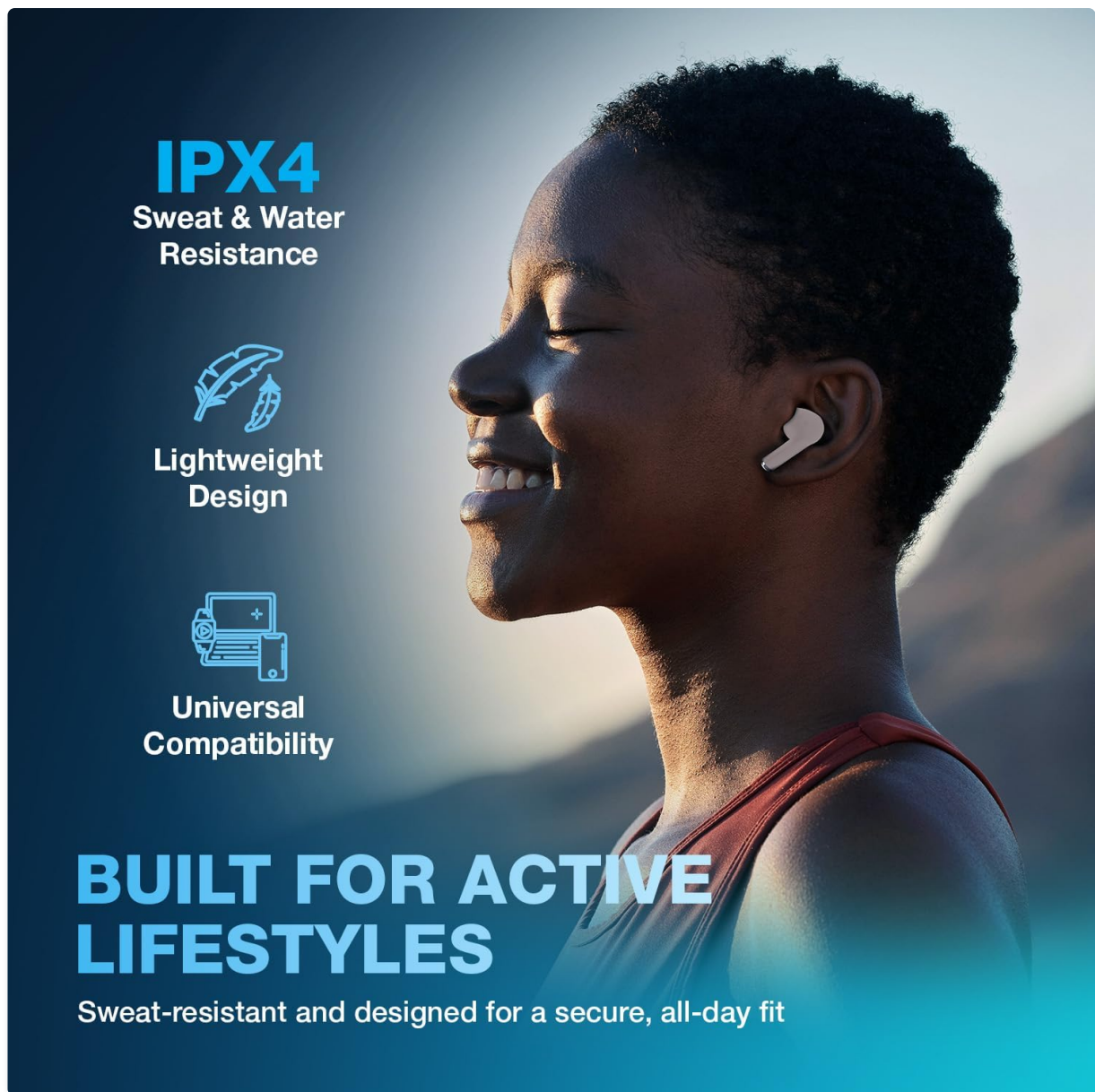
Image: Naztech Xpods PRO earbuds designed for active lifestyles, featuring IPX4 water resistance.