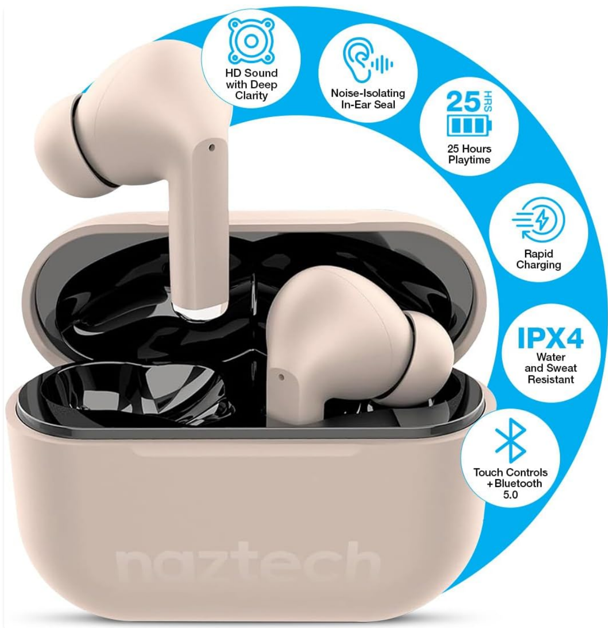
Image: Naztech Xpods PRO True Wireless Earbuds in Sandstone, resting in their open charging case.