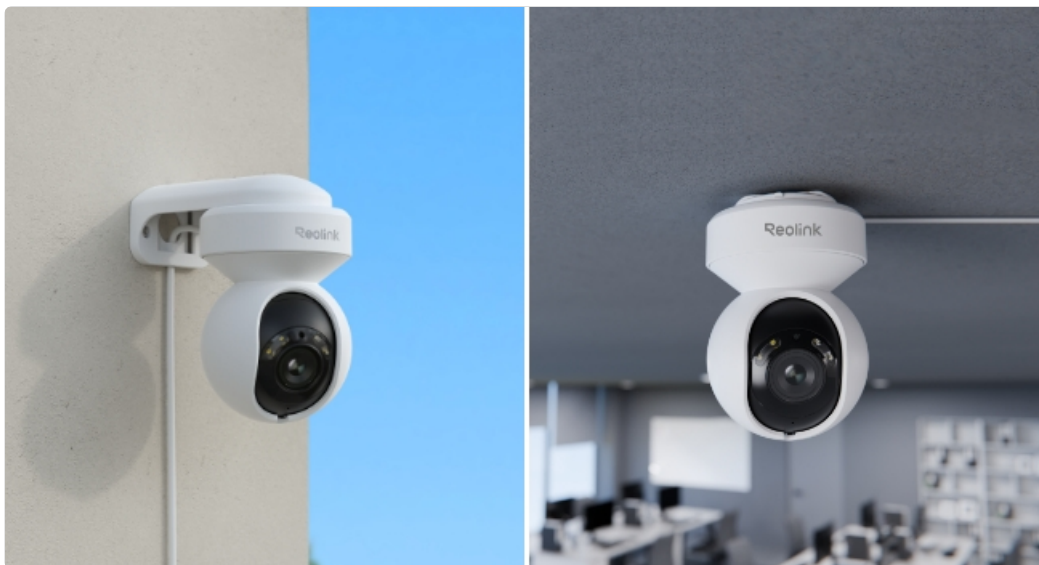
Image: Smart Detection and Auto Tracking features of the E1 Outdoor camera.