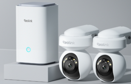
Image: Reolink Home Hub connected to a router and power source.