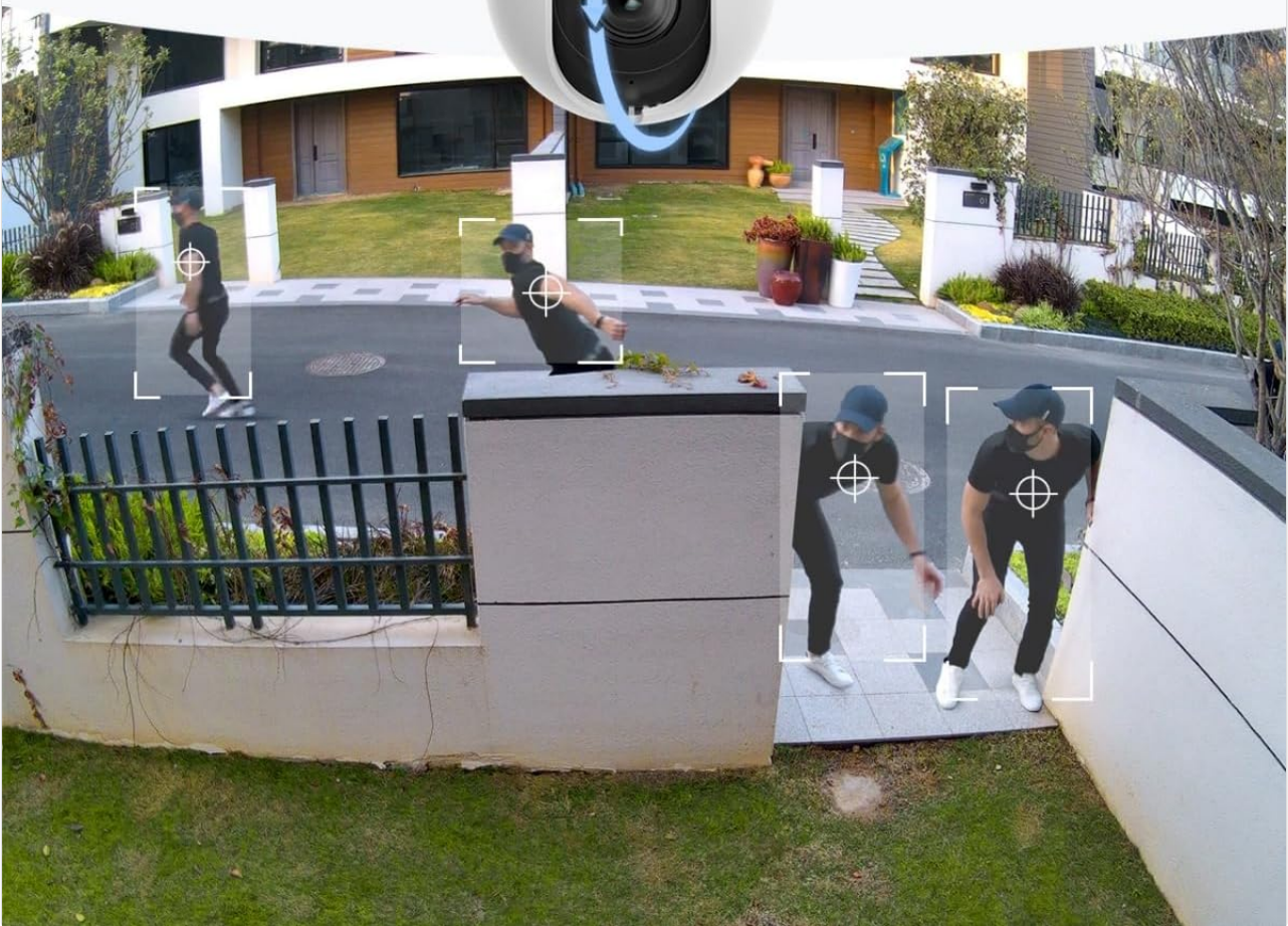
Image: Reolink E1 Outdoor camera mounted for surveillance.