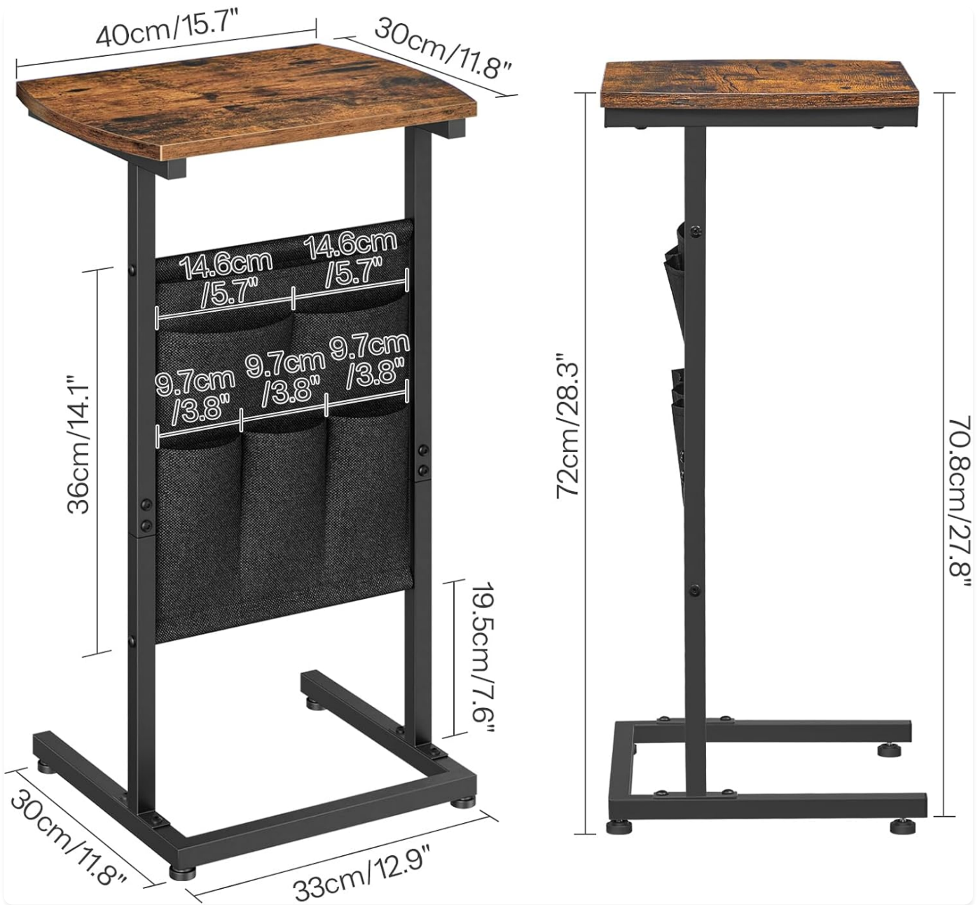
Image: Detailed dimensions of the C Shaped End Table, illustrating its compact design and storage bag capacity.