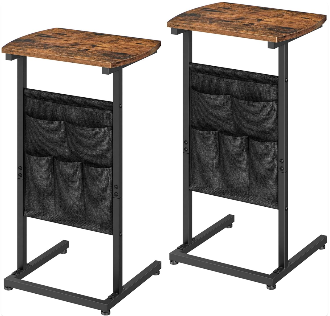
Image: The HOOBRO C Shaped End Table Set, showcasing both tables with their storage bags.