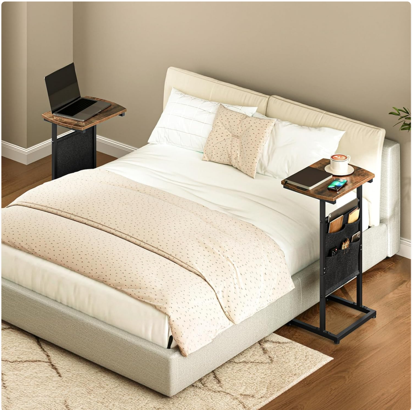
Image: The tables serving as functional bedside companions in a bedroom setting.