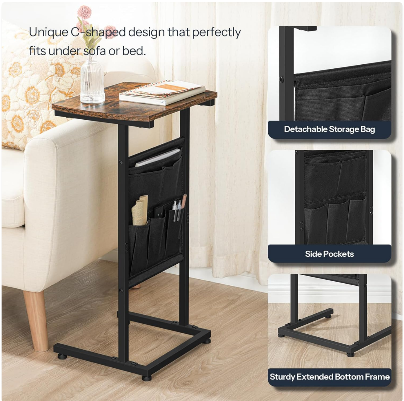
Image: Key features of the table, including its C-shaped base, storage bag, and robust frame.