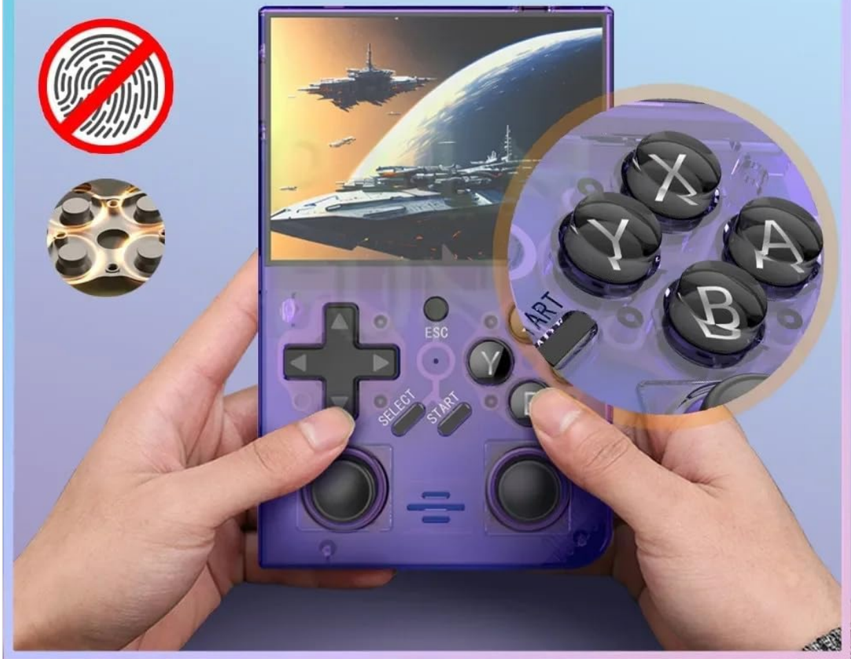
Image: The R35 Plus console's crystal buttons.