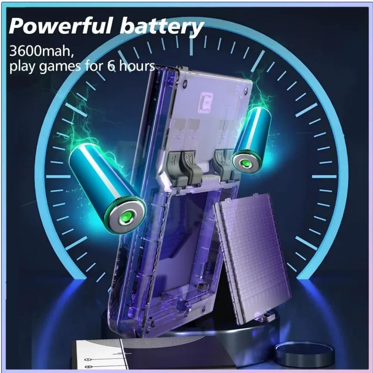
Image: The R35 Plus console's battery compartment and battery.