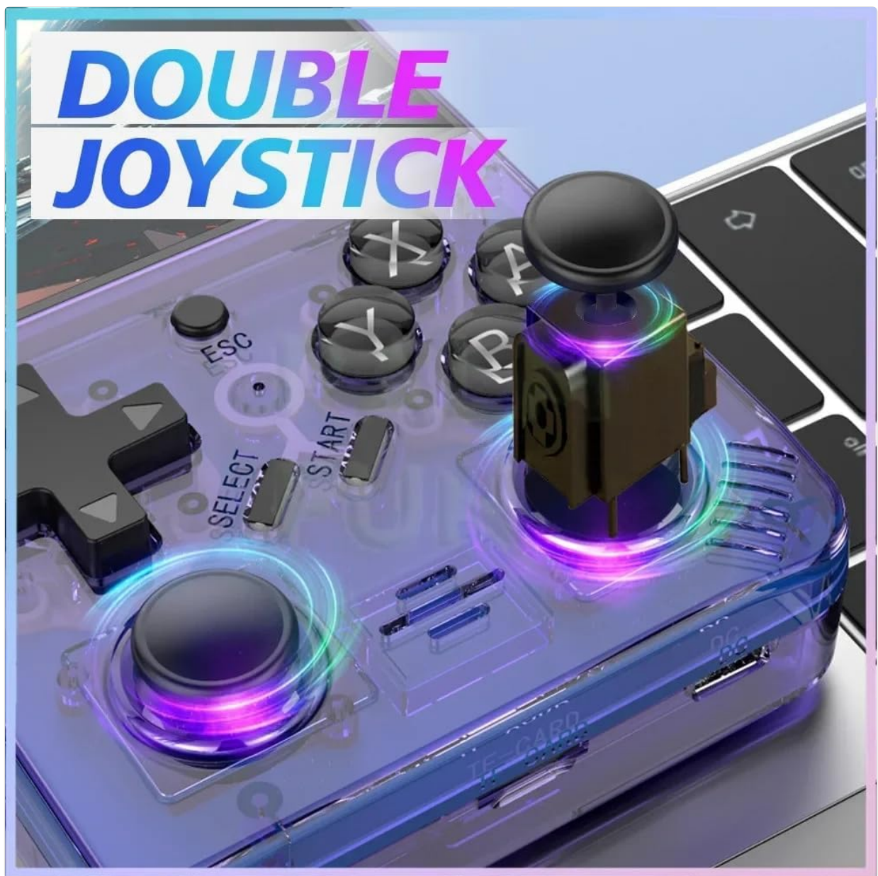
Image: The R35 Plus console's dual joysticks.