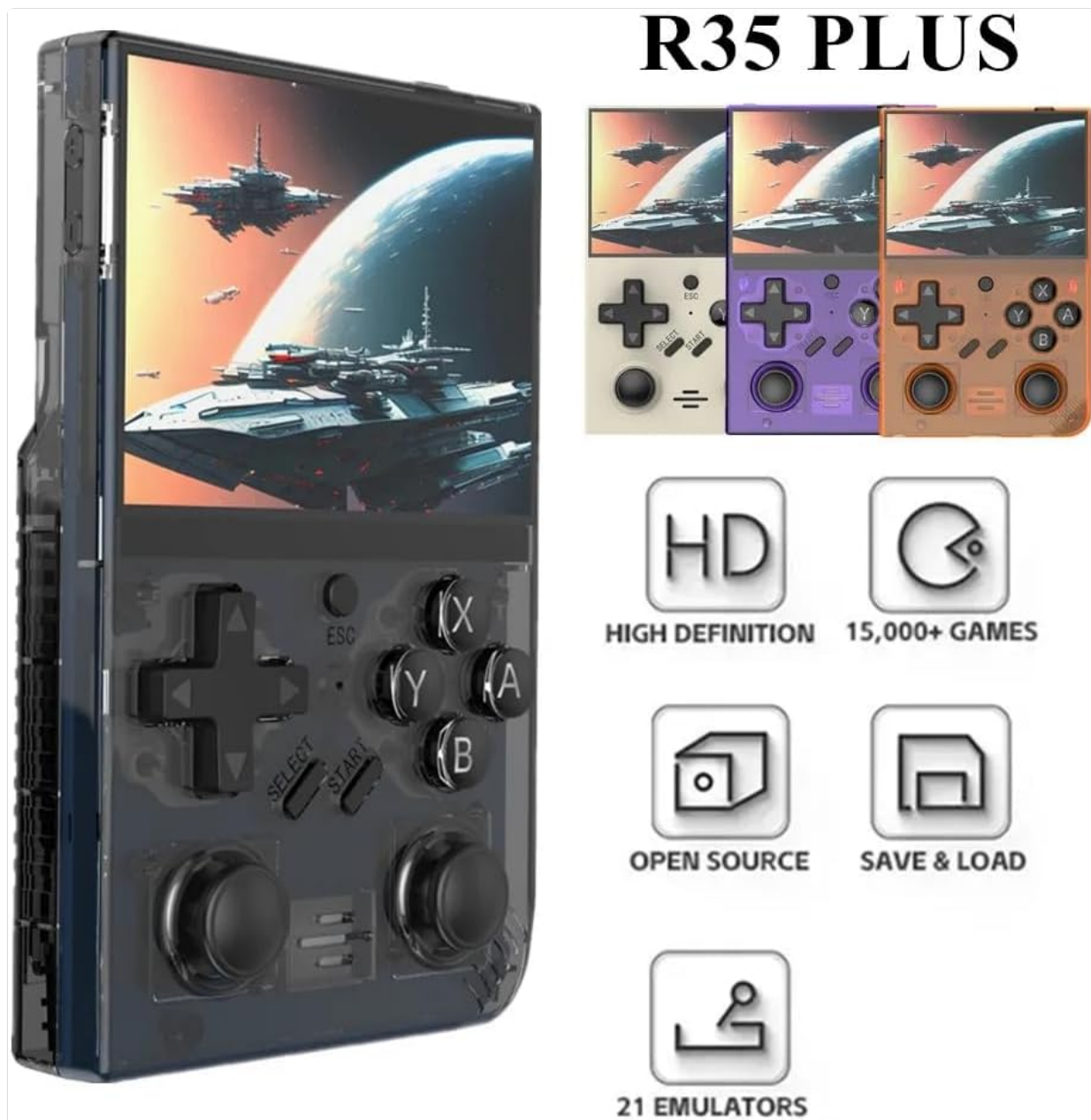
Image: The R35 Plus console showcasing its design and key features.