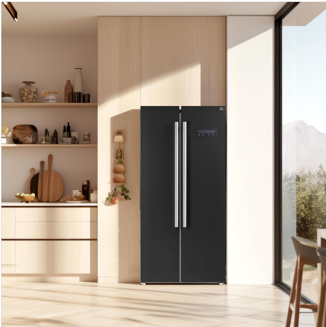
Figure 2: Refrigerator integrated into a kitchen setting.