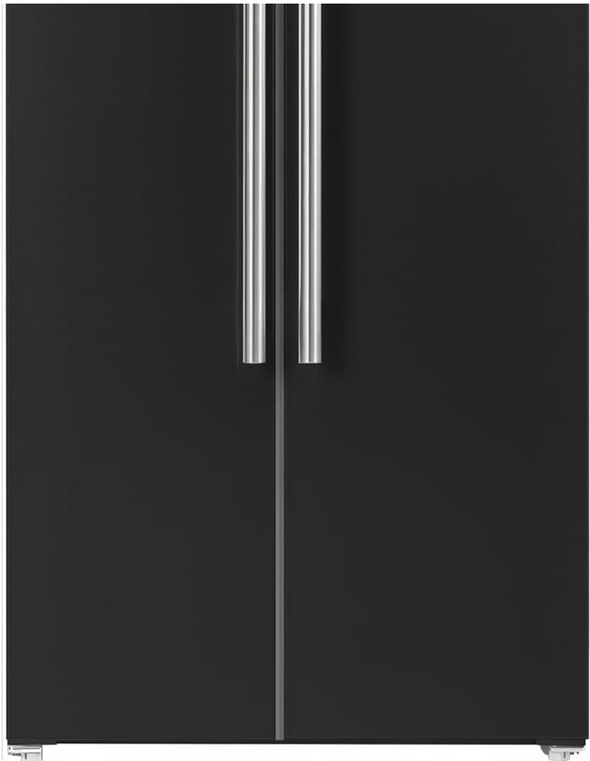
Figure 1: Front view of the Forno Salerno 33-inch Side-by-Side Refrigerator.