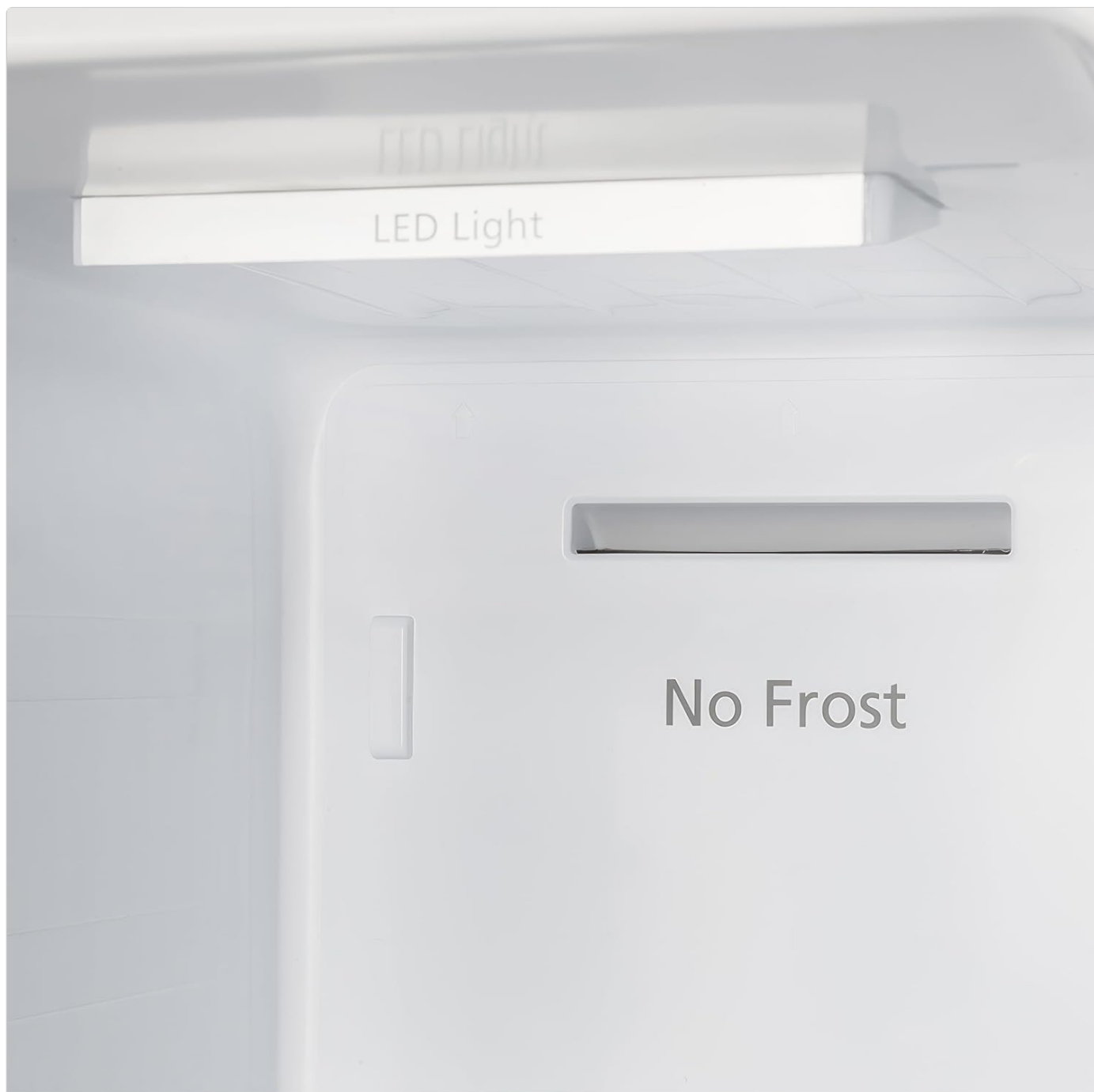
Figure 7: Interior of the freezer compartment with "No Frost" feature.

system ensures even temperature distribution and prevents ice buildup.