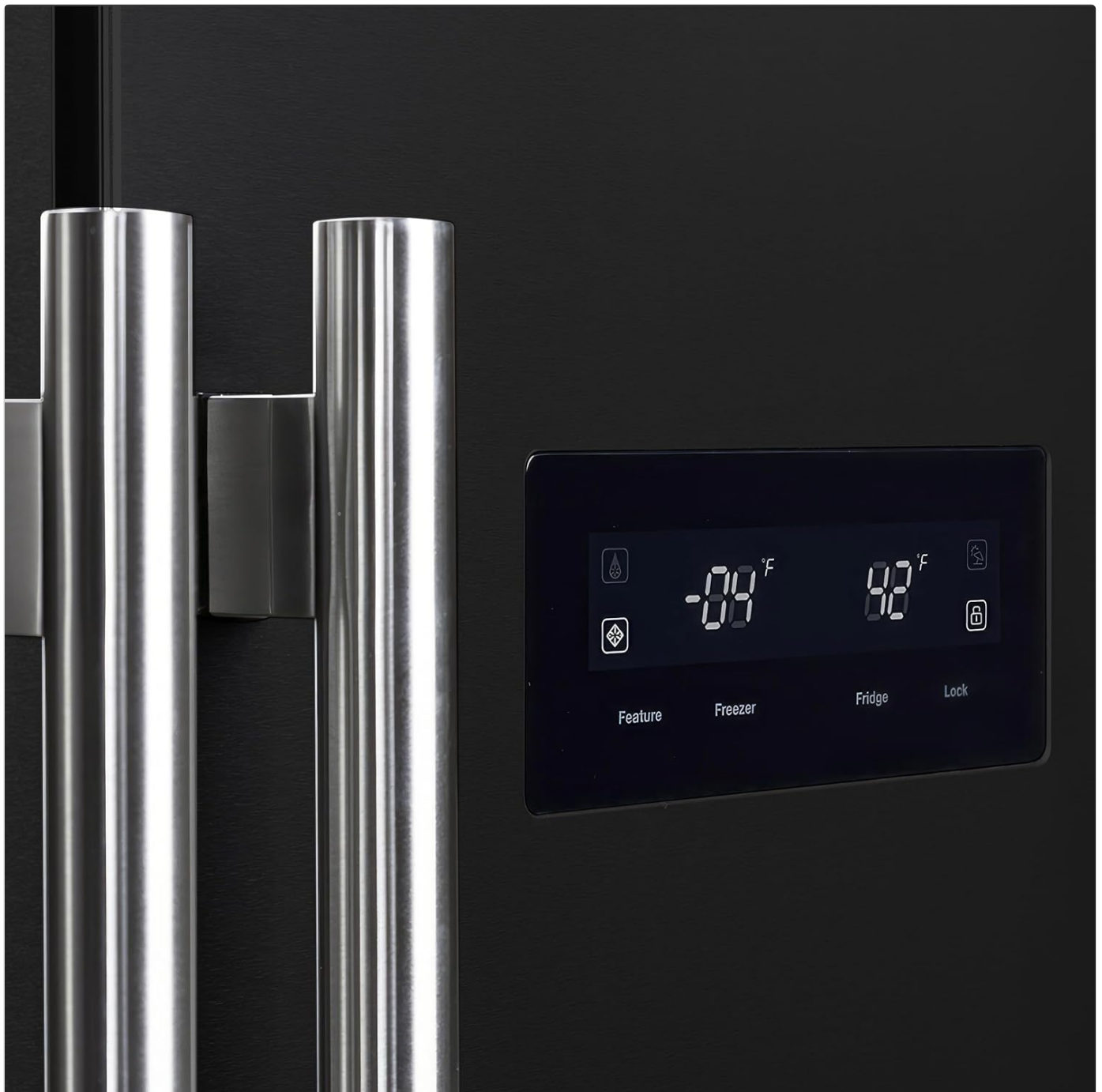
Figure 3: LED Touch Control Panel for temperature adjustment.