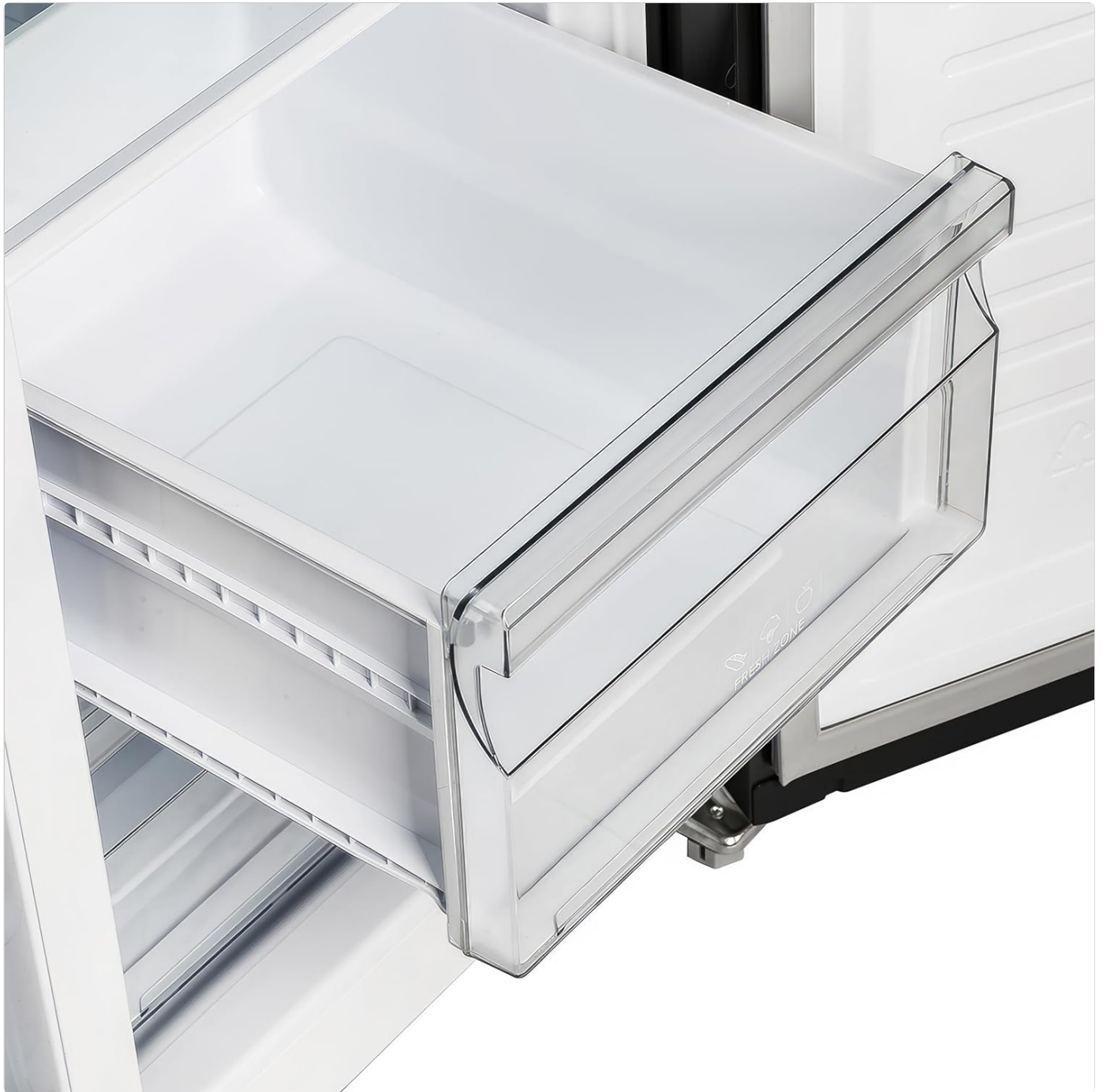
Figure 5: Detail of a crisper drawer for fresh produce.