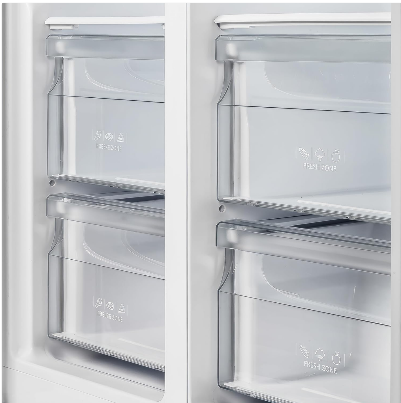
Figure 6: Detail of the freezer drawers.