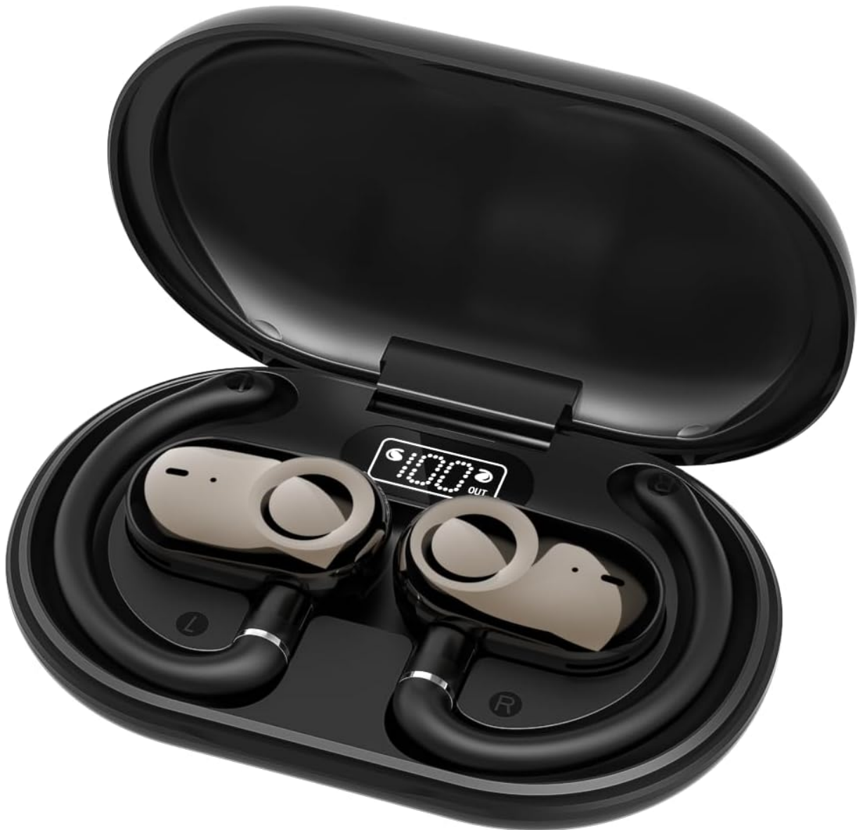
Image: URIZONS JM18 earbuds placed inside their charging case, showing the digital battery display indicating '100%' charge.

Image: Diagram illustrating the battery life of the earbuds (5 hours single charge) and the charging case (up to 20 hours total with case).