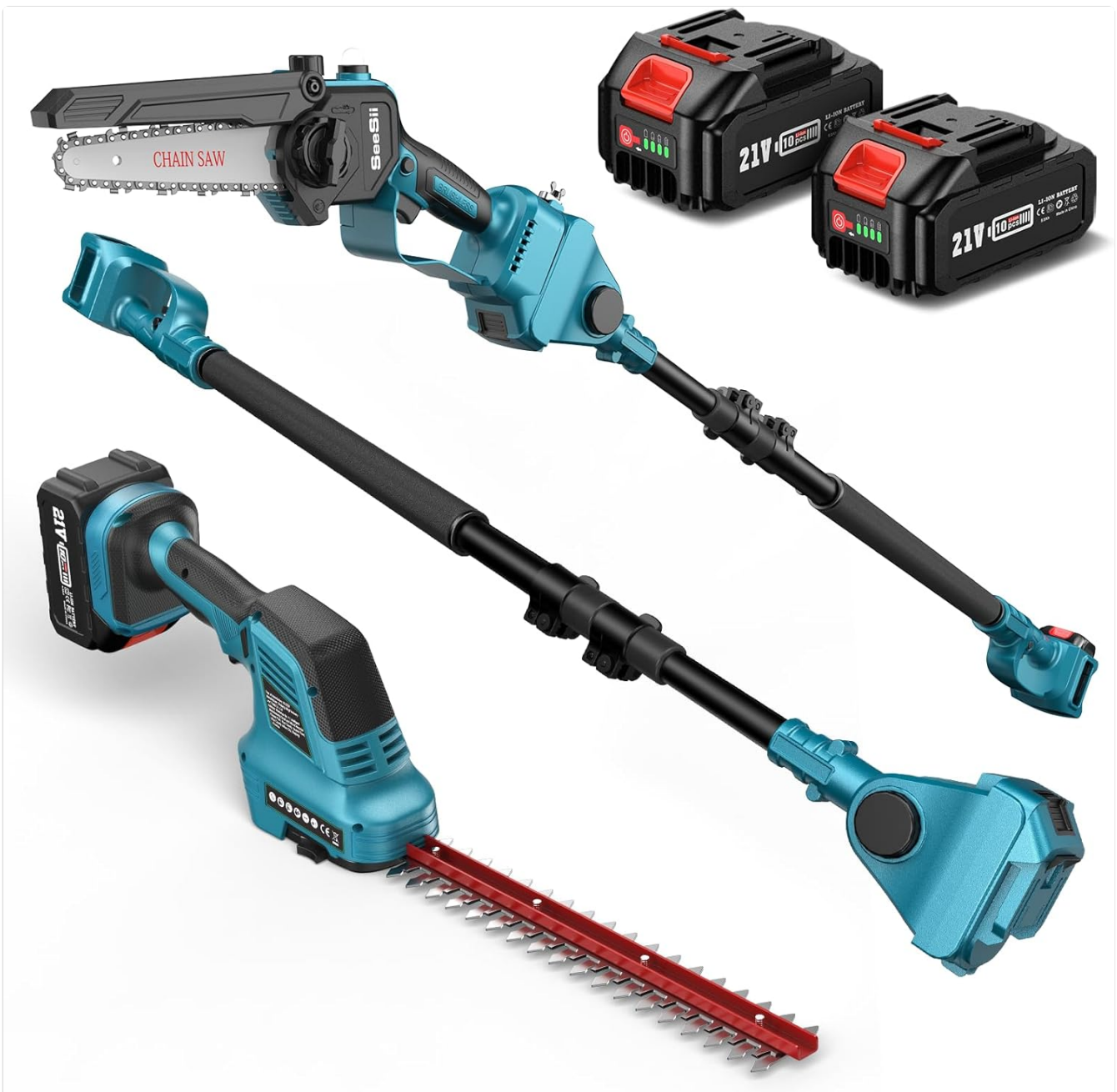
Figure 1: Complete SEESII 6-in-1 Combo Kit showing the pole saw, hedge trimmer, grass shears, and two batteries.

Your browser does not support the video tag.