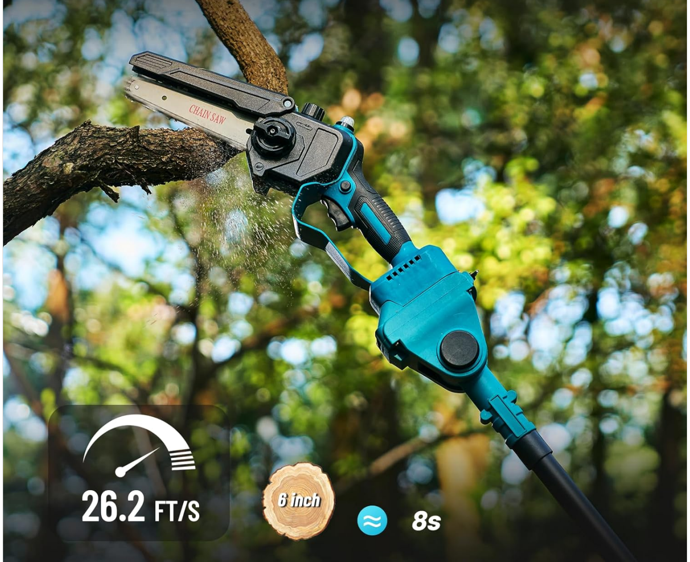
Figure 8: The mini chainsaw in action, demonstrating its cutting capability on a log.

Your browser does not support the video tag.