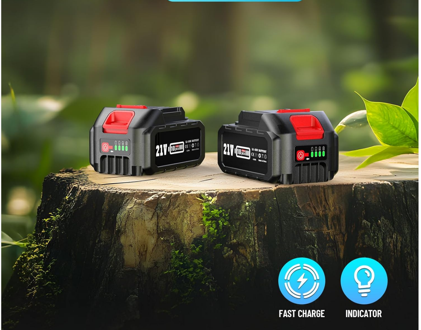
Figure 3: Two 4000mAh batteries with visible charge indicator lights, ready for use.

»»» Up To 100 Minutes Uninterrupted With Advanced 4000mAh *2 Batteries