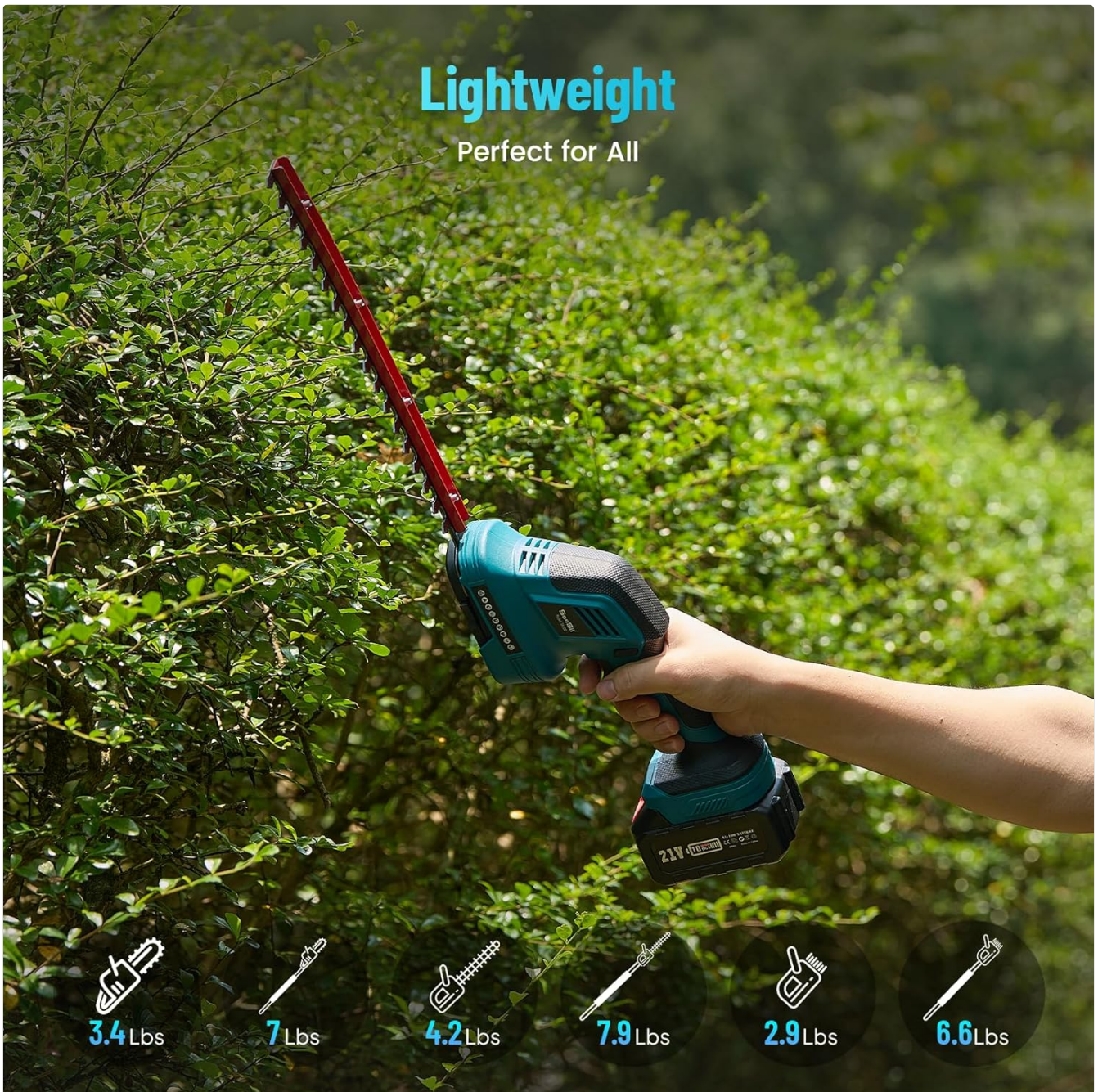
Figure 9: The handheld hedge trimmer in use, demonstrating its lightweight and ergonomic design for easy trimming.