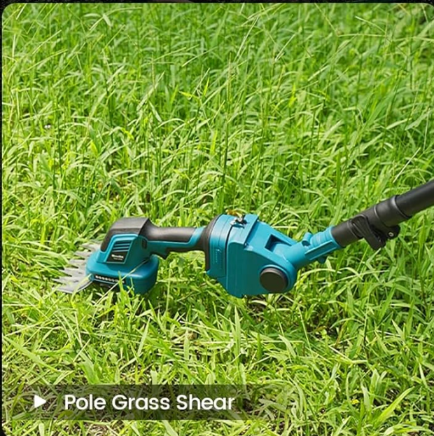
Figure 2: Detailed view of the various attachments: Pole Hedge Trimmer, Pole Saw, and Pole Grass Shear, highlighting their independent use.