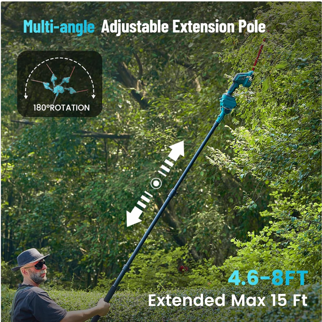
Figure 5: User demonstrating the multi-angle adjustable extension pole, which offers 180° rotation and extends up to 15 feet.

Your browser does not support the video tag.