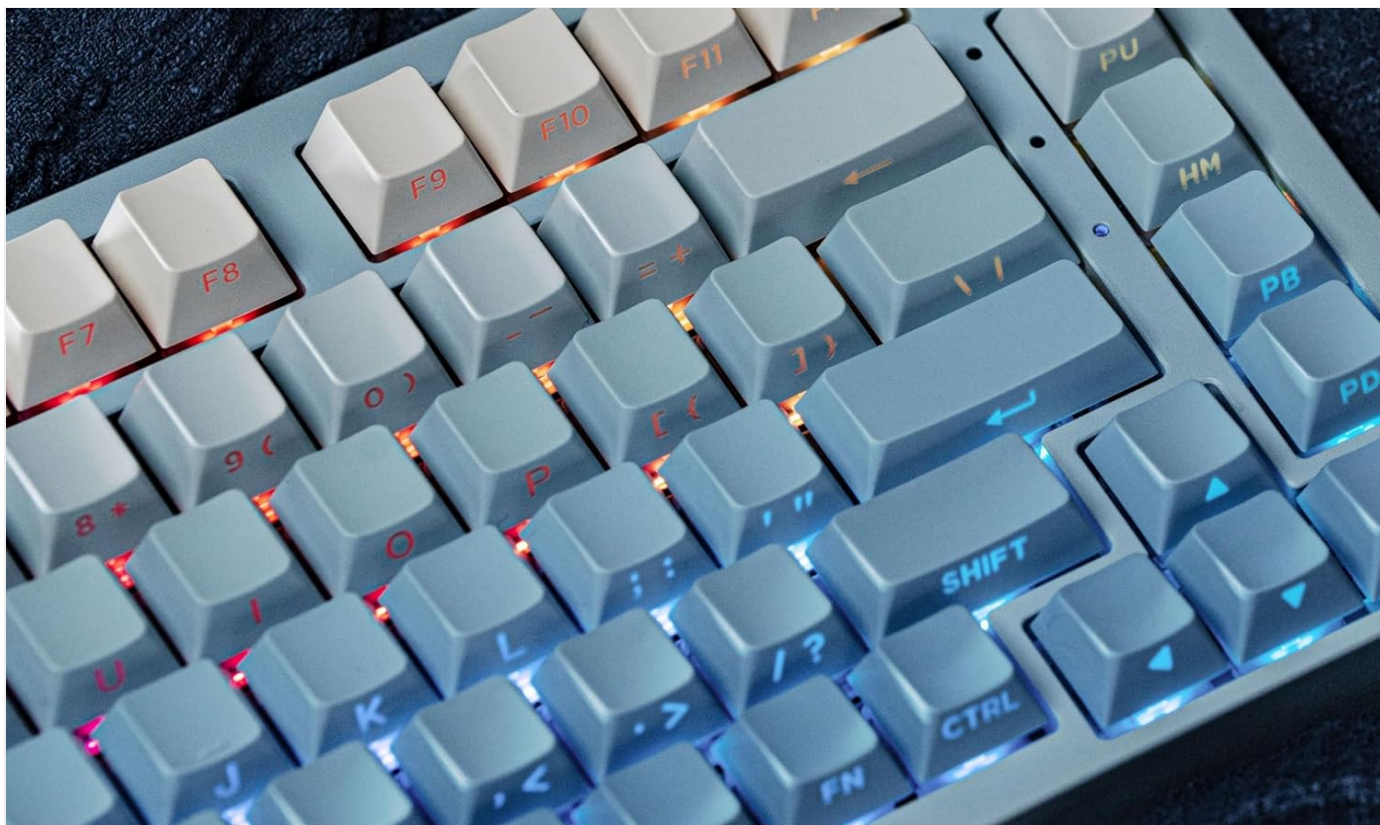
Image: Full layout of the 133-key Sky Blue PBT keycap set, showing all included keycaps and their arrangement.