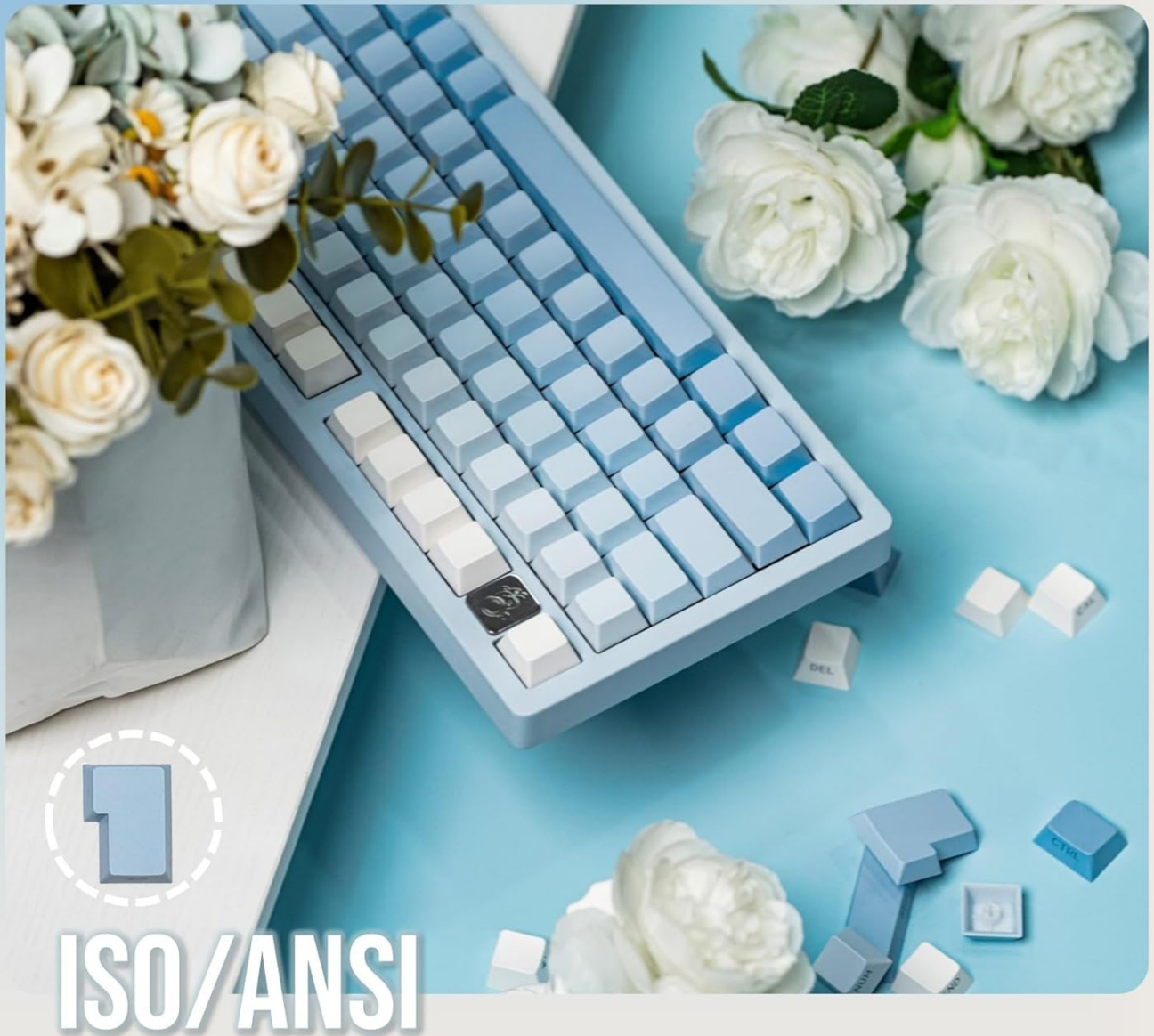
Image: EPOMAKER Sky Blue keycaps installed on a mechanical keyboard, demonstrating compatibility with various layouts including ISO and ANSI.