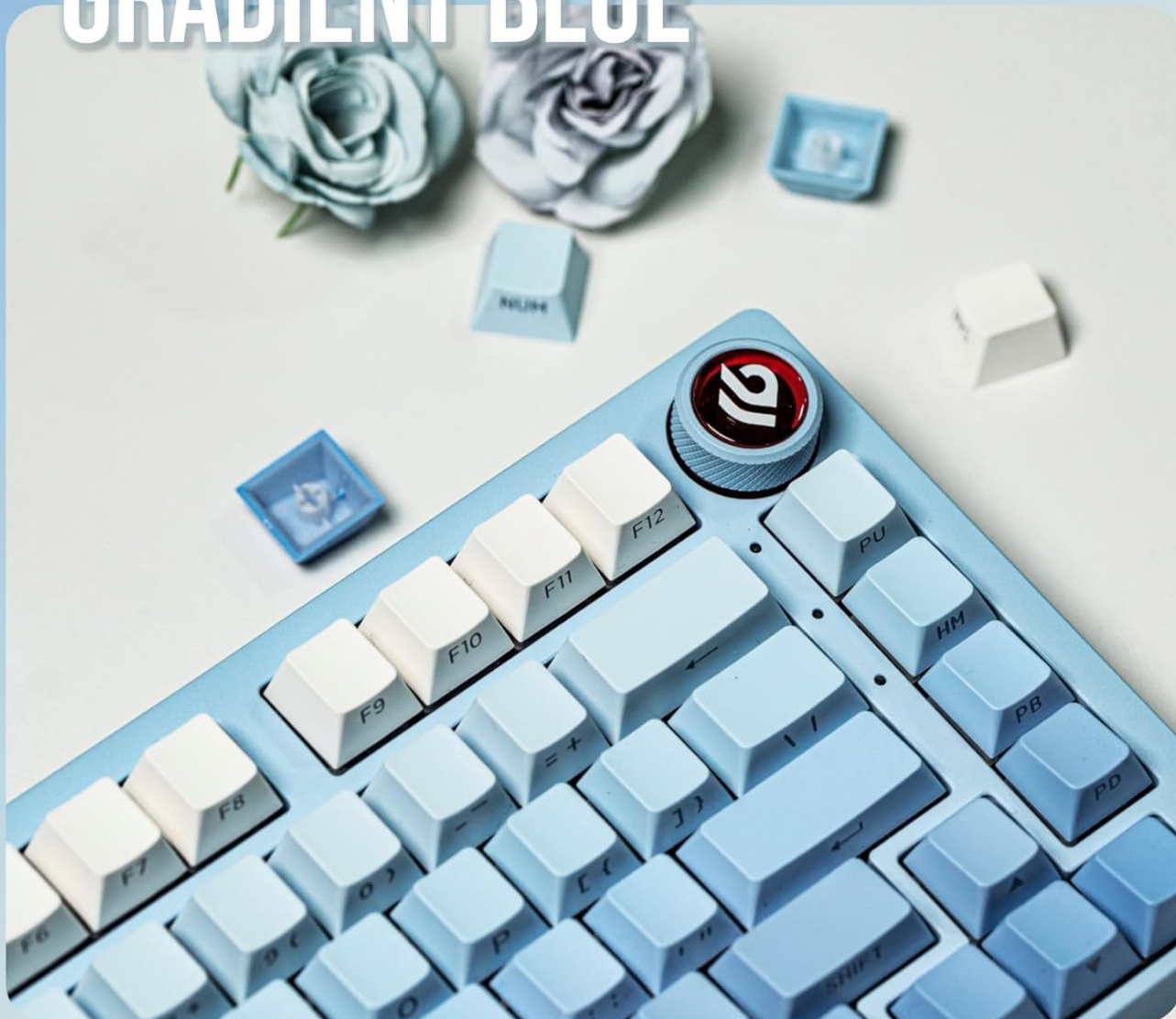
Image: A mechanical keyboard featuring the EPOMAKER Sky Blue keycap set, highlighting the gradient color scheme.