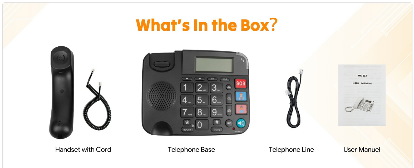
Image: Contents of the product package, including the handset with its coiled cord, the main telephone base unit, a telephone line cord, and the user manual.

Upon opening the package, verify that all the following items are included: