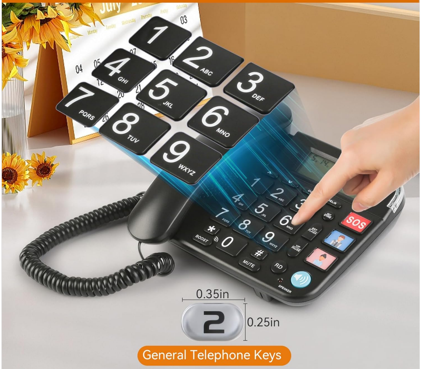
Image: A close-up view of the telephone's keypad, highlighting the large, easy-to-read buttons designed for quick and accurate dialing.