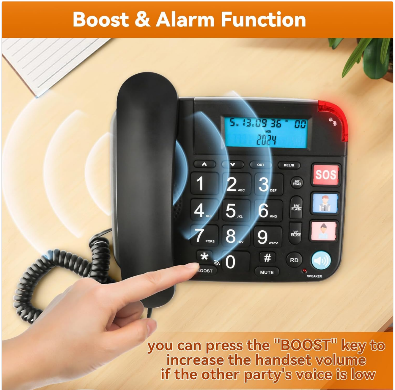
Image: A hand pressing the 'BOOST' button to amplify the handset volume, useful for individuals with hearing difficulties.