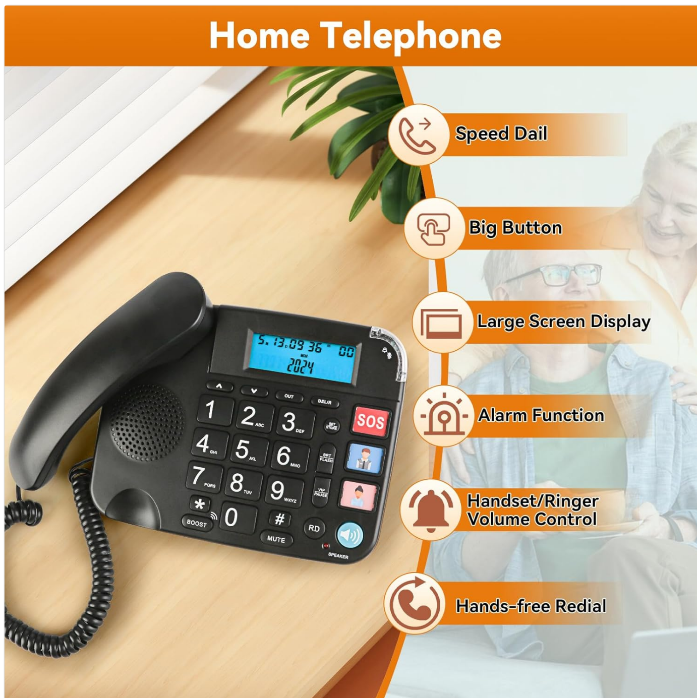
Image: An illustration pointing out the main features of the telephone, such as speed dial, large buttons, a large screen display, alarm function, adjustable volume for handset and ringer, and hands-free redial.