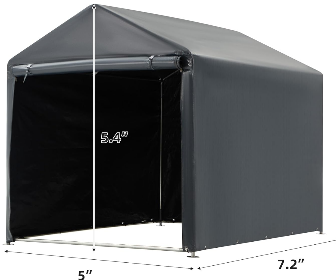
Image: The MELLCOM Portable Storage Shed 5x7ft, showcasing its overall design and size in an outdoor environment.