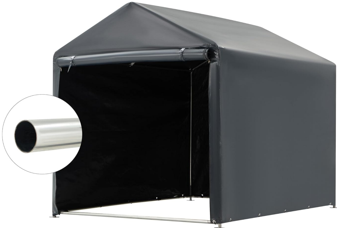
Image: Detailed views of the shed's features, including the durable zipper, securing buckle, and stable base plate.