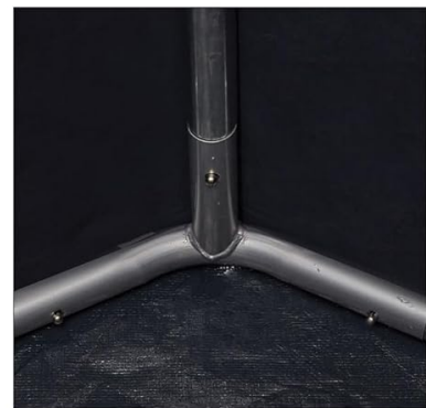
< Structure >

Image: Carport size diagram illustrating the width (7.2"), depth (5"), and height (5.4") of the shed.