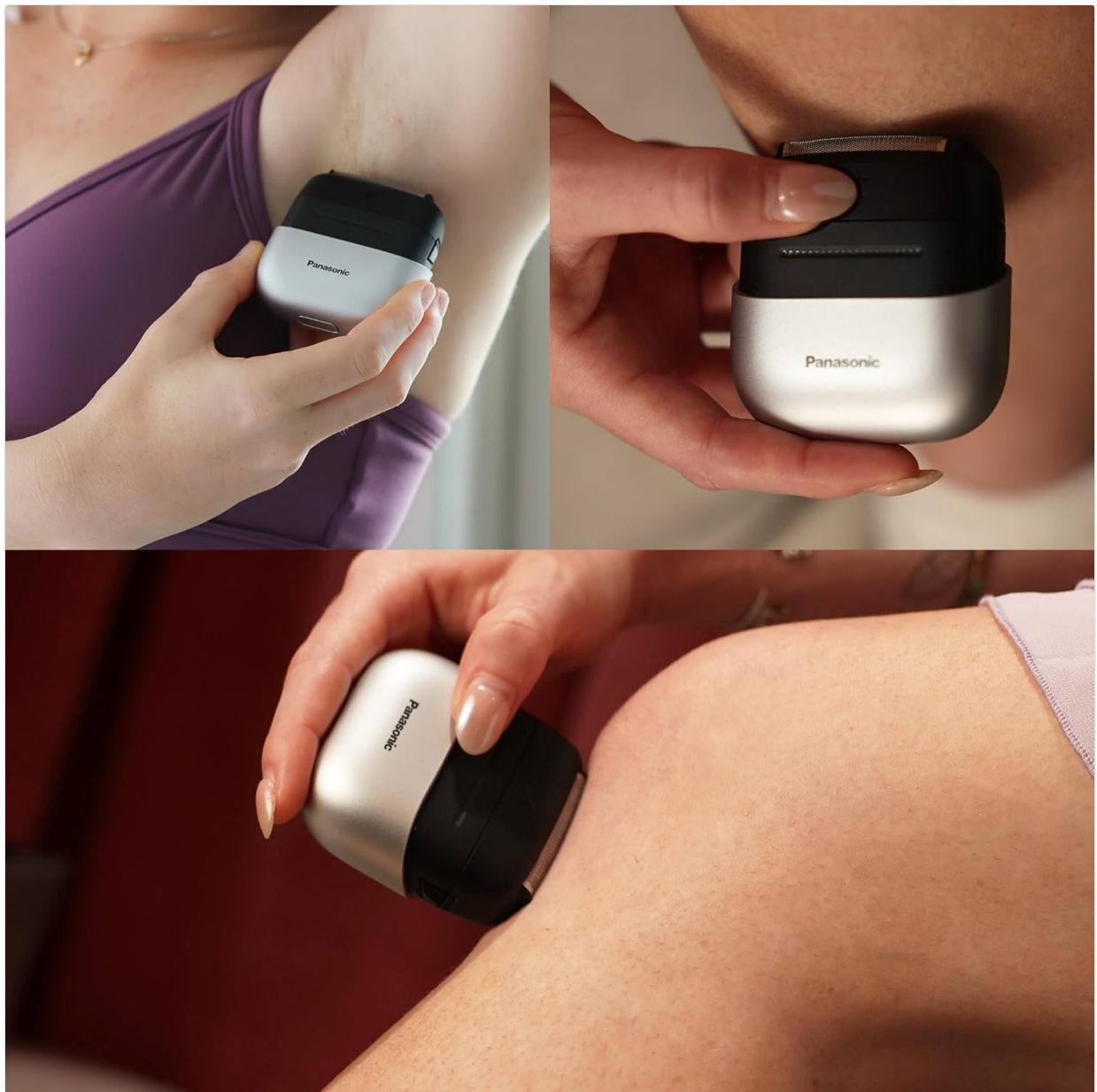
Image: A collage illustrating the versatile use of the shaver on different body areas, including armpits, face, and legs.