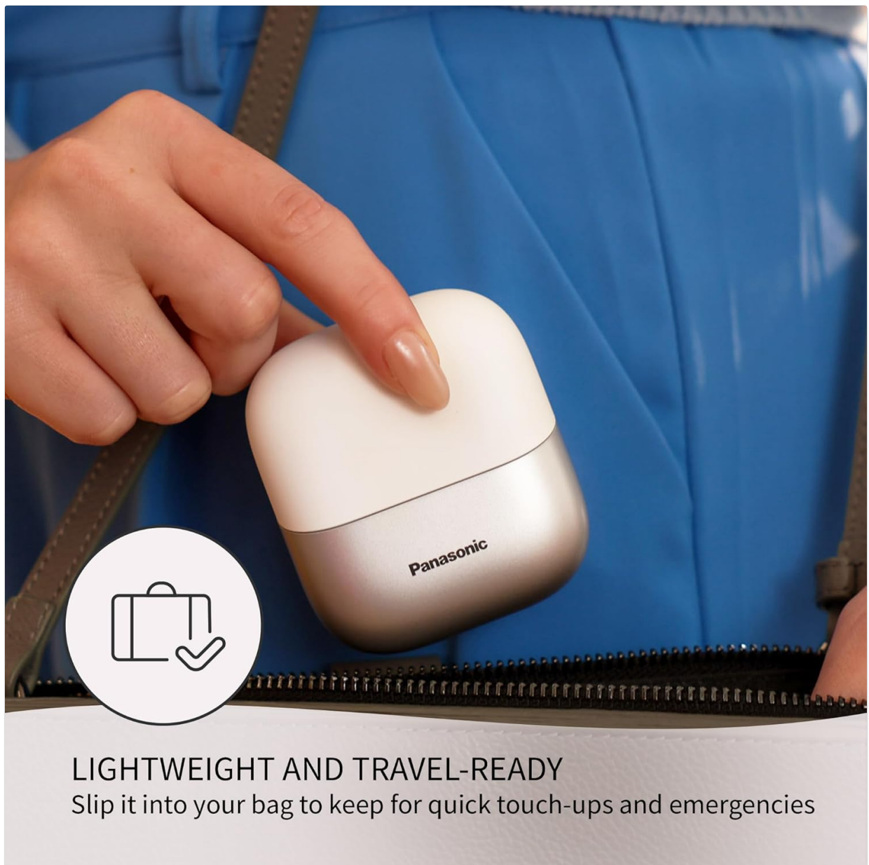
Image: The compact shaver being placed into a bag, emphasizing its portability and ease of storage for travel.