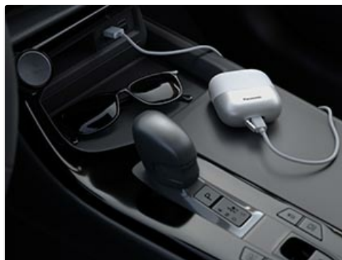
Image: The shaver being charged via USB-C in a car, highlighting its versatility for on-the-go charging.