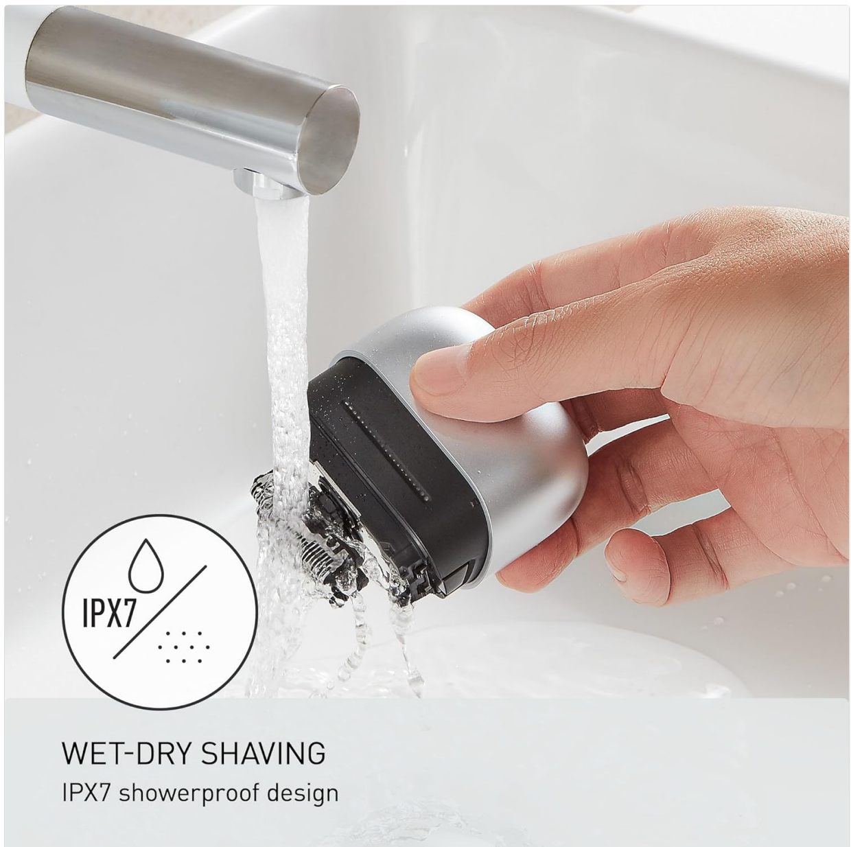
Image: The shaver head being rinsed under a faucet, demonstrating the ease of cleaning due to its waterproof design.