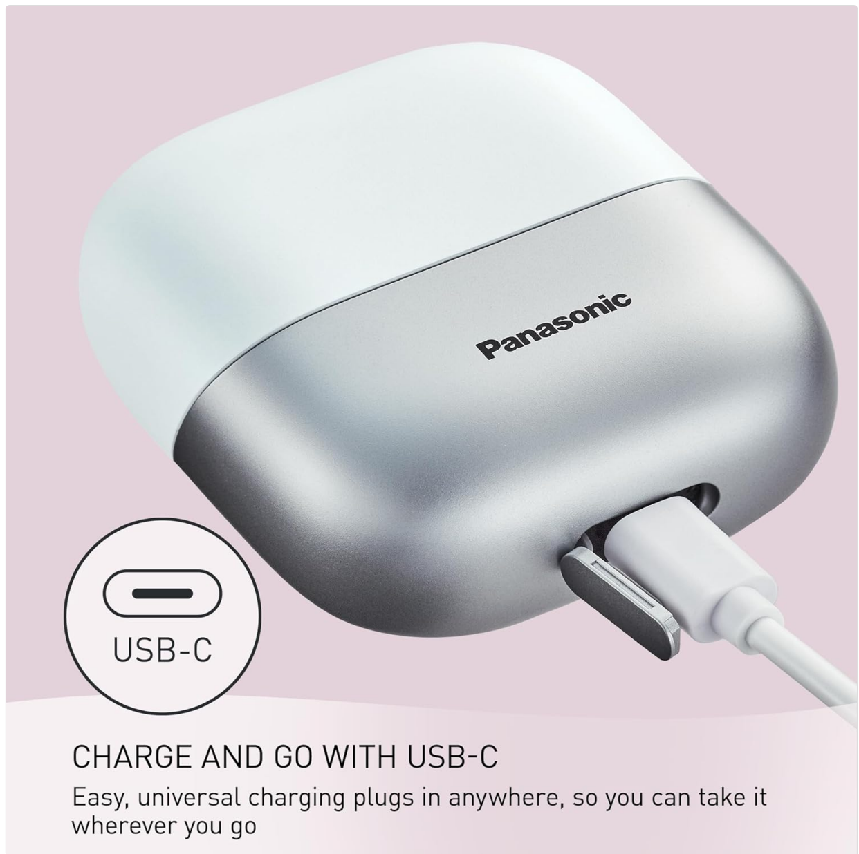
Image: The shaver connected to a USB-C charging cable, illustrating the charging process.