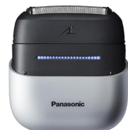
Image: The Panasonic ES-CM3A-W Travel Shaver, showcasing its compact design and highlighting features such as quick charging, effortless maneuverability, wet/dry shaving, and gentle blades for sensitive skin.

Hypoallergenic stainless steel blades minimizes sensitivity