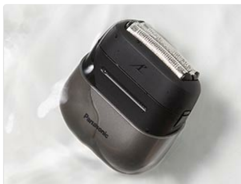
Image: Another view of the shaver being rinsed under water, emphasizing its suitability for shower use and easy cleaning.