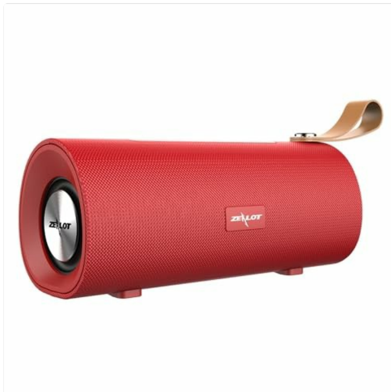
Figure 1: Front view of the ELECTROPRIME Zealot S30 Portable Bluetooth Speaker, showcasing its red finish and integrated leather carrying strap.

Thank you for choosing the ELECTROPRIME Zealot S30 Portable Bluetooth Speaker. This manual provides essential information for setting up, operating, and maintaining your speaker to ensure optimal performance and longevity. Please read this manual thoroughly before using the product.