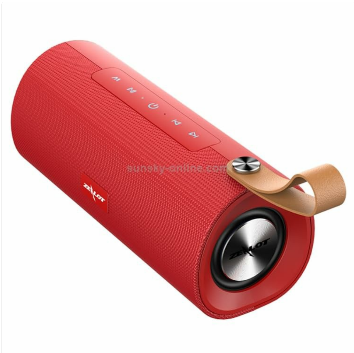
Figure 3: Top view of the Zealot S30 speaker, highlighting the control panel with buttons for playback and mode selection.

The Zealot S30 speaker features intuitive controls located on its top panel. While specific button functions may vary slightly, common operations include: