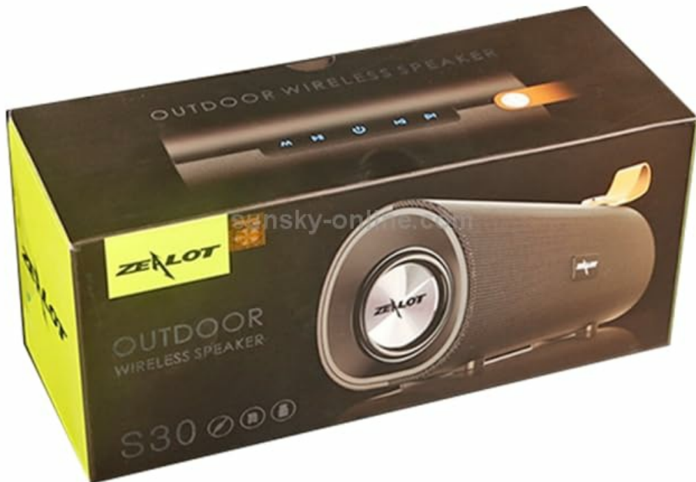
Figure 2: The retail packaging for the Zealot S30 speaker, indicating its "Outdoor Wireless Speaker" designation.