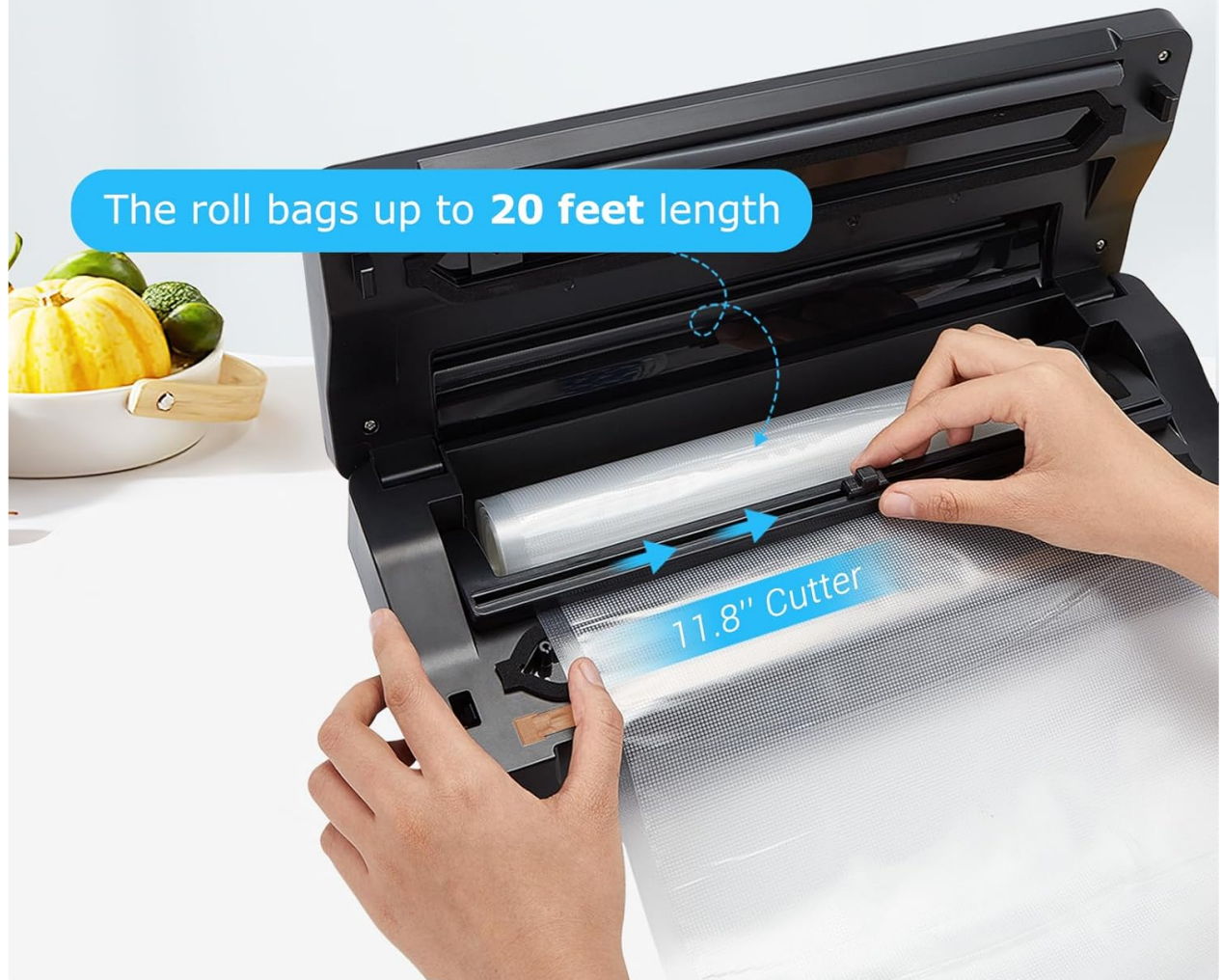
Image: Close-up view of the vacuum sealer's integrated bag roll storage and the 11.8-inch built-in cutter.