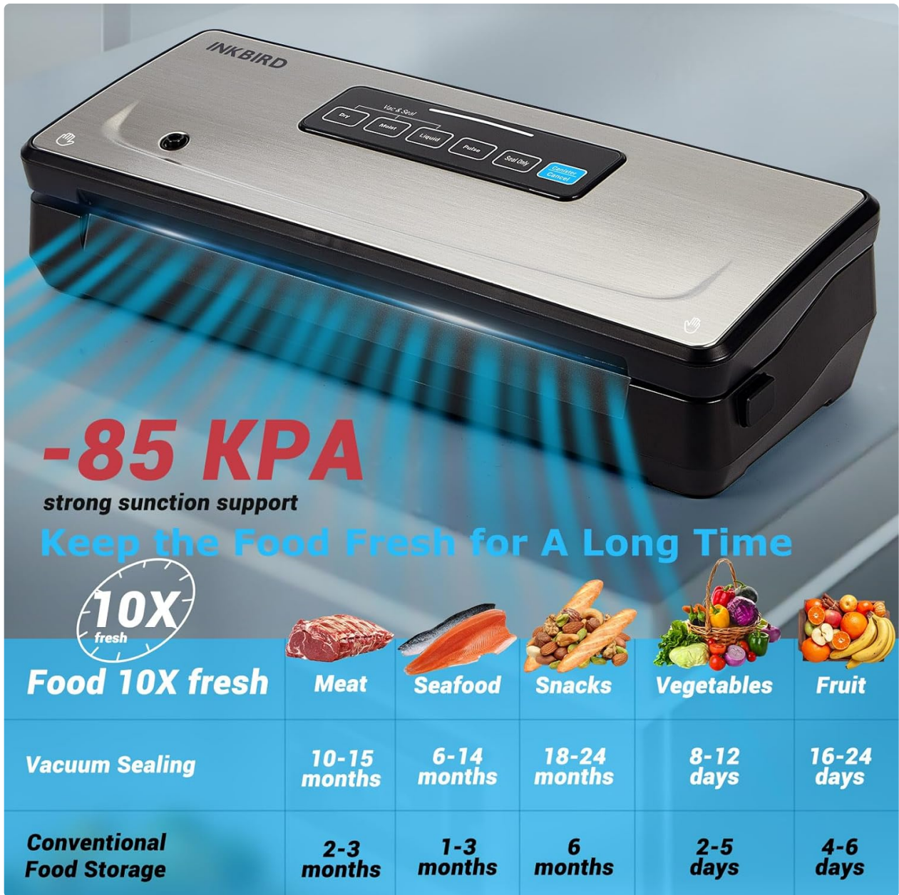
Image: A graphic illustrating the powerful -85KPA suction and a table comparing vacuum-sealed food freshness duration versus conventional storage for various food types.