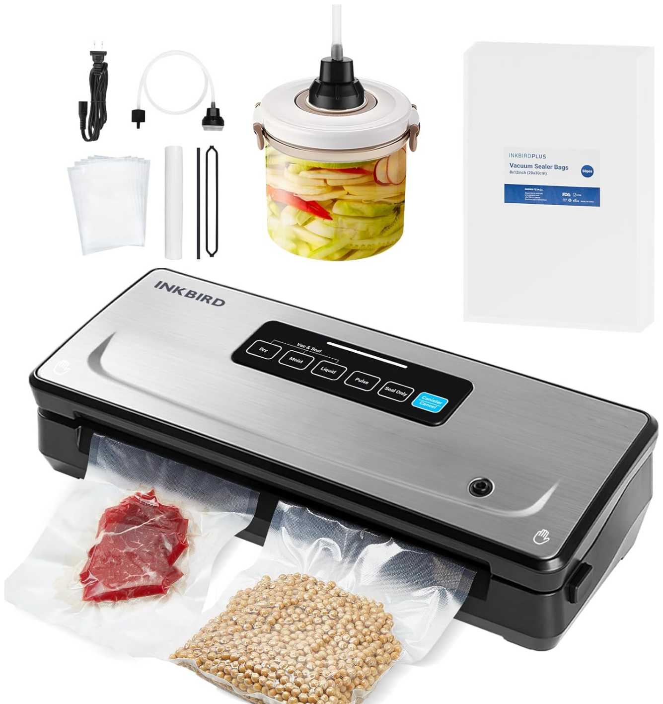
Image: The Inkbird Vacuum Sealer Machine shown with its complete set of accessories, including vacuum bags, a roll, and an air suction hose.