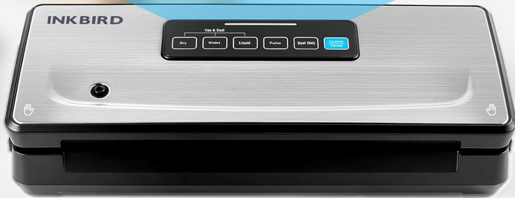
Image: The control panel of the Inkbird Vacuum Sealer highlighting the six distinct food modes: Dry, Moist, Liquid, Pulse, Seal Only, and Canister.