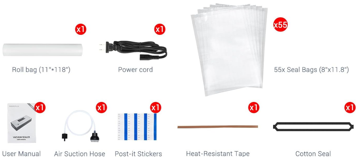
Image: A visual representation of all items included in the Inkbird Vacuum Sealer starter kit, such as the machine, bags, roll, and accessories.