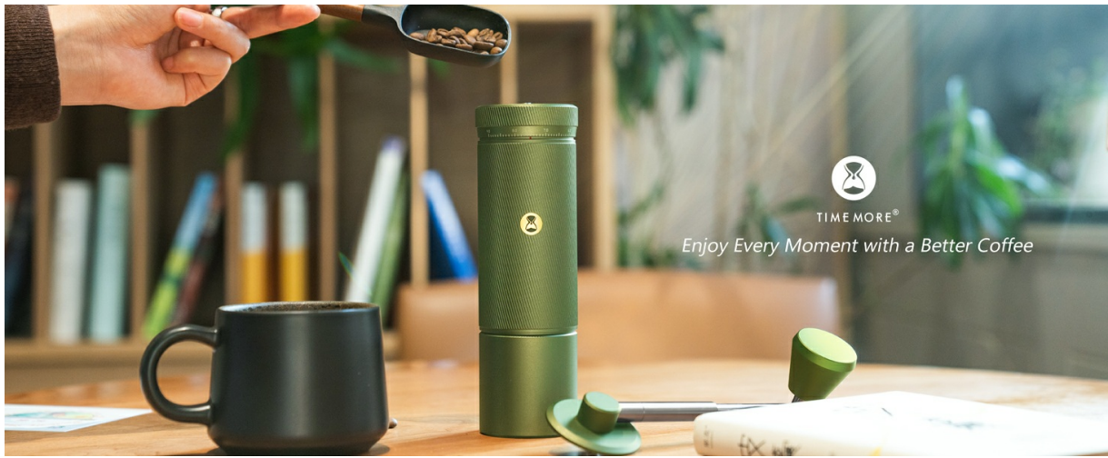
Image: The foldable handle design for compact storage and portability.