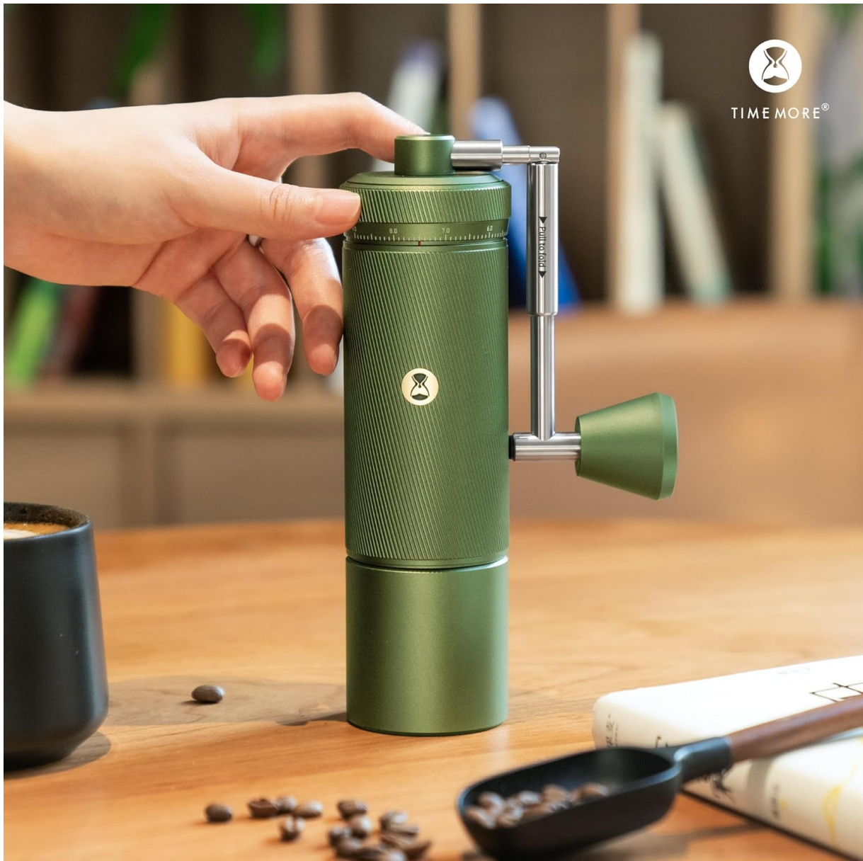
Image: The TIMEMORE S3 grinder being used to grind coffee, demonstrating its ergonomic design.