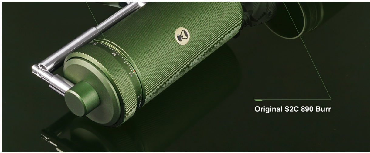
Original S2C 890 Burr