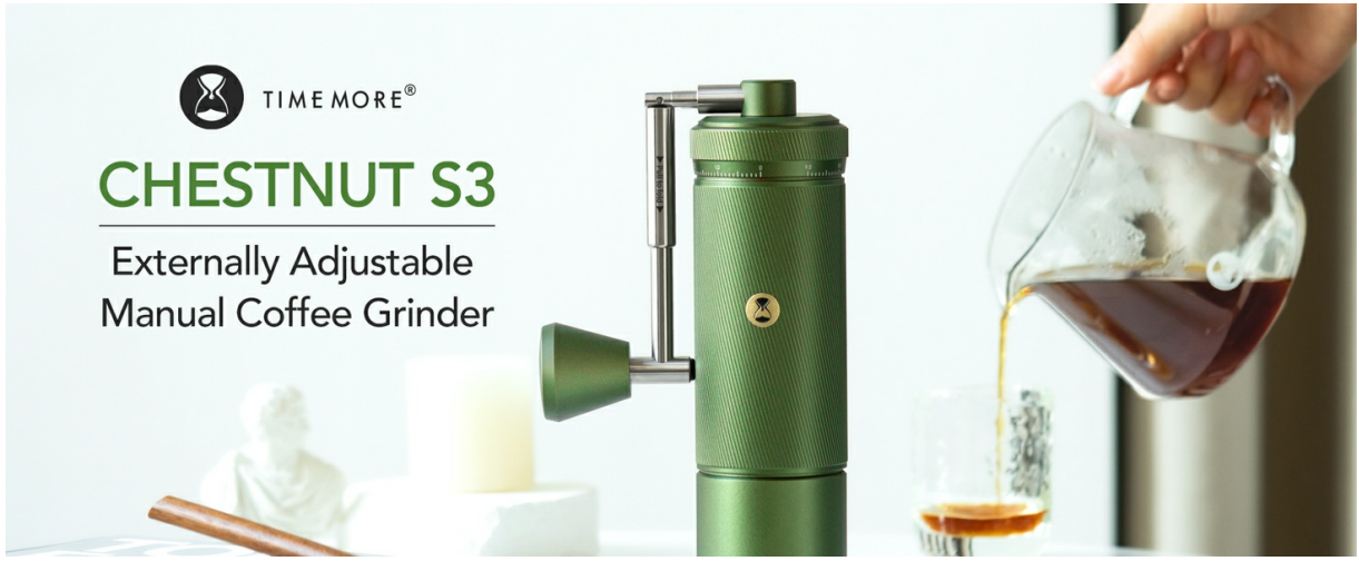
Image: The external adjustment lens ring allows for precise grind size changes.

Externally Adjustable Manual Coffee Grinder