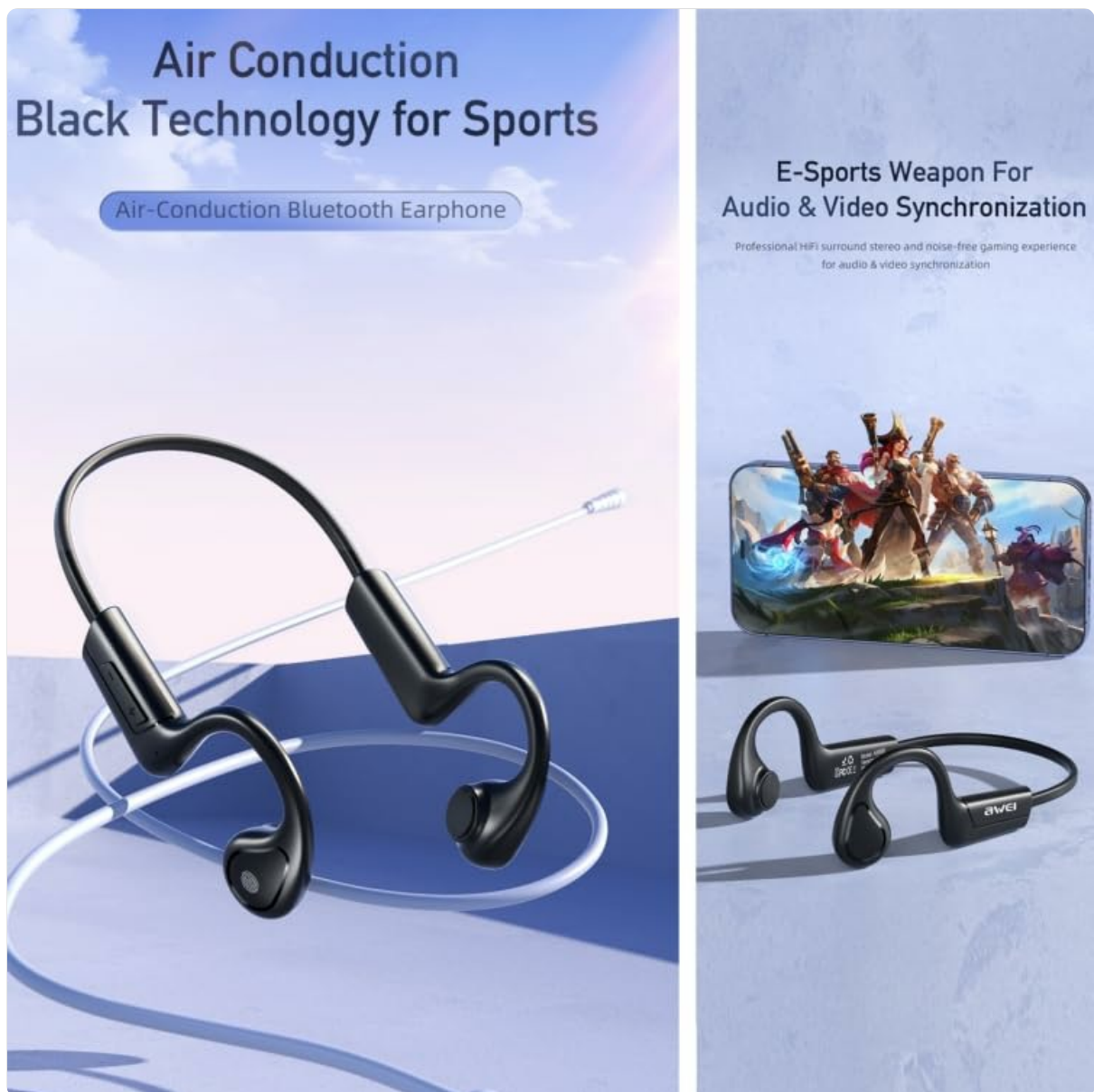
Image 4.2: Visual representation of the headset's air conduction technology and its suitability for synchronized audio and video experiences, such as e-sports.