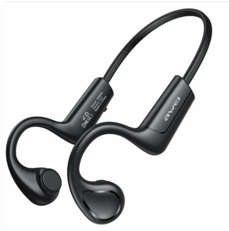
Image 1.1: The ELECTROPRIME A886BL Air Conduction Sports Wireless Headset, showcasing its lightweight, open-ear design.

The ELECTROPRIME A886BL Air Conduction Sports Wireless Headset is designed for comfort and performance during physical activities. Utilizing air conduction technology, it allows you to enjoy audio while remaining aware of your surroundings. This manual provides essential information for setup, operation, and maintenance of your headset.