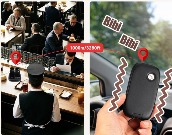
Image: Long range capability of the pager system, illustrating signal reach from a restaurant to a customer in a car.

The restaurant pager system has an ultra-long calling range, allowing customers to wait comfortably in their cars. It is very suitable for food courts, large supermarkets and similar large venues.