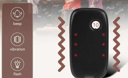
Image: The seven distinct alert modes available on

Random combination of beep, vibration and flash