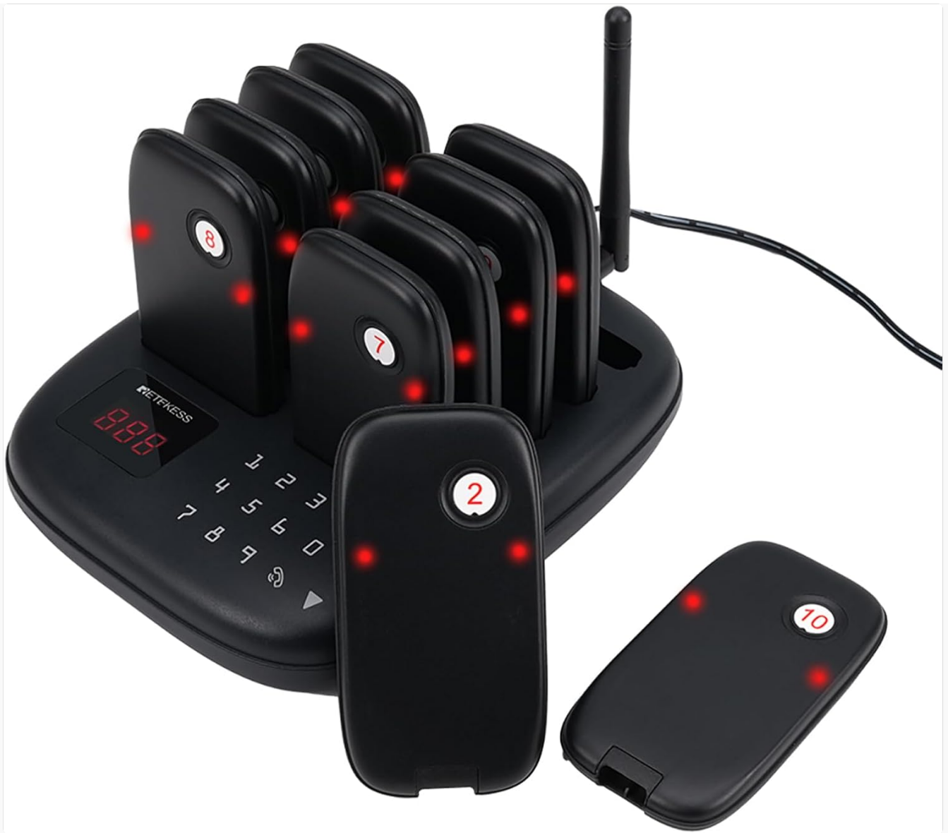
Image: The Reteless TD175S system, showing the main transmitter base with multiple pagers docked, and two pagers held separately.