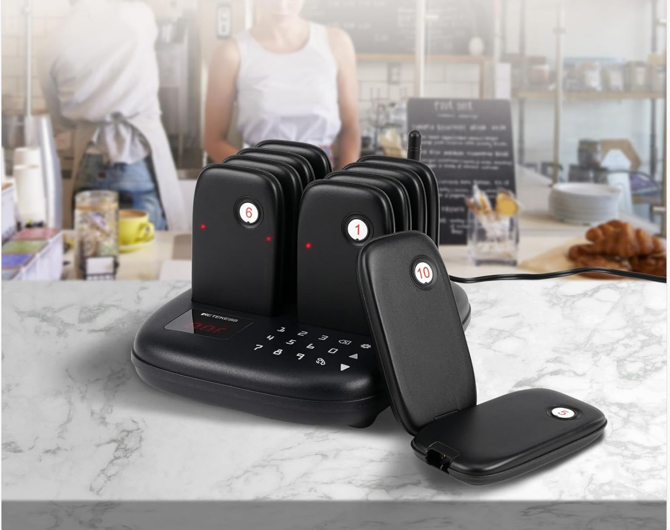
Image: The transmitter base with pagers docked, demonstrating the ease of use and charging functionality.

Charging slots provide power whenever you put the pager on the base