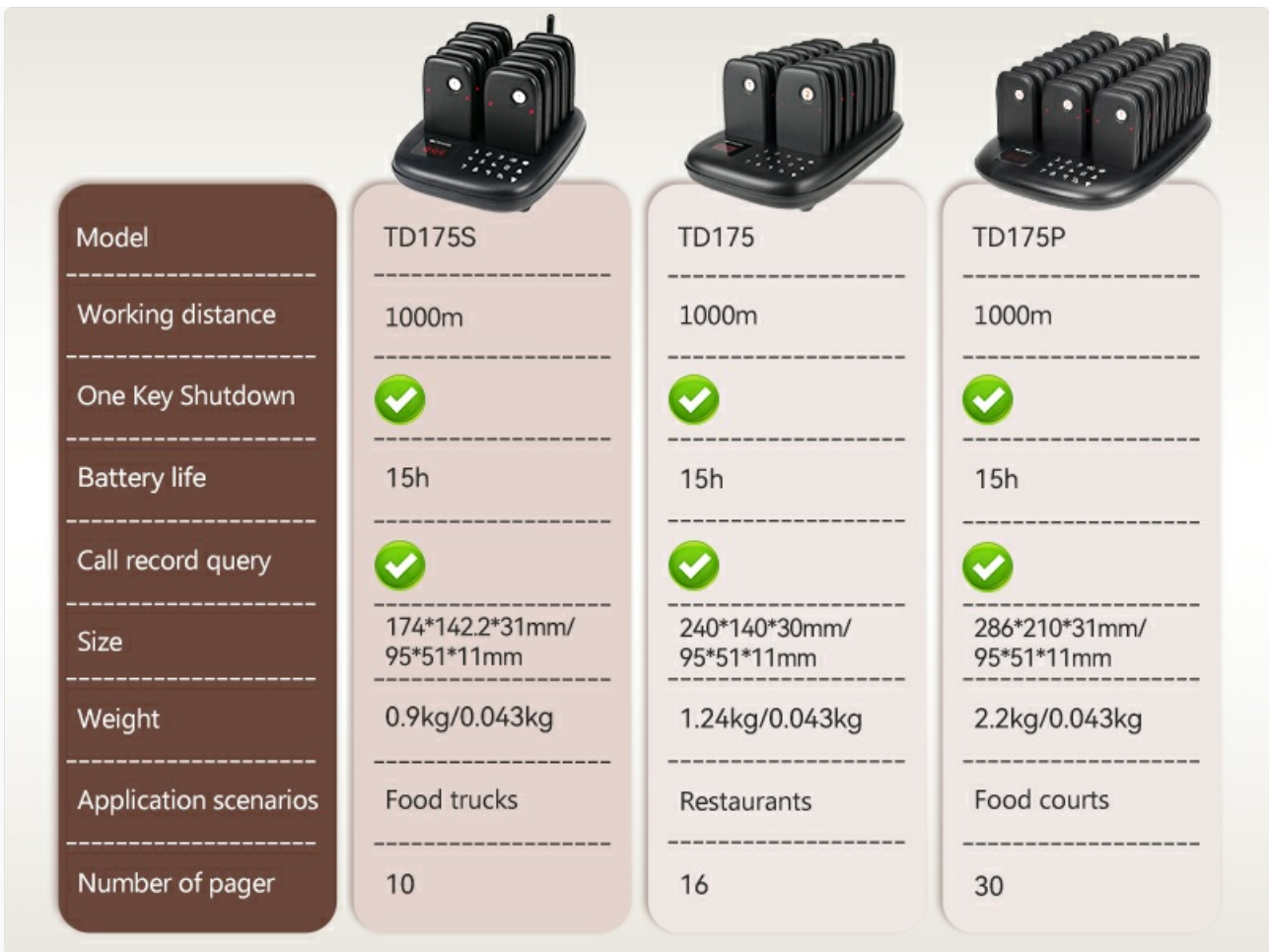
Image: A comparison table detailing specifications across different Reteless TD175 models.