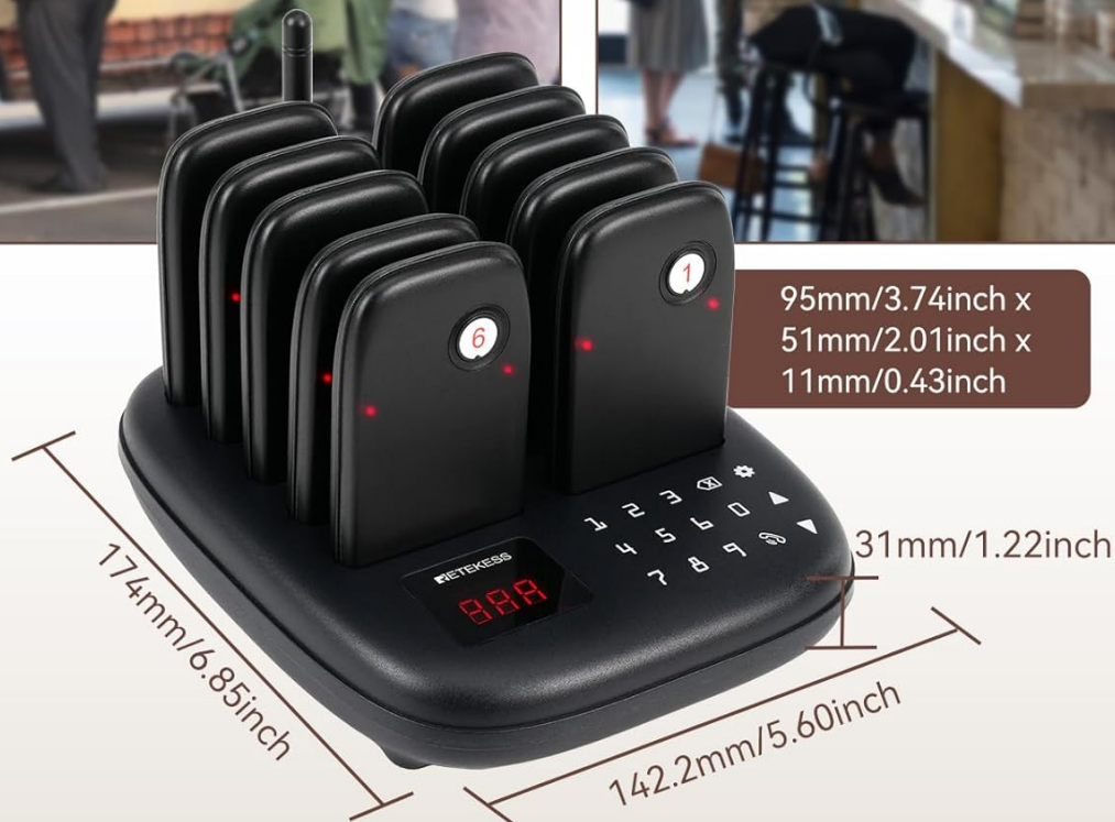
Image: The keypad of the transmitter, emphasizing its durable and easy-to-clean design.