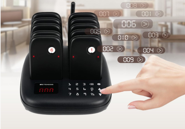
Image: Details on the pager's 200mAh battery and its 15-hour standby duration.