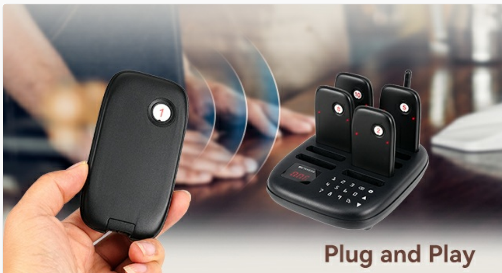
Image: Instructions for performing a one-key shutdown of all pagers.

To power off all pagers simultaneously, enter "999" on the transmitter keypad and then press the Call key (phone icon).