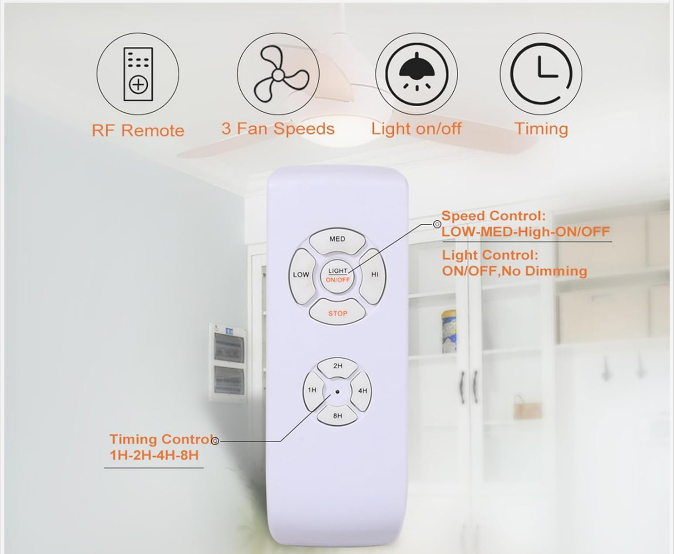
Image: Close-up of the remote control, highlighting the fan speed buttons (LOW, MED, HI, STOP), light ON/OFF button, and timing buttons (1H, 2H, 4H, 8H).