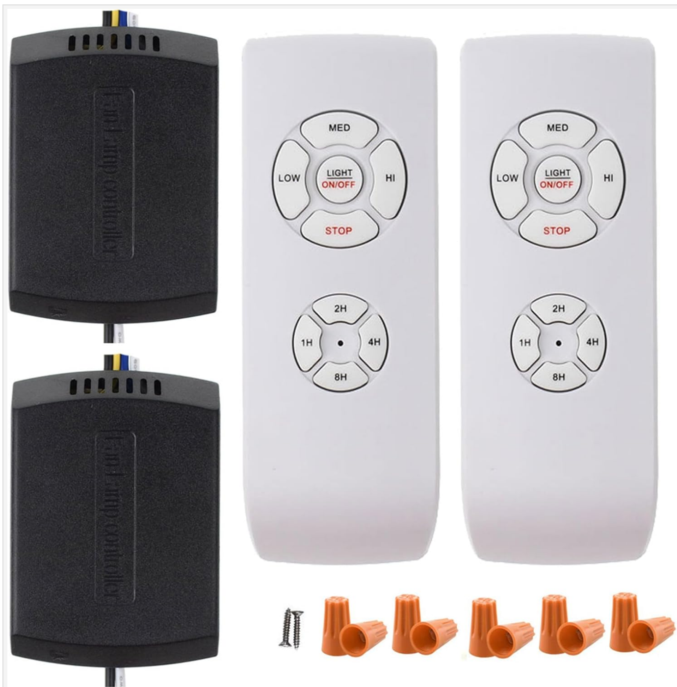
Image: The complete kit contents, including two white remote controls, two black receiver units, orange wire nuts, and small mounting screws.