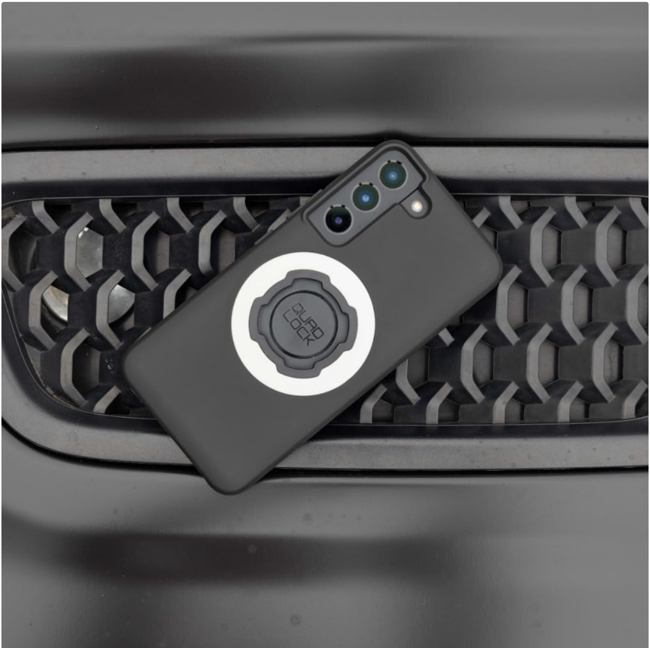
The Quad Lock MAG Phone Case magnetically attached to a surface, demonstrating its secure hold.