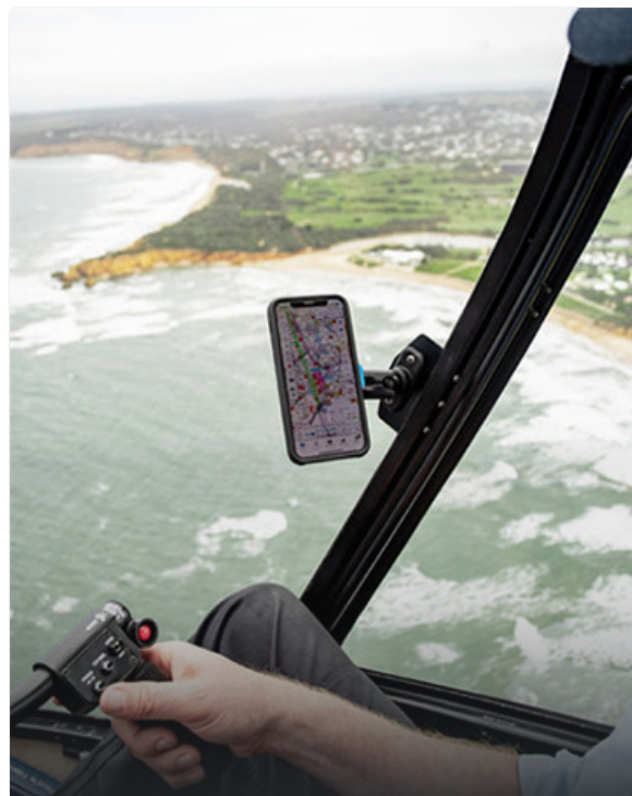
A close-up view of the Quad Lock MAG Phone Case, highlighting its design and the integrated MAG ring.