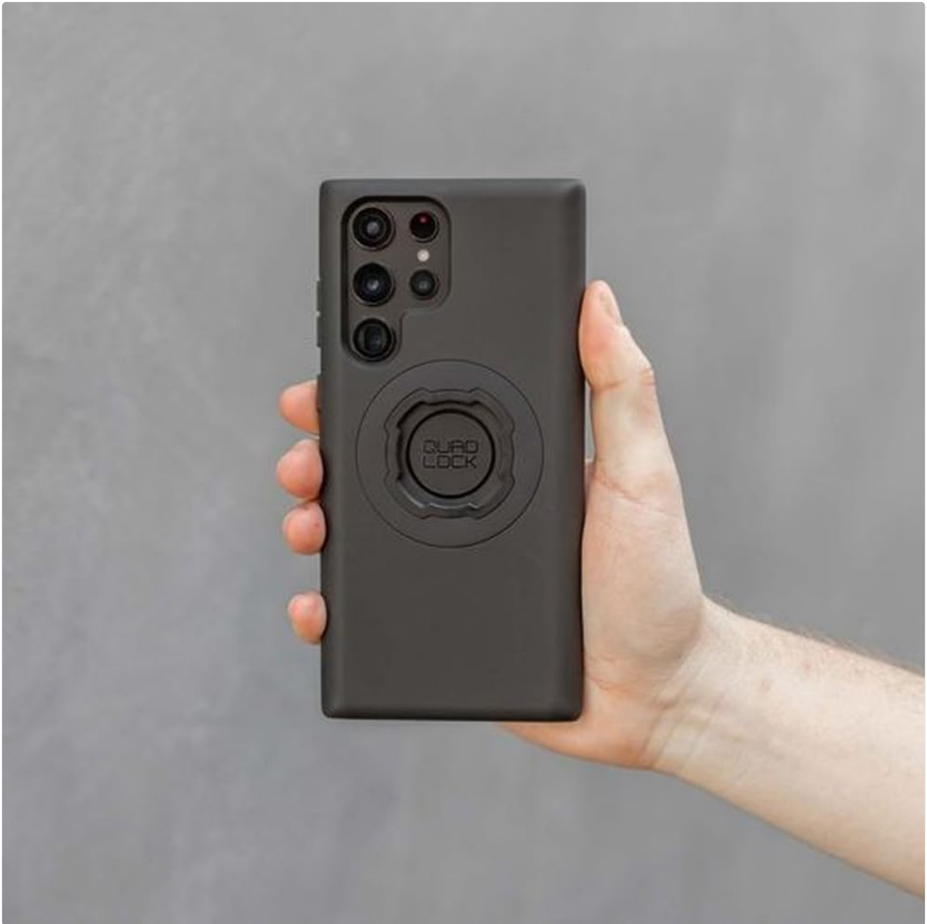
A hand holding a phone equipped with the Quad Lock MAG Case, showcasing its slim profile.