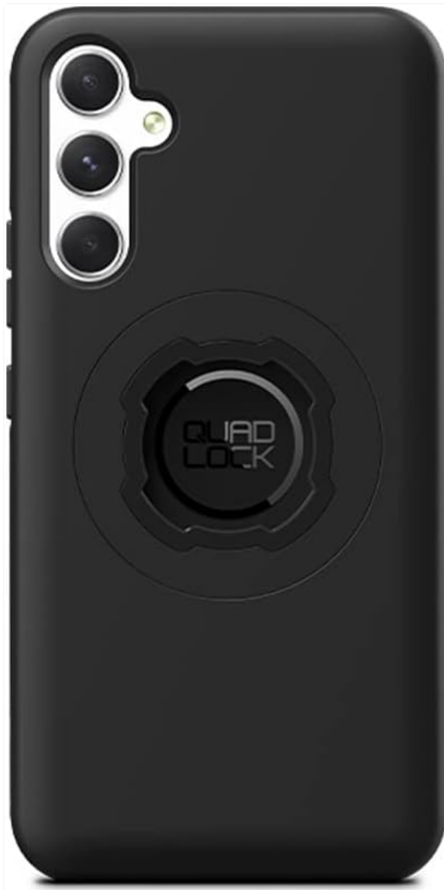
Front view of the Quad Lock MAG Phone Case installed on a Samsung Galaxy A35.