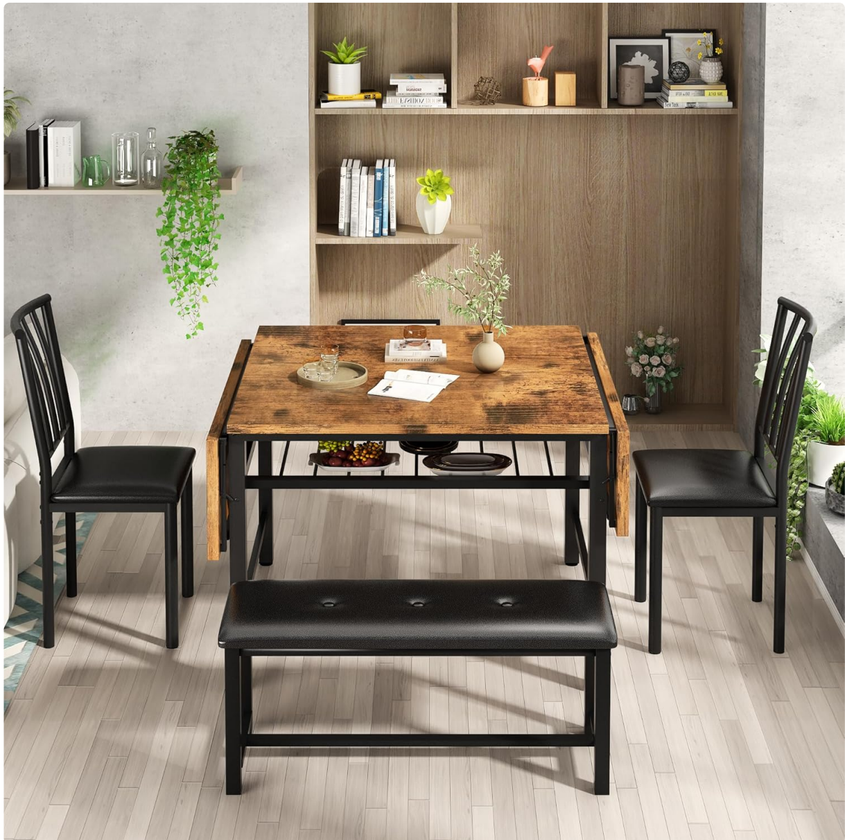
Image 4.1: The dining table in its compact configuration, ideal for smaller areas.