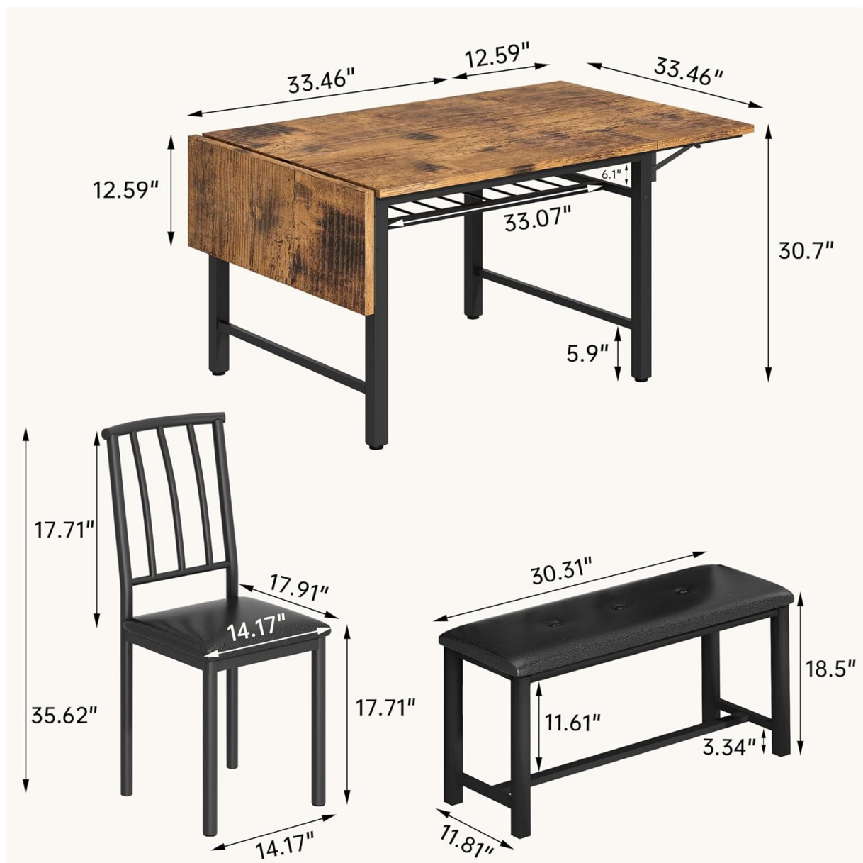
Image 3.1: Detailed dimensions for the table (compact and extended), chairs, and bench to assist with assembly and space planning.