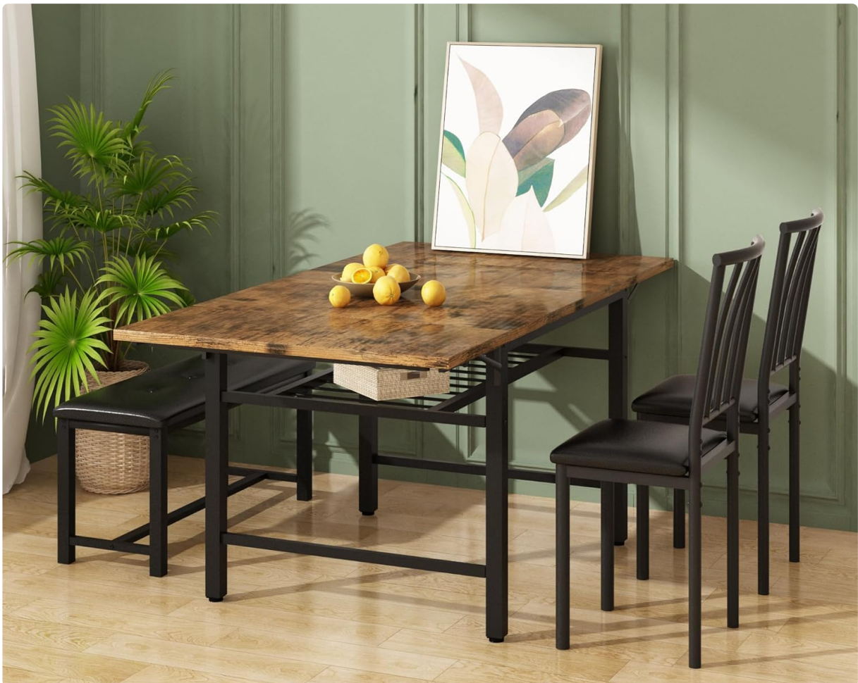
Image 1.1: The Lamerge 4-Piece Extendable Dining Table Set shown in its fully extended configuration within a dining room environment.

This manual provides instructions for the assembly, operation, and maintenance of your Lamerge 4-Piece Extendable Dining Table Set. This set includes one extendable dining table, two backrest chairs, and one bench, designed for versatile use in dining rooms or kitchens.