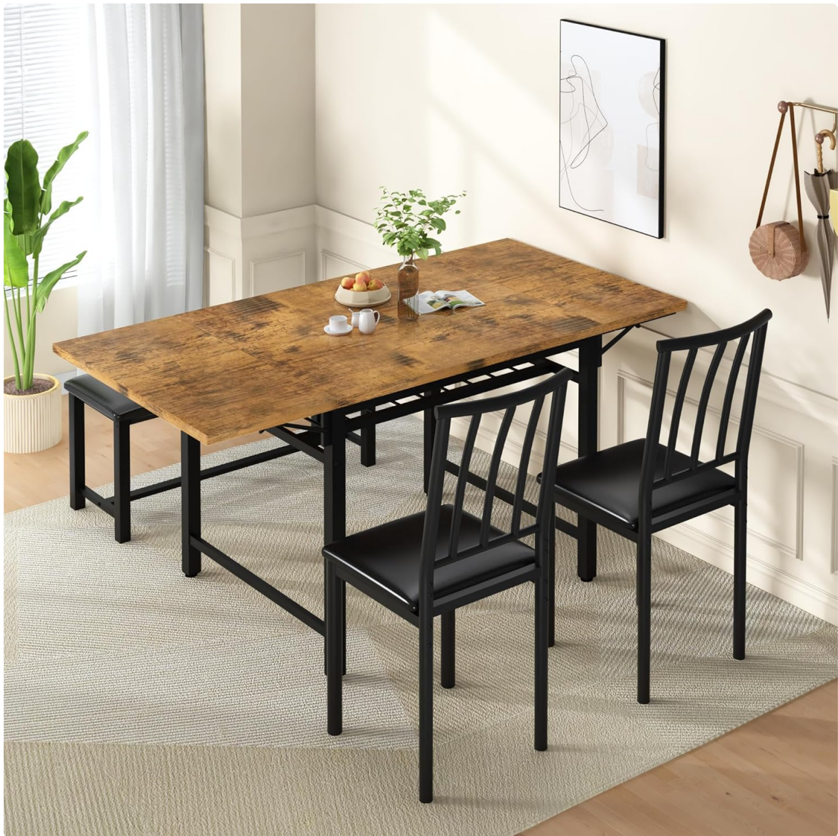
Image 4.2: The dining table in its extended configuration, offering increased surface area for dining or other activities.