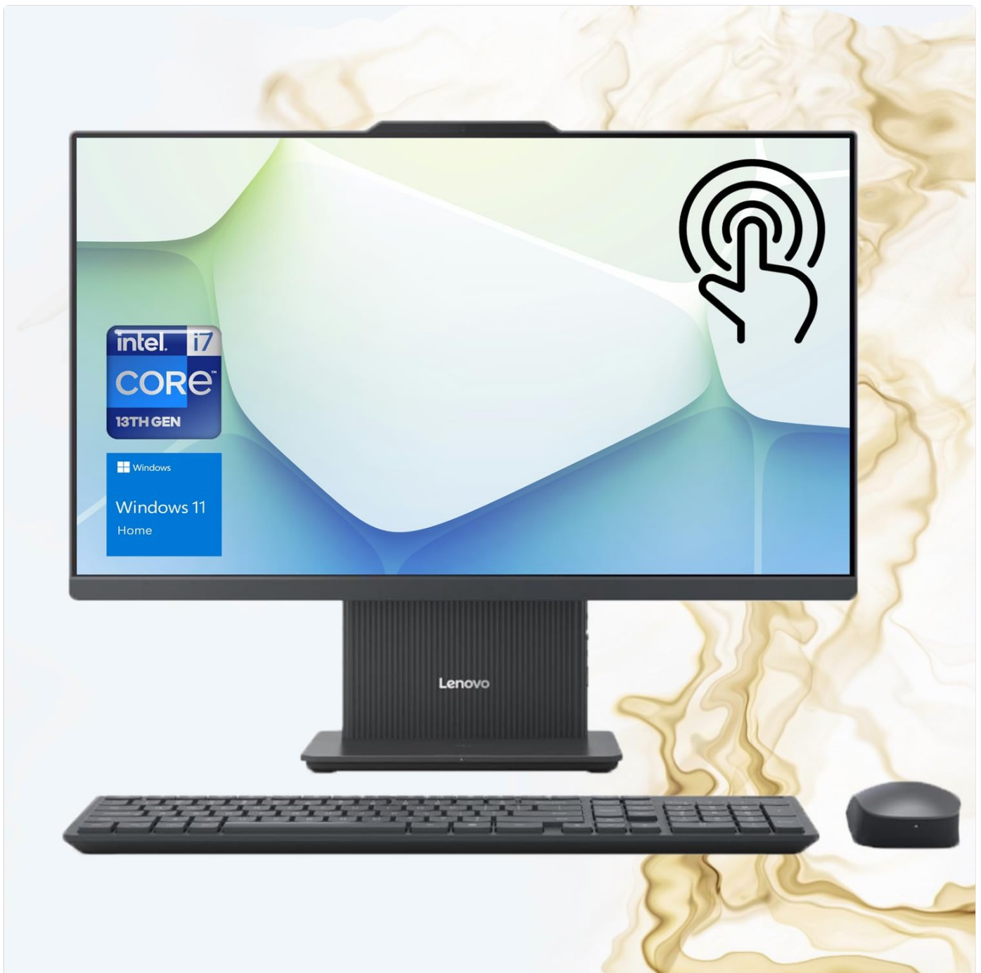
Figure 1: Lenovo IdeaCentre I Gen 9 All-in-One PC with included wireless keyboard and mouse.