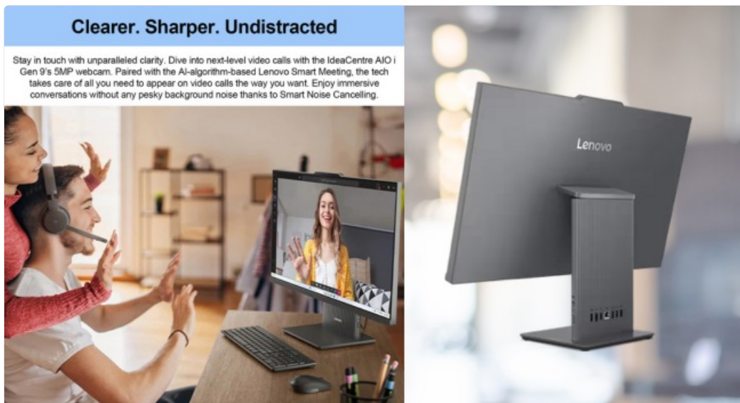
Figure 7: Example of video call clarity with the integrated webcam.