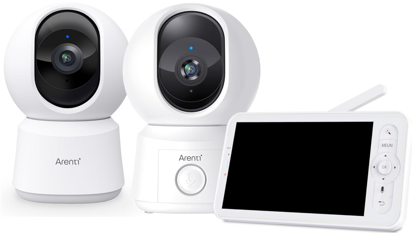
The ARENTI P2Q Indoor Camera and B2Kit Video Baby Monitor system, showing two cameras and one monitor unit.