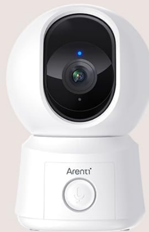
Alnanny B2 Baby Monitor