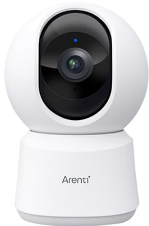
P2Q Indoor Camera