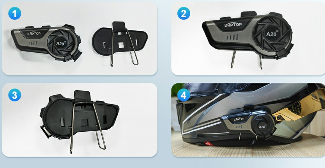
Image: Diagram illustrating the key functions and controls of the Khptop A20 headset, including power, volume, track control, and charging port.