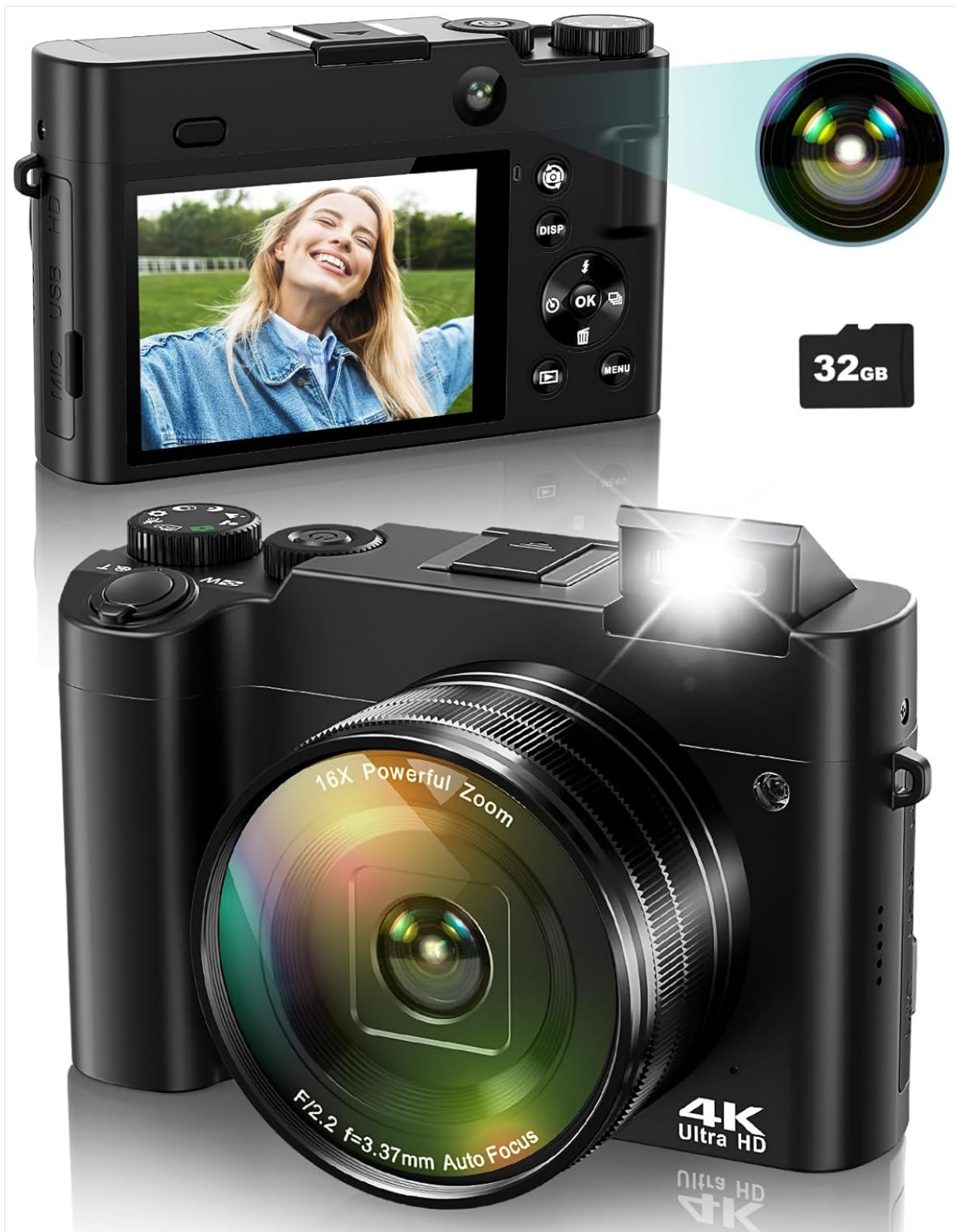
Figure 1.1: ToAute 4K Digital Camera DC218L. This image shows the camera from both front and back angles, highlighting its compact design and screen.