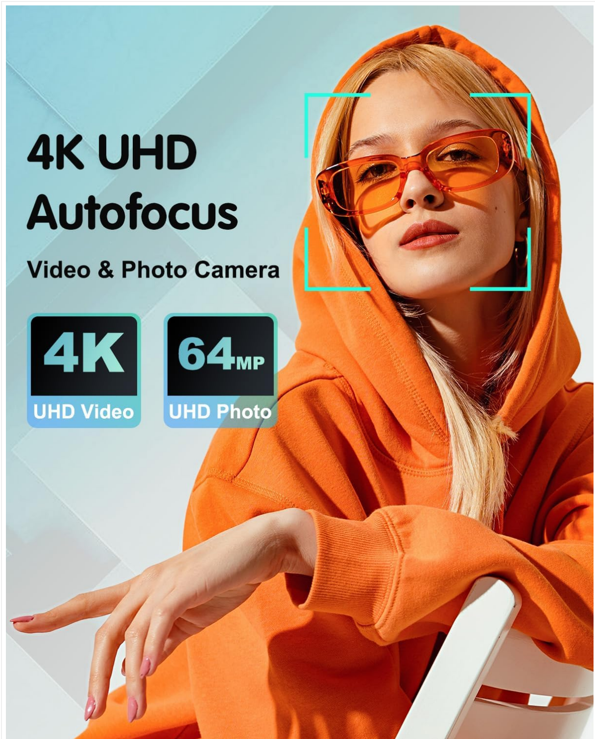
Figure 4.2: 4K UHD Video & 64MP Photos. This image highlights the camera's capability to capture high-resolution video and still images.

capture a photo or start/stop video recording.