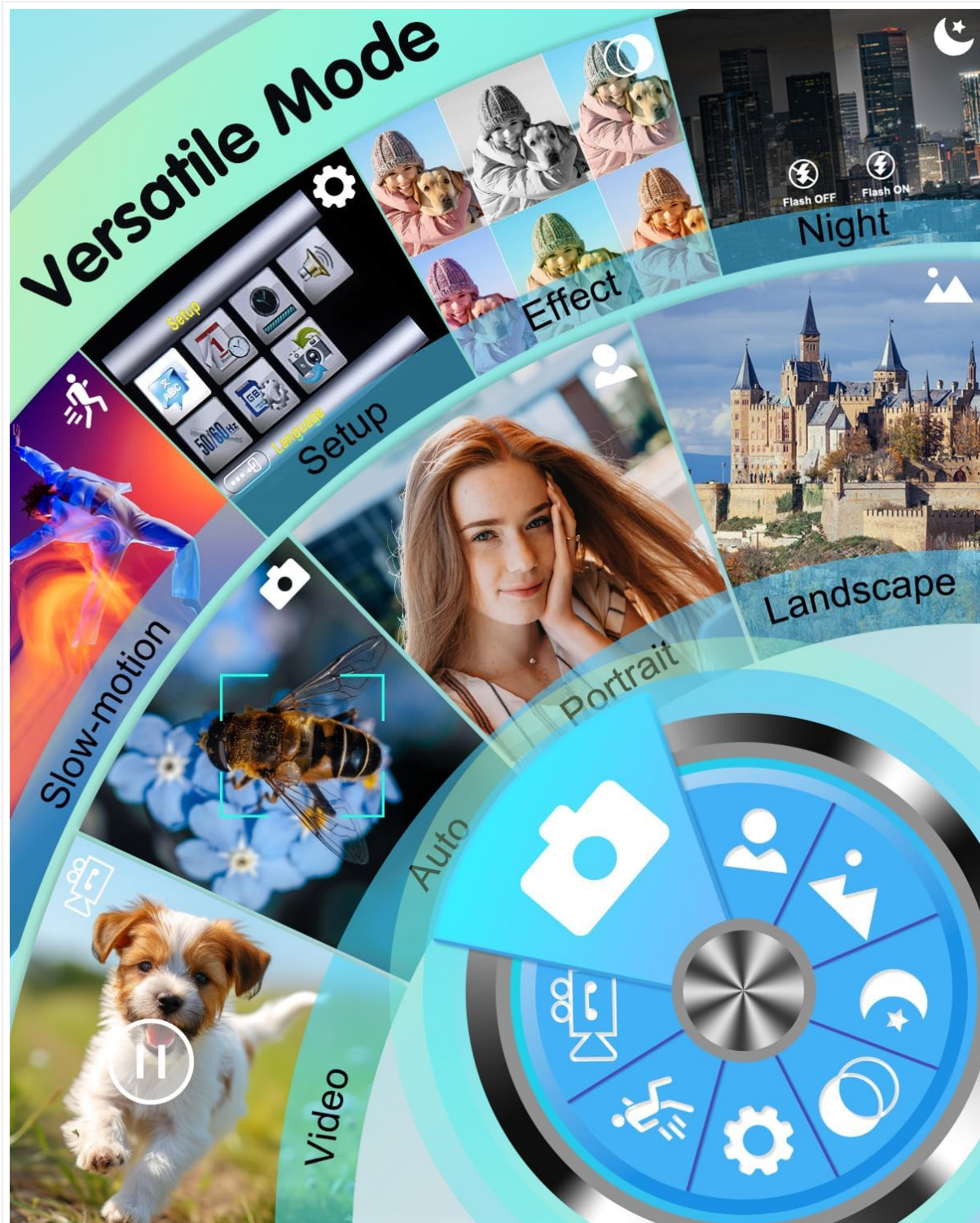
Figure 4.1: Camera Mode Dial. This image shows the mode dial with icons for Auto, Video, Effects, Portrait, Landscape, Slow Motion, and Night modes.