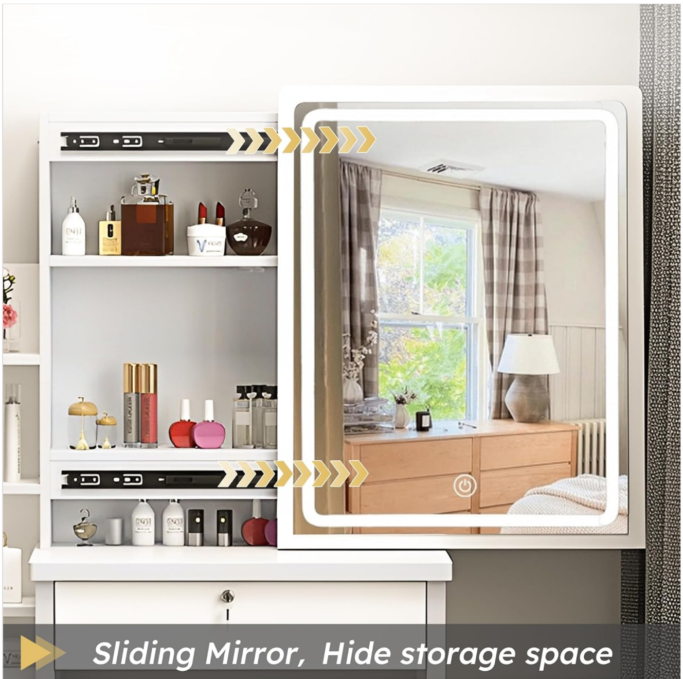
Image: The sliding mirror mechanism, showing how it moves to reveal concealed storage shelves.