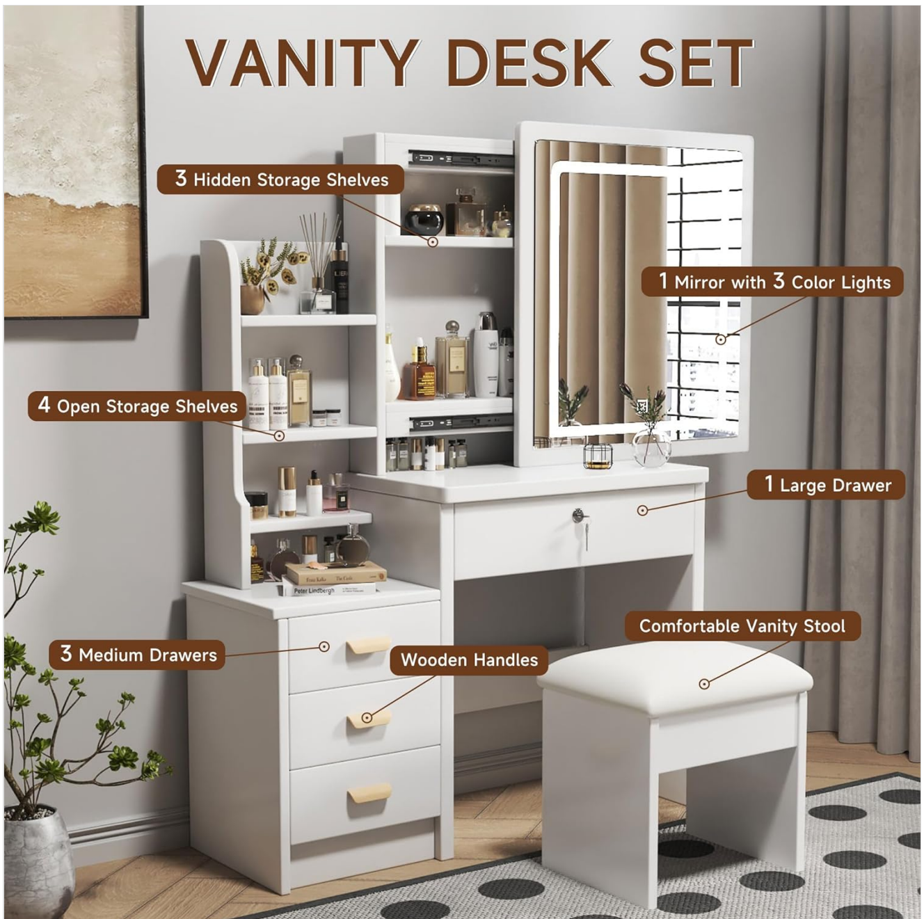
Image: Overview of the Leavader Vanity Desk Set, highlighting the mirror, drawers, shelves, and stool.