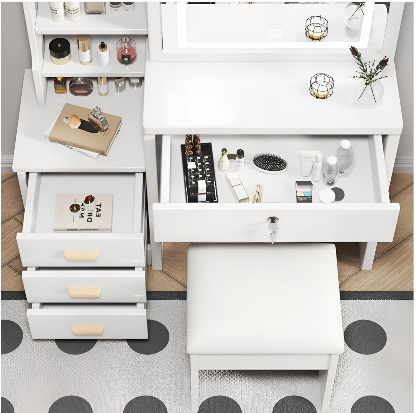
Image: Top-down view of the vanity desk with drawers and shelves open, showcasing the storage capacity.