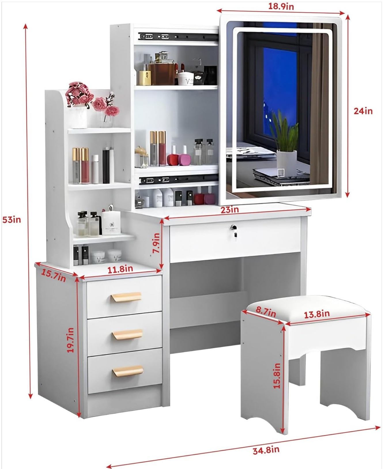
Image: Detailed dimensions of the vanity desk and stool, useful for planning placement.

For detailed visual guidance, refer to the separate assembly manual included in your package.