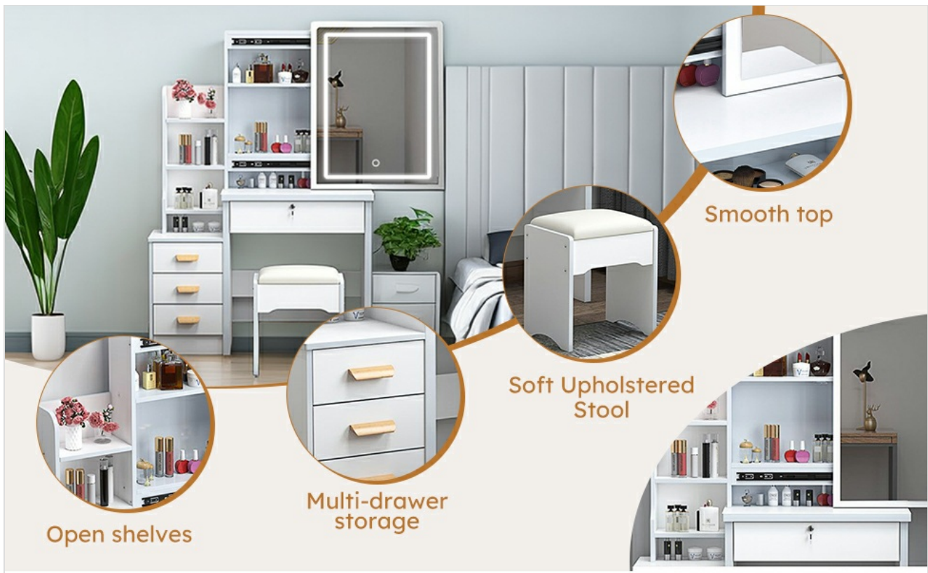
Image: Close-up views highlighting the open shelves, multi-drawer storage, and the soft upholstered stool.