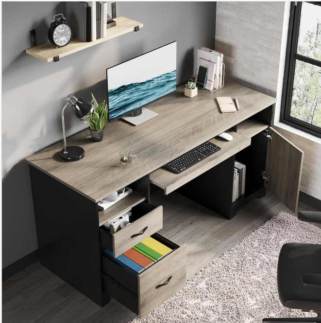
Image 5.1: Desk with drawers and cabinet open, showing storage capacity.