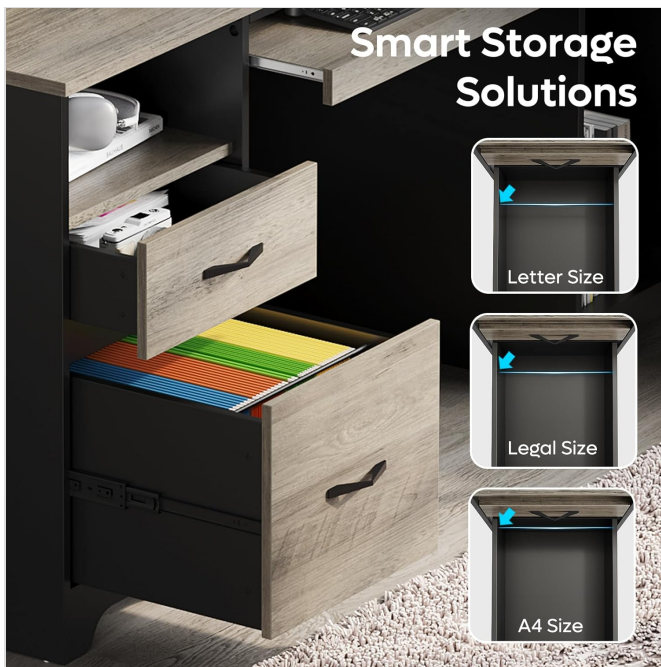
Image 5.3: Smart storage solutions, illustrating the file drawer's compatibility with Letter, Legal, and A4 size documents.