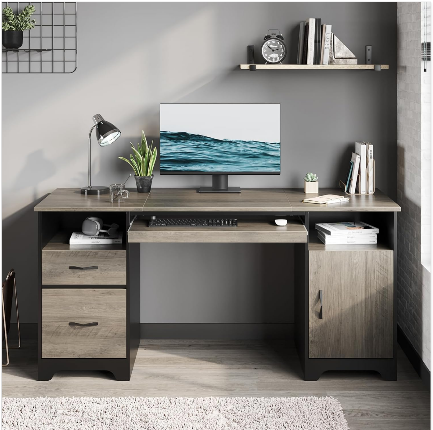
Image 1.1: The Bestier 59-inch Executive Desk, showcasing its spacious design and integrated storage.