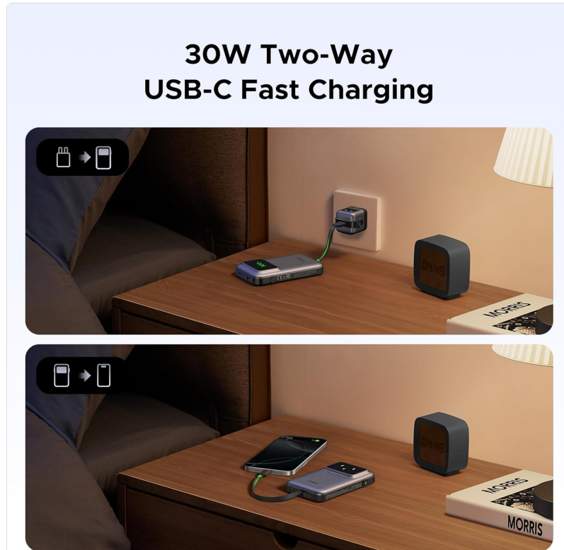
Figure 3.1: Illustration of the UGREEN Uno Power Bank being recharged using a wall adapter, highlighting its two-way fast charging capability.