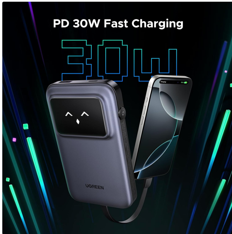
Figure 2.2: The power bank demonstrating its PD 30W fast charging capability while connected to a smartphone.