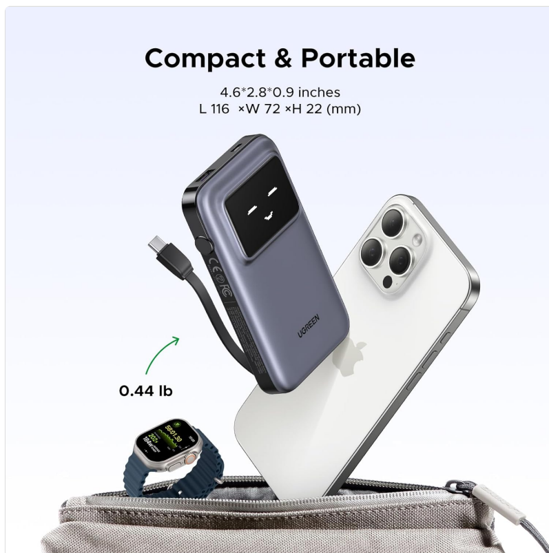
Figure 4.2: The compact and portable dimensions of the UGREEN Uno Power Bank, shown alongside a smartphone and being placed into a small bag.