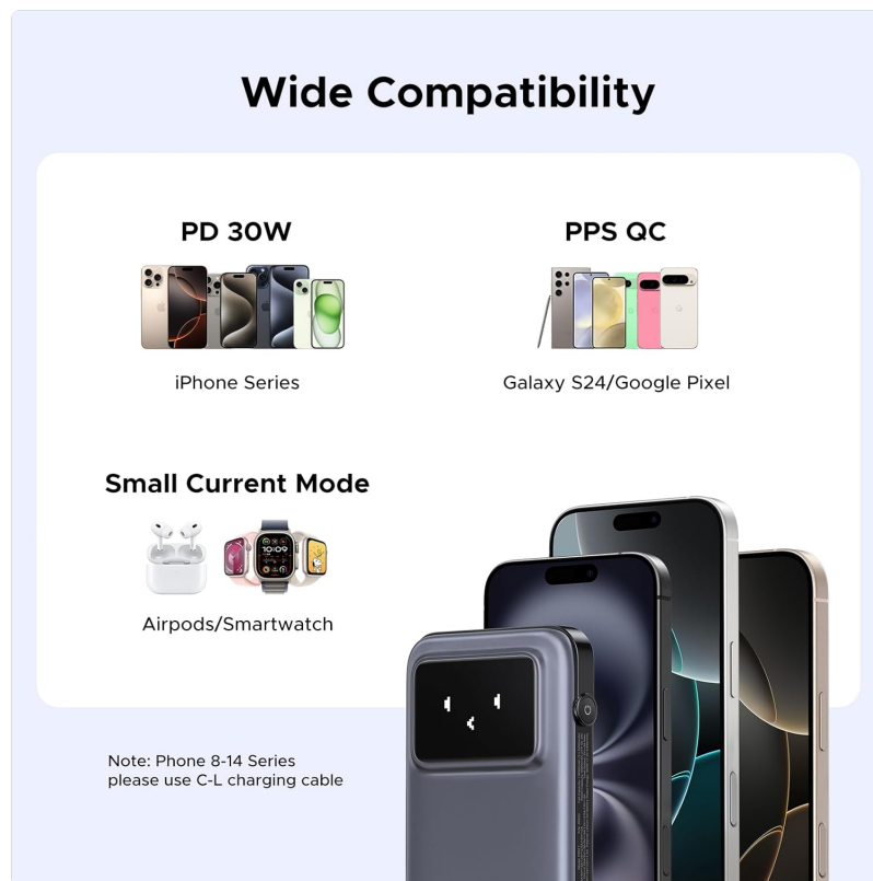
Figure 4.3: Diagram illustrating the wide compatibility of the UGREEN Uno Power Bank with different smartphone series and small current mode devices.