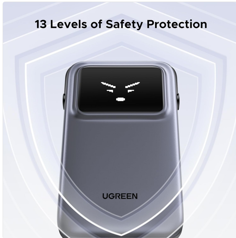
Figure 6.1: Visual representation of the 13 levels of safety protection integrated into the UGREEN Uno Power Bank, including overcurrent, overvoltage, and short circuit protection.

If the issue persists, please contact UGREEN customer support for assistance. Do not attempt to disassemble or repair the device yourself.