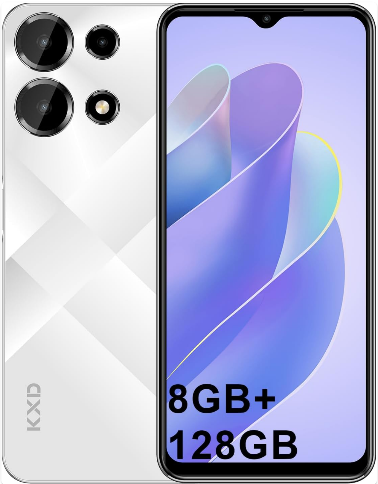
Image 1.1: KXD A10 Unlocked Cell Phone, showcasing its design and display.