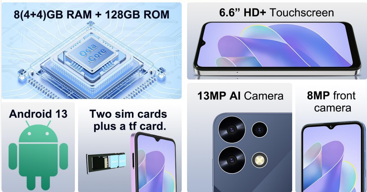
Image 3.1: Overview of KXD A10 features, including the dual SIM card and TF card support.