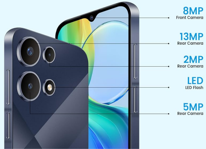
Image 5.2: Breakdown of the KXD A10's camera system, including 13MP rear and 8MP front cameras.