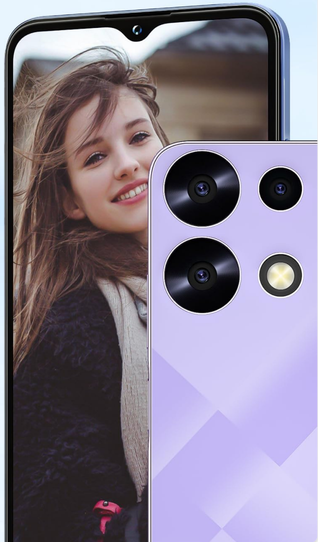
Image 5.1: Examples of photos taken with the KXD A10's rear and front cameras.