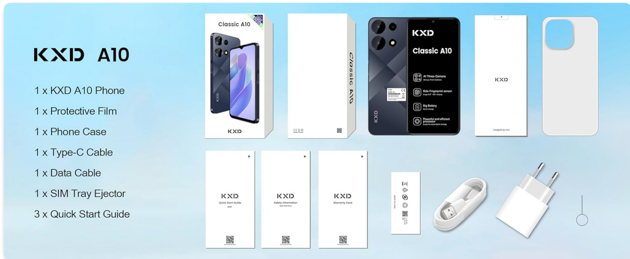
Image 2.1: Illustration of the KXD A10 phone and its included accessories.