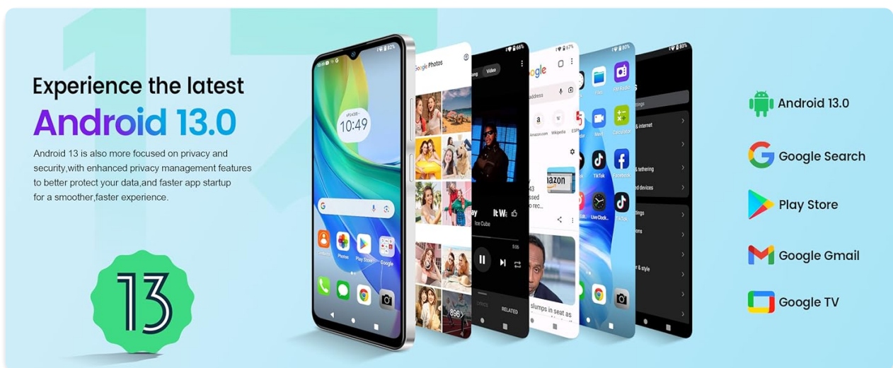
Image 4.2: Visual representation of Android 13 features and Google services integration.