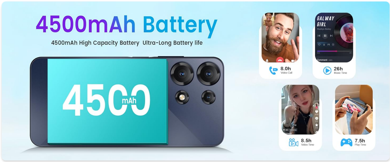
Image 7.2: Estimated usage times for various activities with the 4500mAh battery.