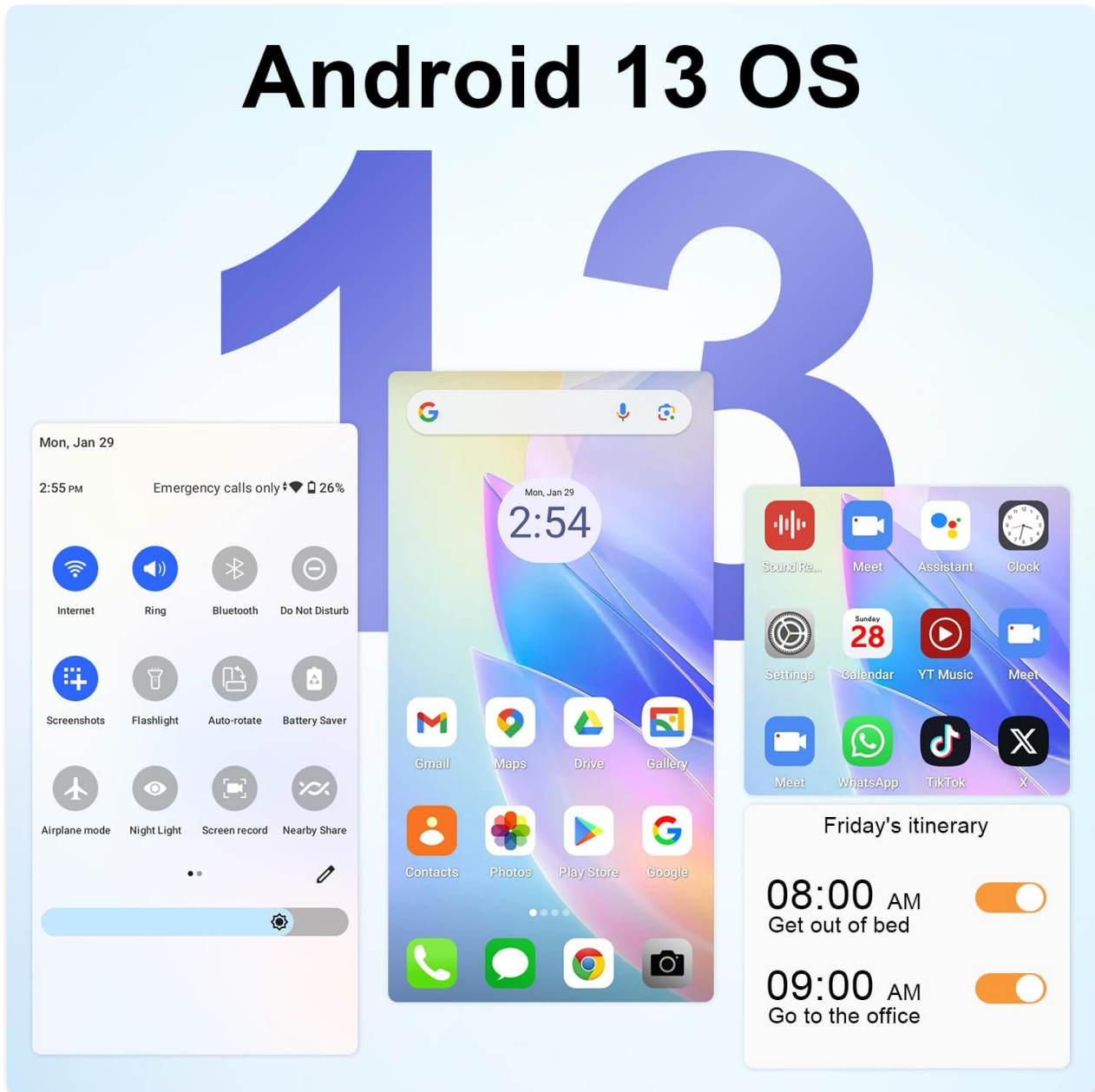
Image 4.1: KXD A10 displaying the Android 13 user interface with various apps and notifications.

personalized user experience. Navigate through the interface using gestures or the traditional navigation bar.