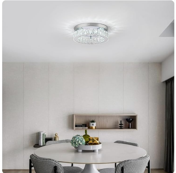
Figure 3.1: Illustration of the chandelier with key dimensions and components. The image shows the 11.8-inch diameter, 3.9-inch height, and the crystal and stainless steel construction.