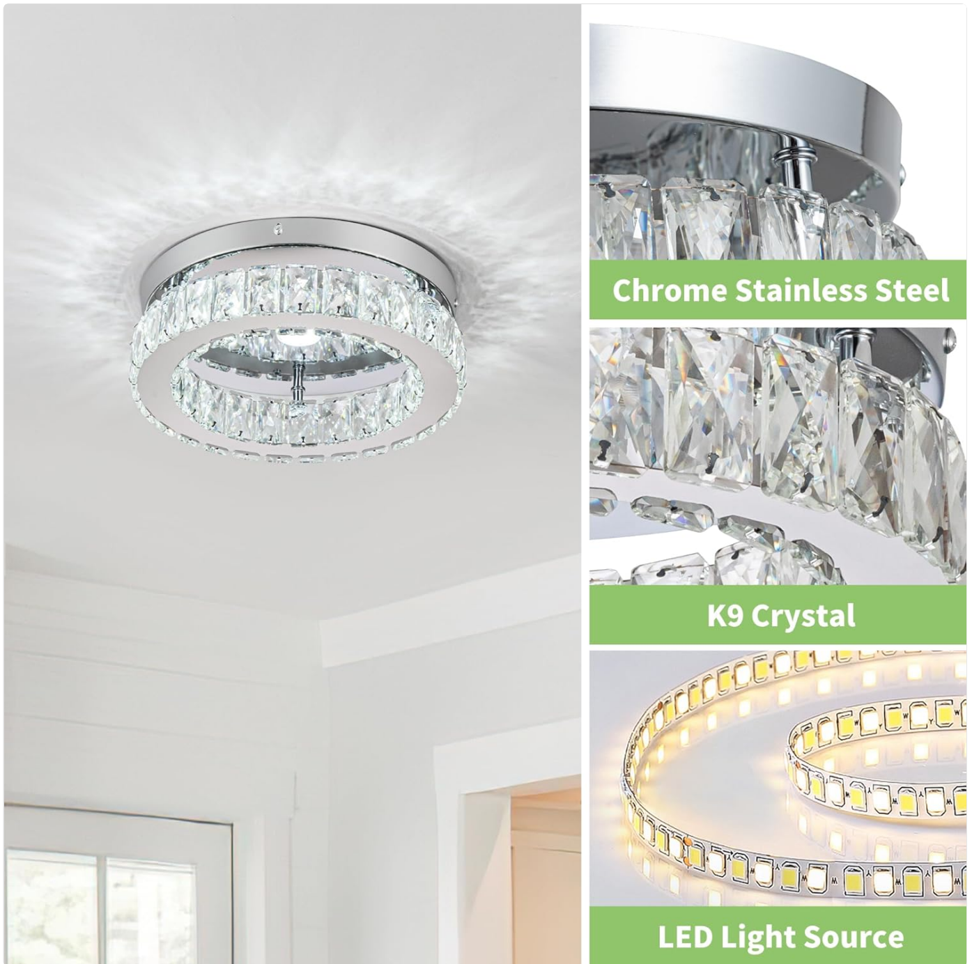
Figure 5.1: The HOPGGIE Mini Crystal LED Flush Mount Chandelier installed on a ceiling, showcasing its compact design and crystal elements.