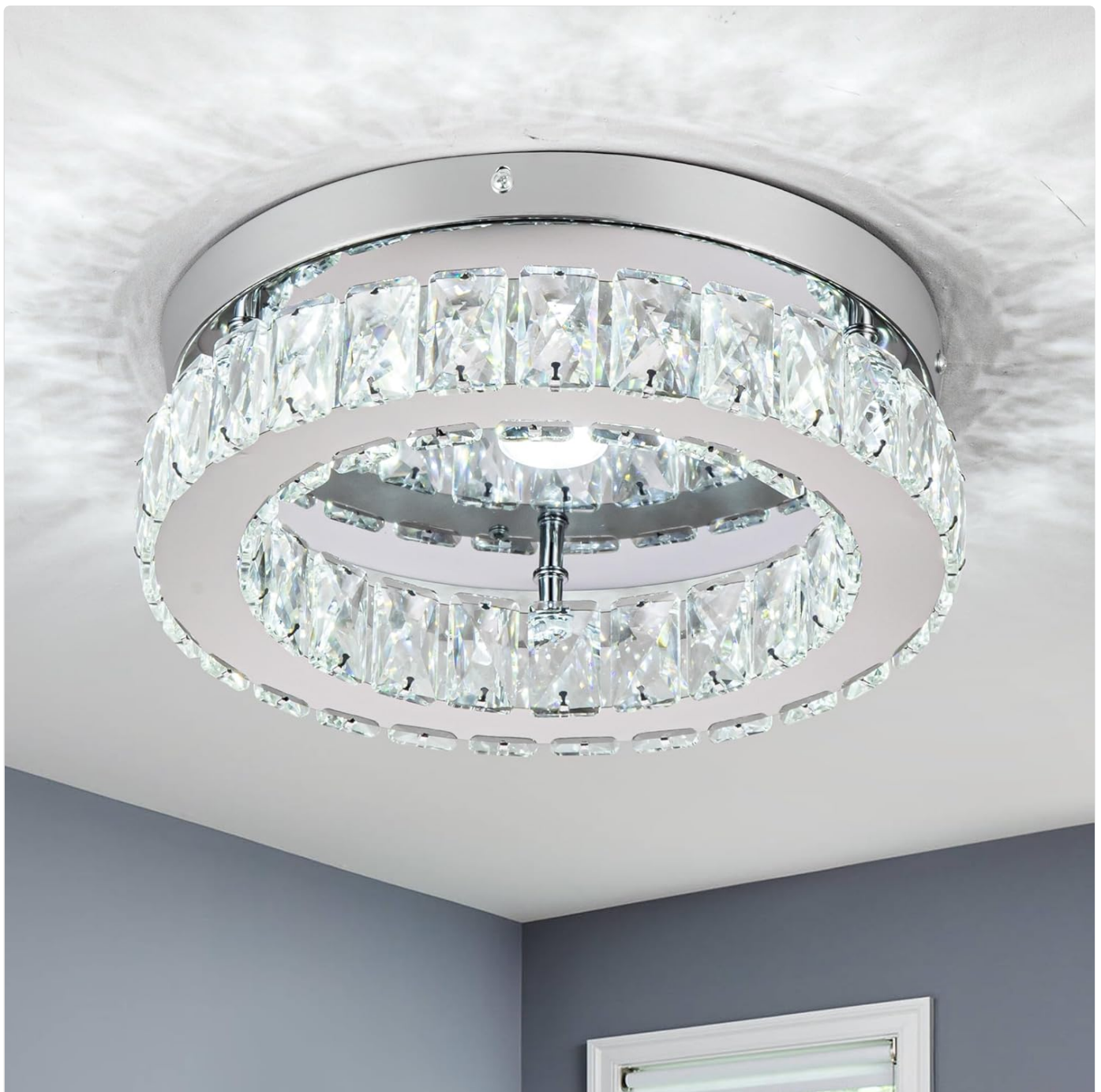
Figure 5.2: A detailed view of the chandelier's crystal and chrome stainless steel construction, highlighting the quality of materials.