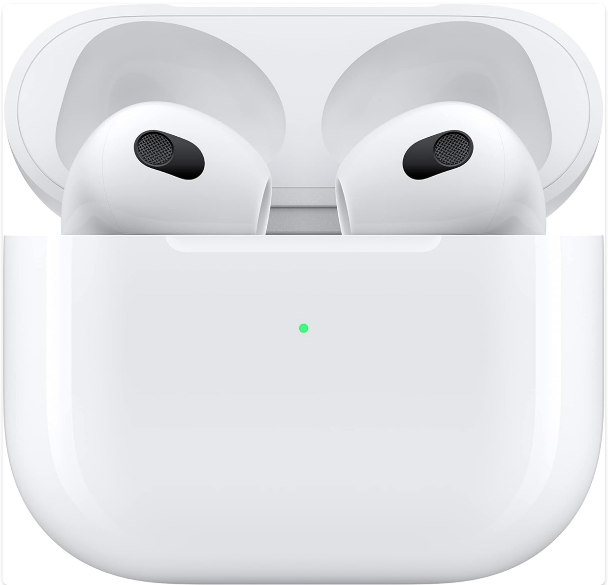
Image: Apple AirPods (3rd Generation) resting inside their open MagSafe Charging Case, showing the charging status light.