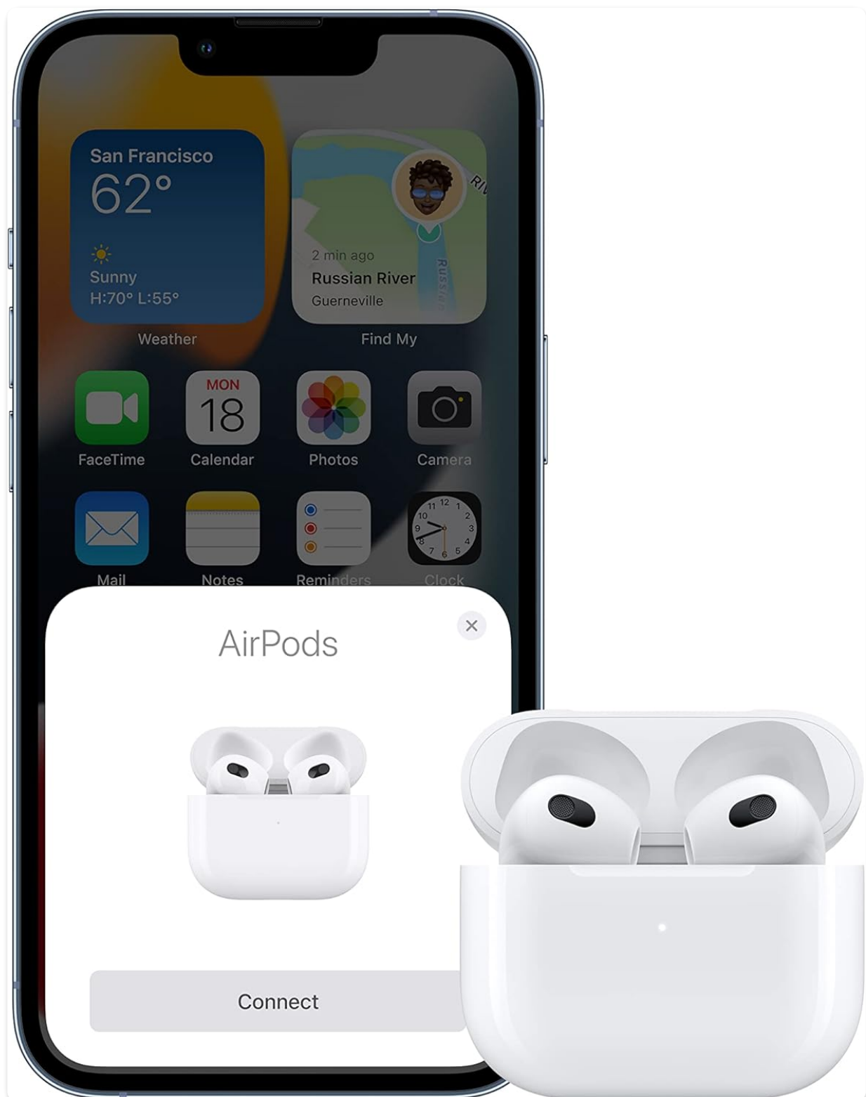
Image: An iPhone screen showing the "AirPods Connect" prompt, positioned next to an open MagSafe Charging Case with the AirPods inside, illustrating the pairing process.

Your AirPods are now paired with your iOS device and automatically set up for all supported devices signed in to iCloud with the same Apple ID.