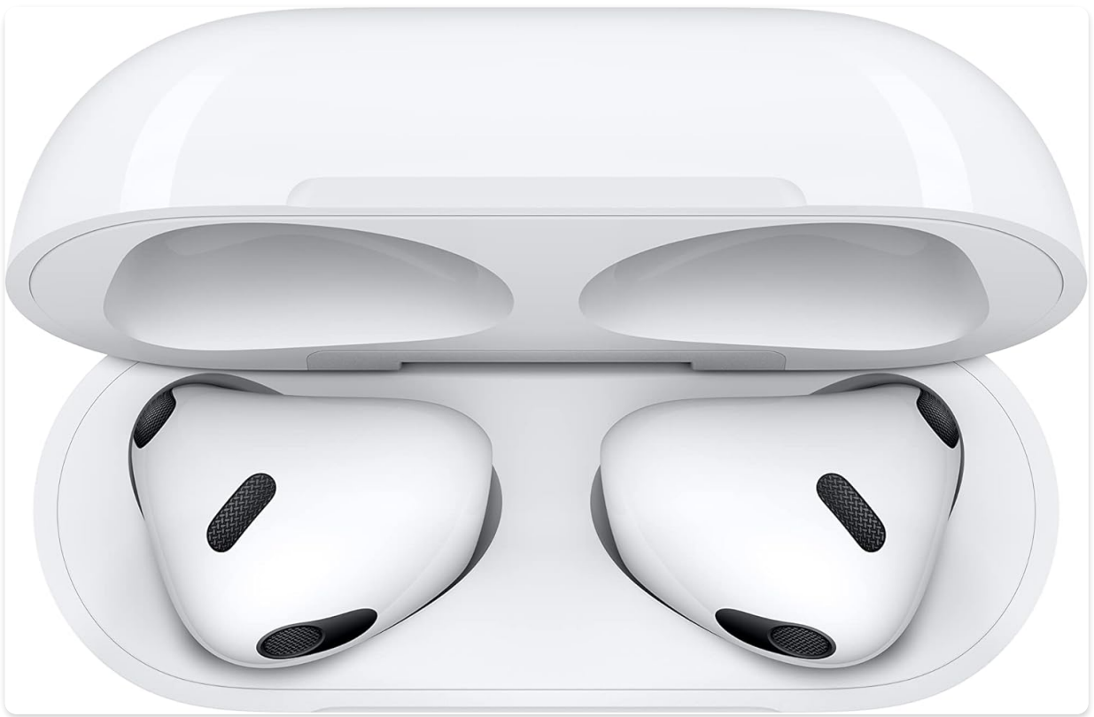
Image: A top-down perspective of the Apple AirPods (3rd Generation) nestled within their open MagSafe Charging Case.