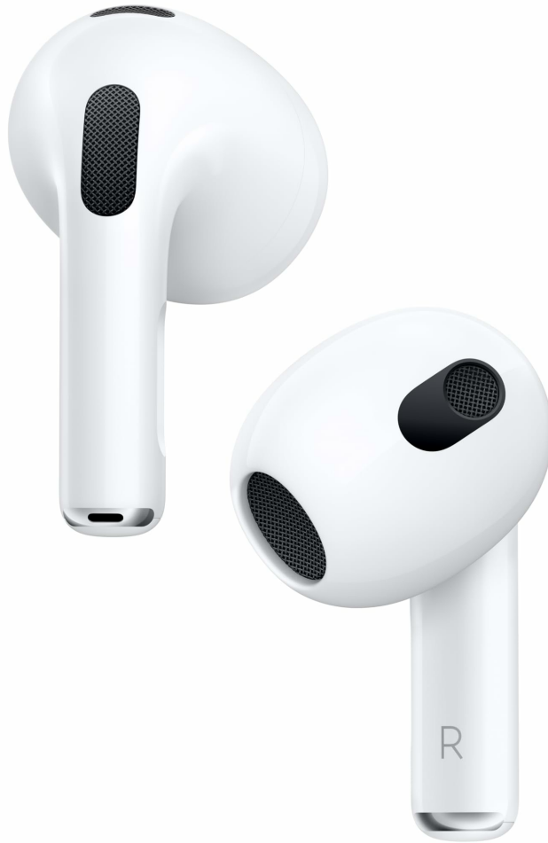
Image: Apple AirPods (3rd Generation) with their MagSafe Charging Case, showcasing the earbuds outside the case.