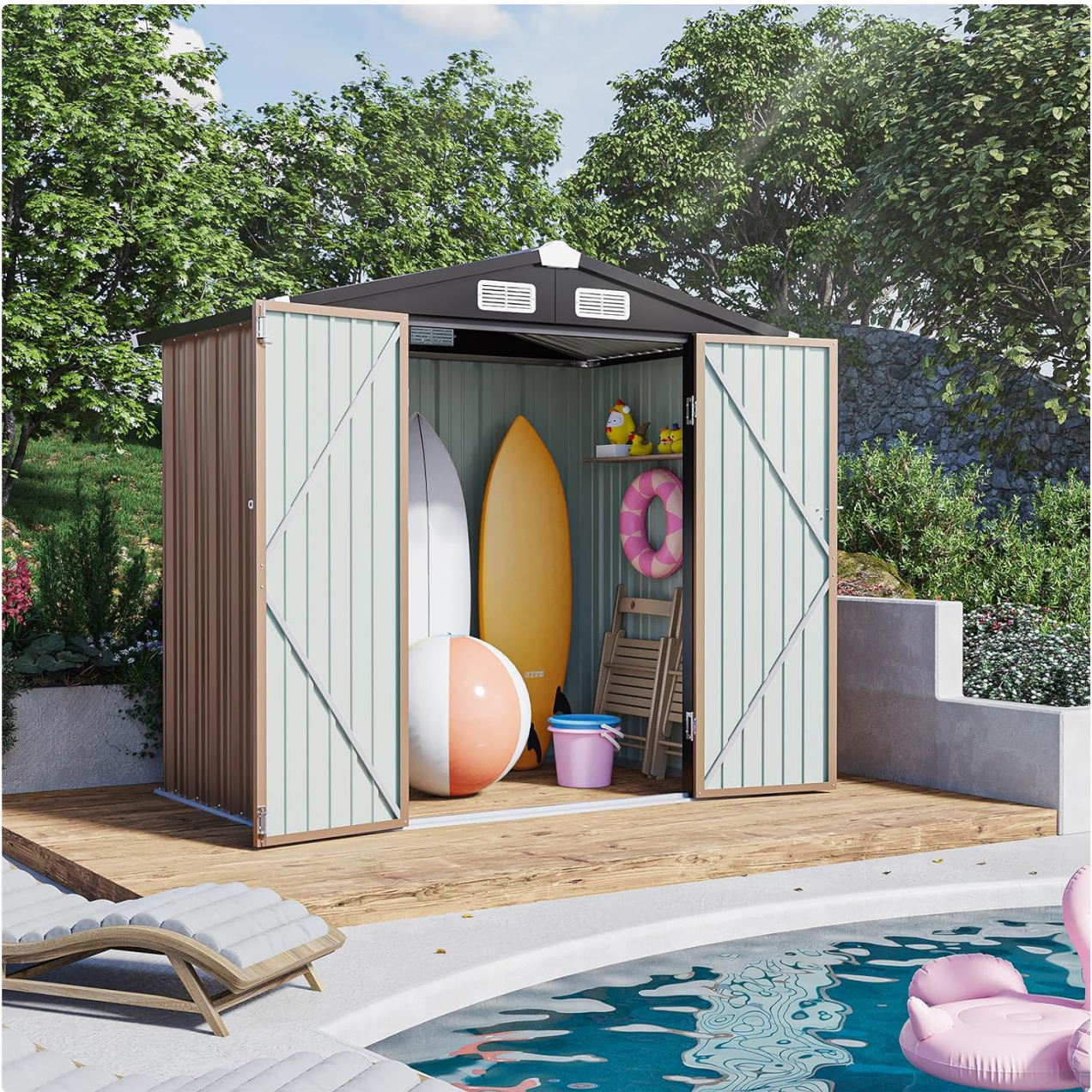
Image: Jolydale 6.4x3.6FT Galvanized Steel Outdoor Storage Shed in a garden setting.