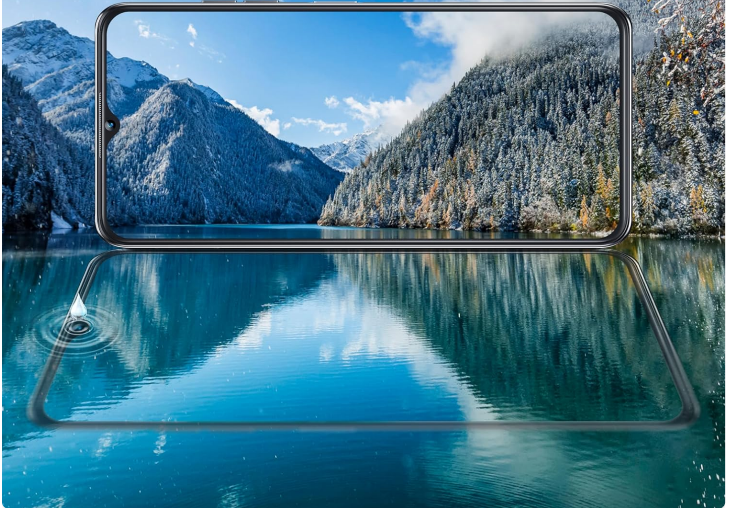
Figure 4: Illustration of the OUKITEL C38's 24GB RAM and 256GB ROM, highlighting its massive storage and multitasking capabilities.