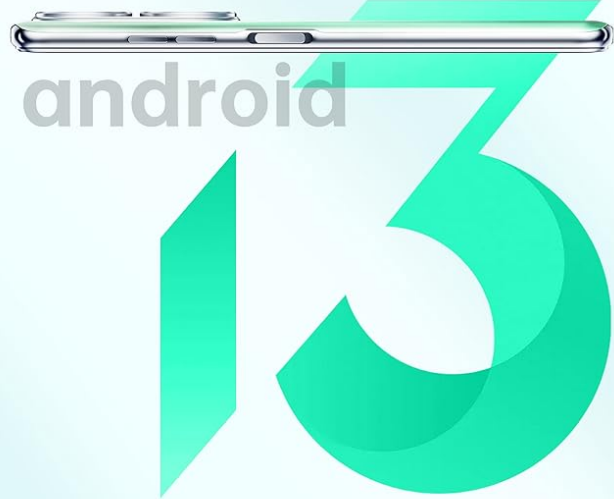
Figure 8: Information regarding OUKITEL's two-year maintenance support for their products.