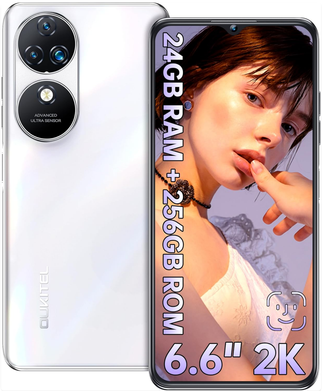
Figure 1: Front and back view of the OUKITEL C38 Smartphone, showcasing its sleek design and dual camera module.