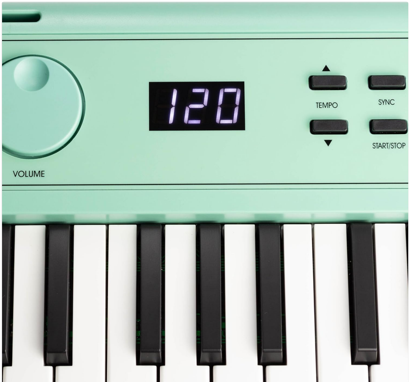
Image: Close-up of the keyboard's digital display showing the tempo setting, along with the TEMPO, SYNC, and START/STOP control buttons.