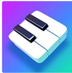
Image: The official logo icon for the Simply Piano application.