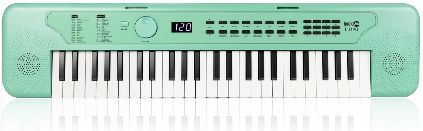
Image: Overhead view of the RockJam 49 Key USB Keyboard Piano, showing the full layout of keys and control panel.