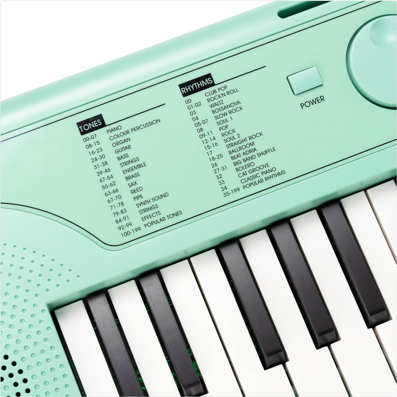
Image: Detailed view of the tone and rhythm categories and their corresponding numerical codes printed on the keyboard's surface.