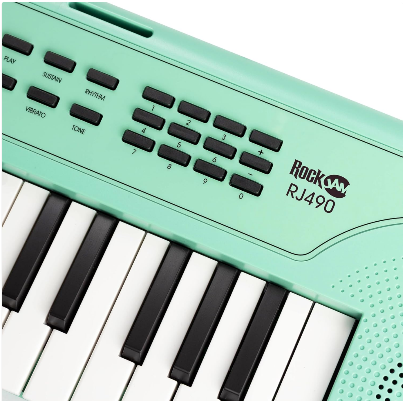
Image: Close-up of the keyboard's control panel, highlighting the numerical input buttons and function buttons such as TONE, RHYTHM, SUSTAIN, and VIBRATO.