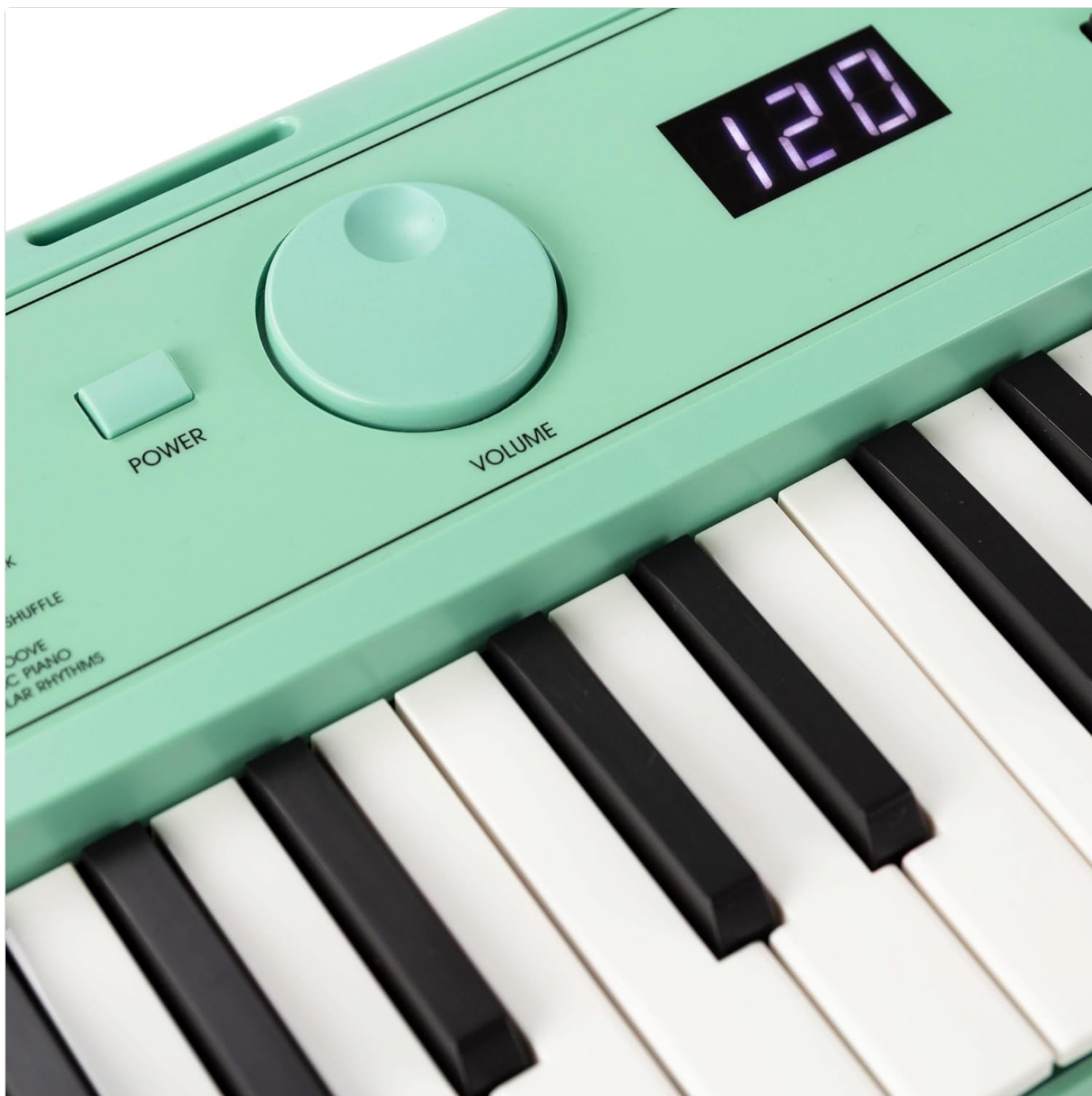
Image: Close-up view of the power button and volume knob located on the top panel of the keyboard.