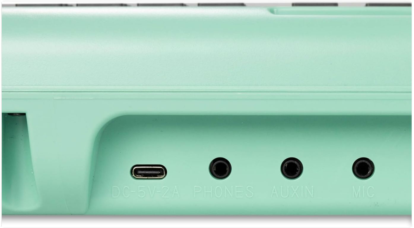
Image: Rear view of the keyboard displaying the DC 5V-2A USB power input, headphone output, auxiliary input, and microphone input ports.