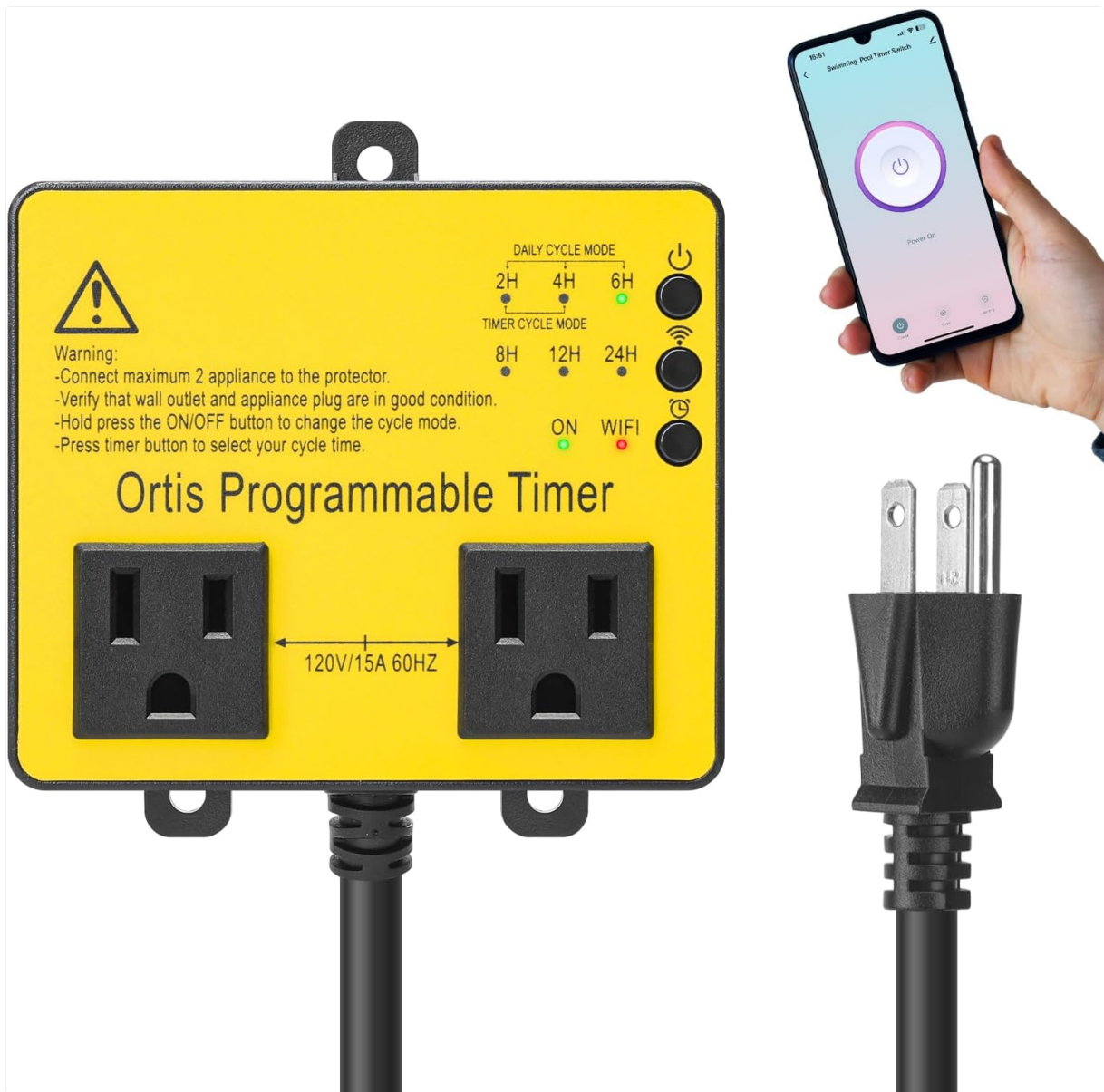
Figure 1.1: Ortis Smart WiFi Pool Timer Switch with remote control and app interface.