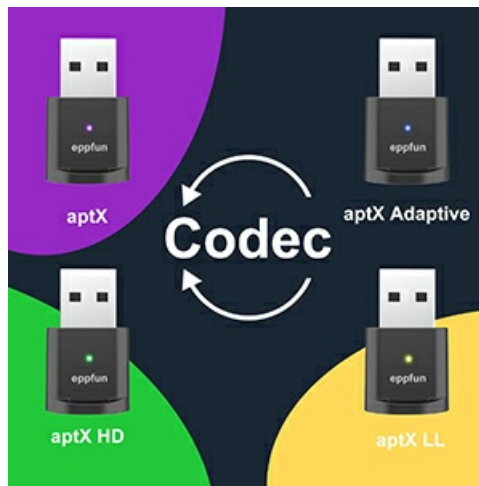
Image 4.1: LED indicators for different audio codecs (aptX, aptX Adaptive, aptX HD, aptX LL).