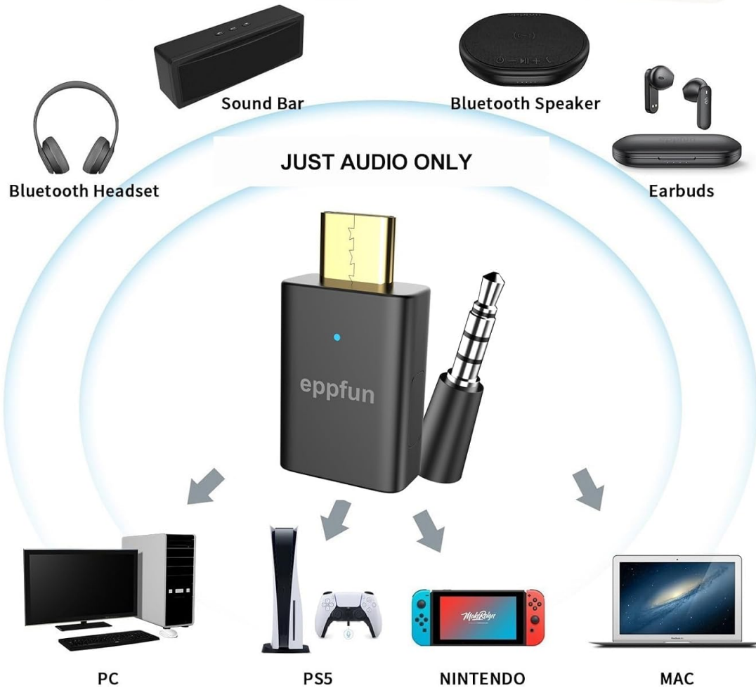
Image 5.1: Wide compatibility with various host devices and audio receivers.

The input USB C supports all DP interface devices, while the wireless input supports both classic Bluetooth and LE Audio