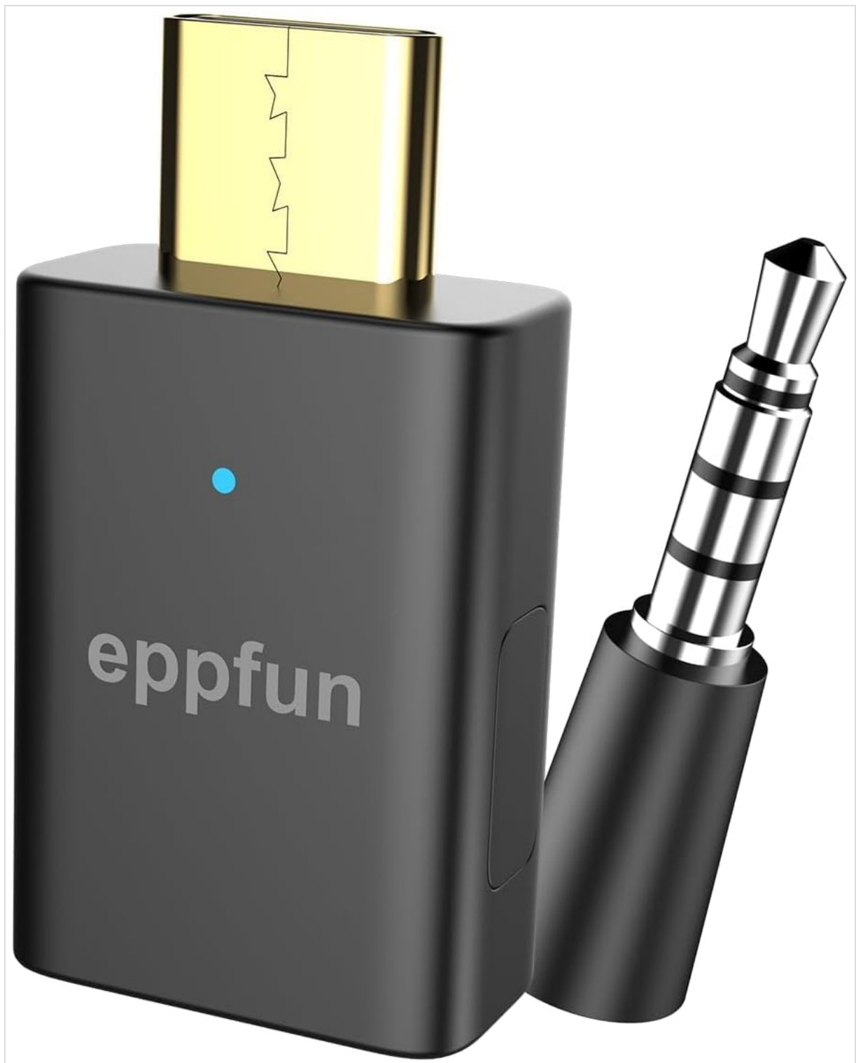
Image 1.1: The eppfun AK3040 Pro MAX USB-C Bluetooth adapter, shown with an optional 3.5mm audio jack adapter.