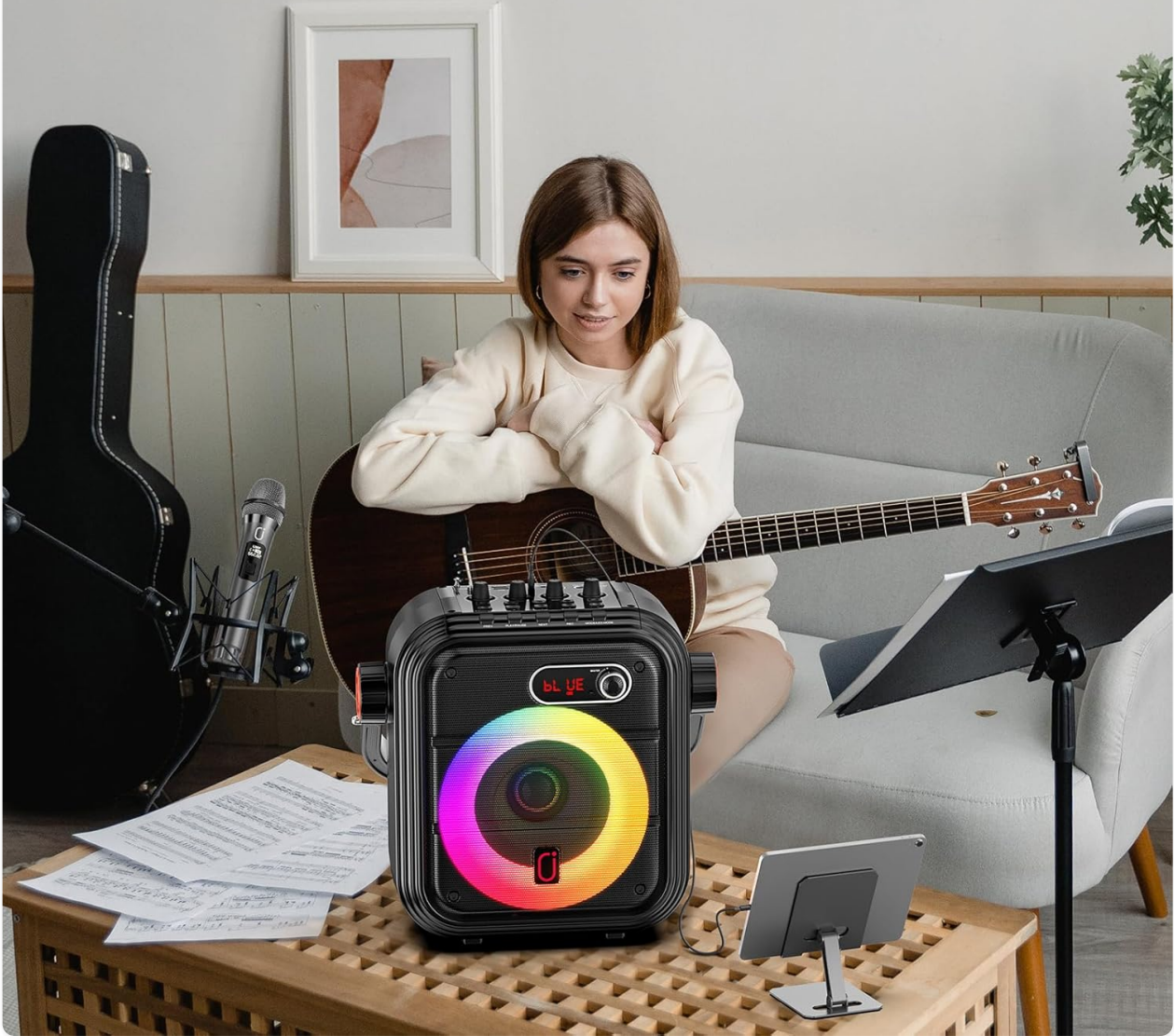
Figure 4.3: The speaker's features support live broadcasting with integrated sound effects.

Built-in soundcard and sound effects to make live broadcasting more interesting