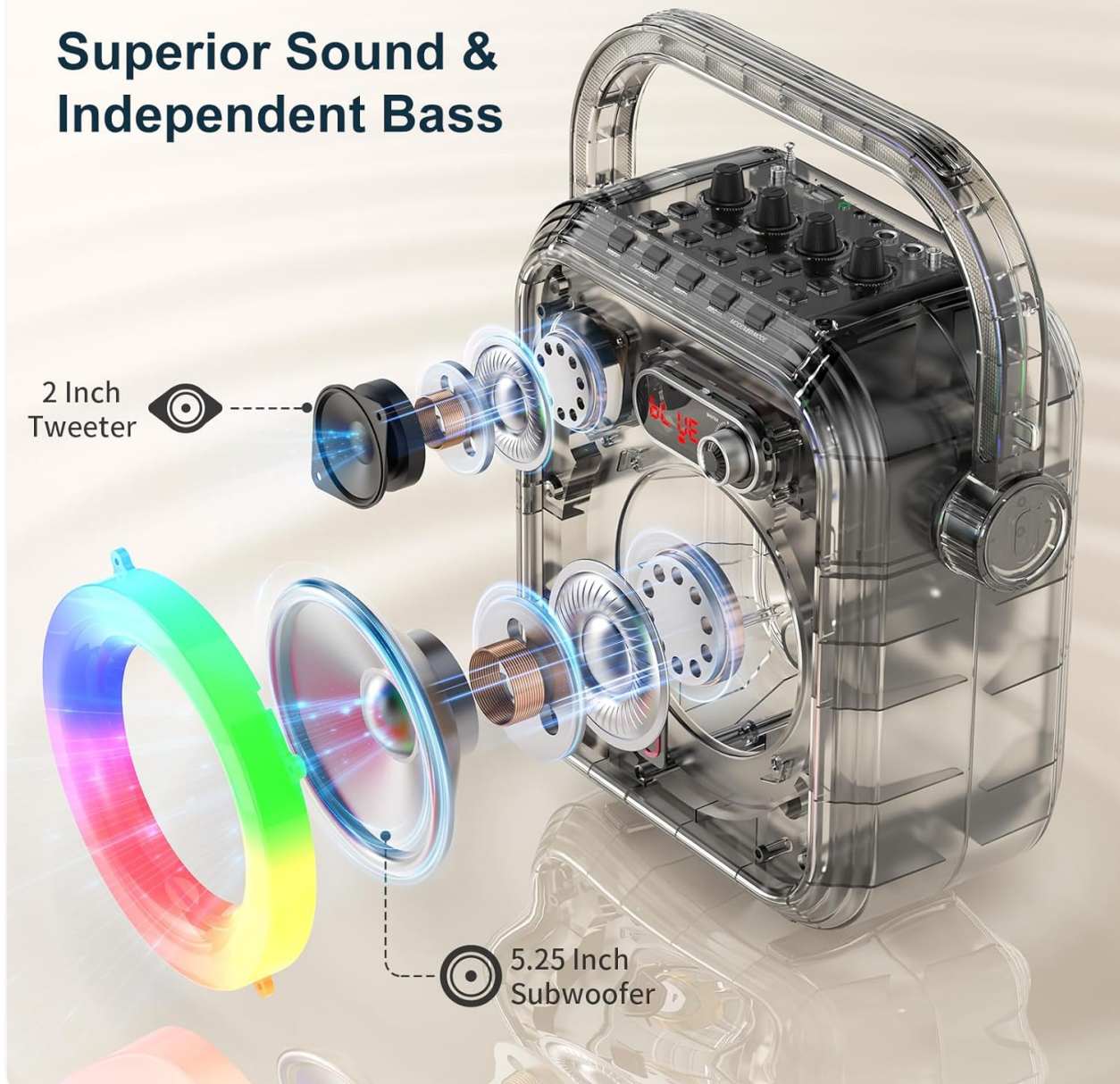
Figure 2.2: Internal speaker components, including a 2-inch tweeter and 5.25-inch subwoofer for balanced sound output.