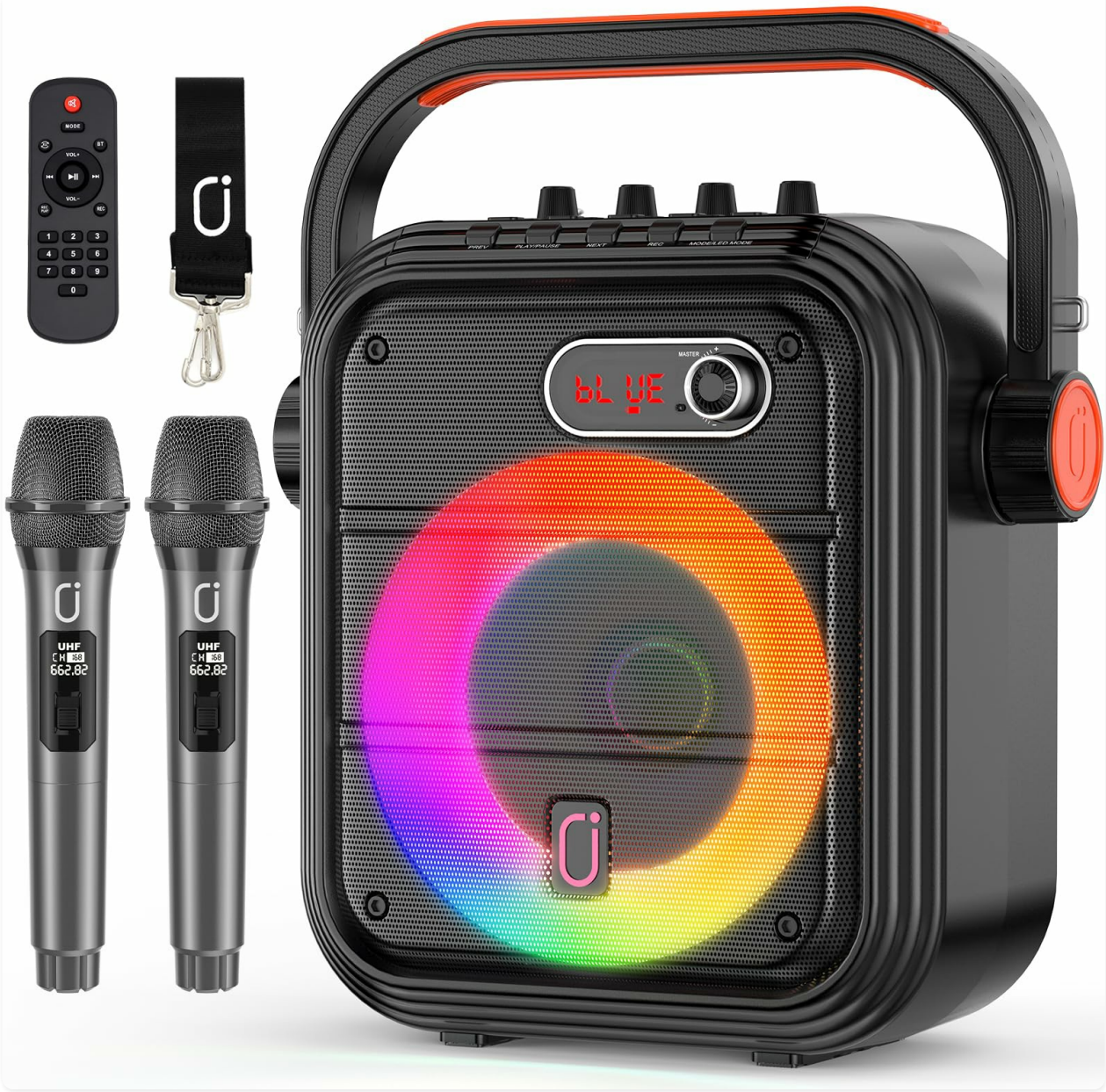
Figure 2.1: JYX 66 PRO Portable Bluetooth Speaker and Wireless Microphones.