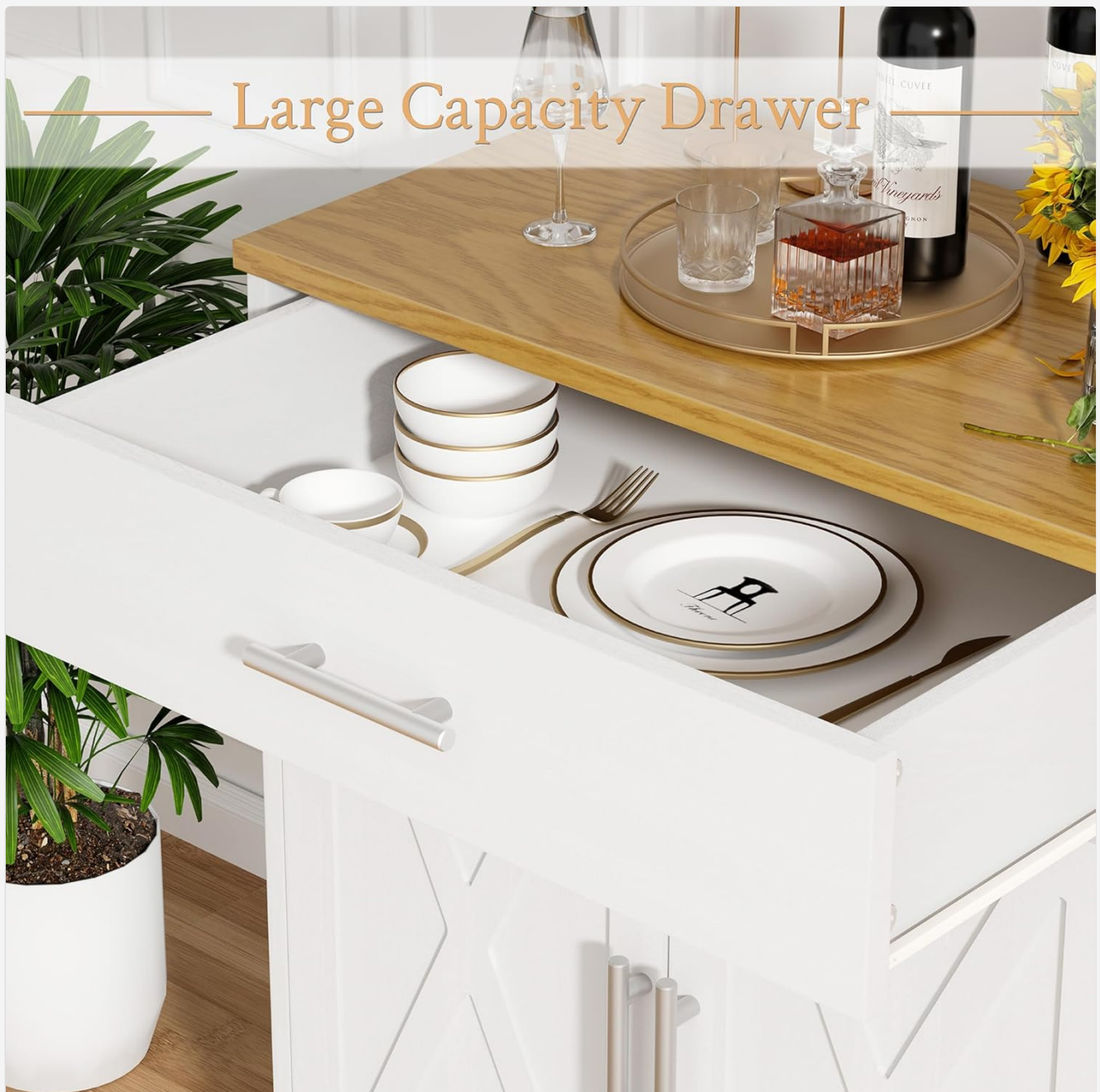
Image 5.2: The top drawer of the cabinet shown open, revealing ample space for storing various items like dishes or utensils.