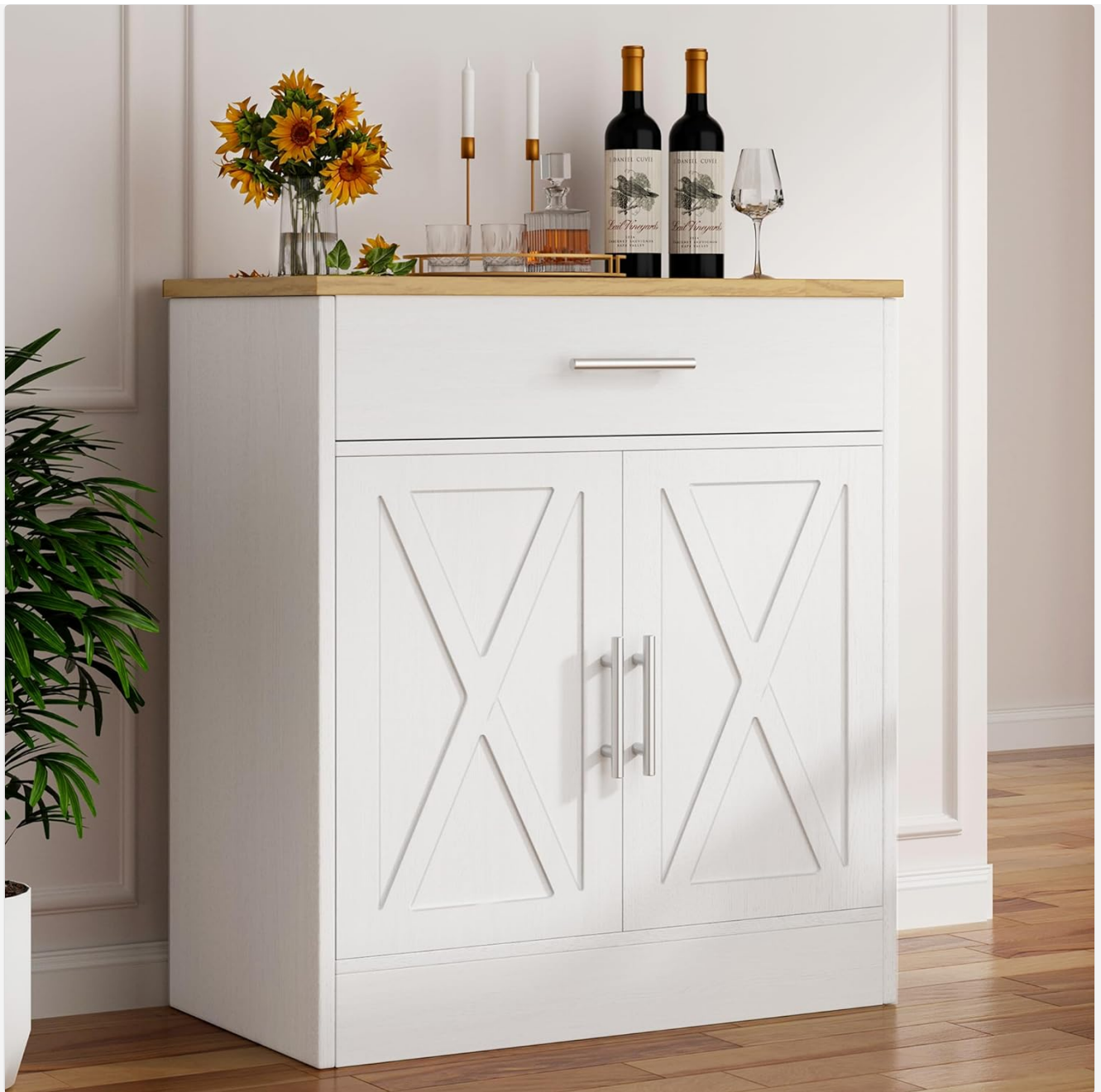
Image 1.1: The Meilocar Storage Cabinet (Model SHX7340-WH) in a white finish, featuring a top drawer and two cabinet doors with decorative X-panels.