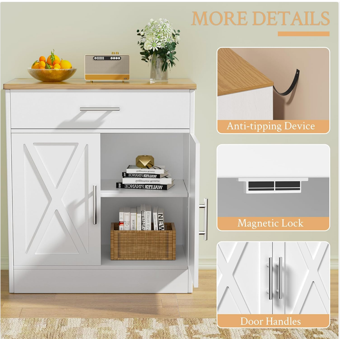
Image 2.1: Detail showing the anti-tipping device attachment point on the cabinet's rear top edge, along with the magnetic door lock and metal door handles.