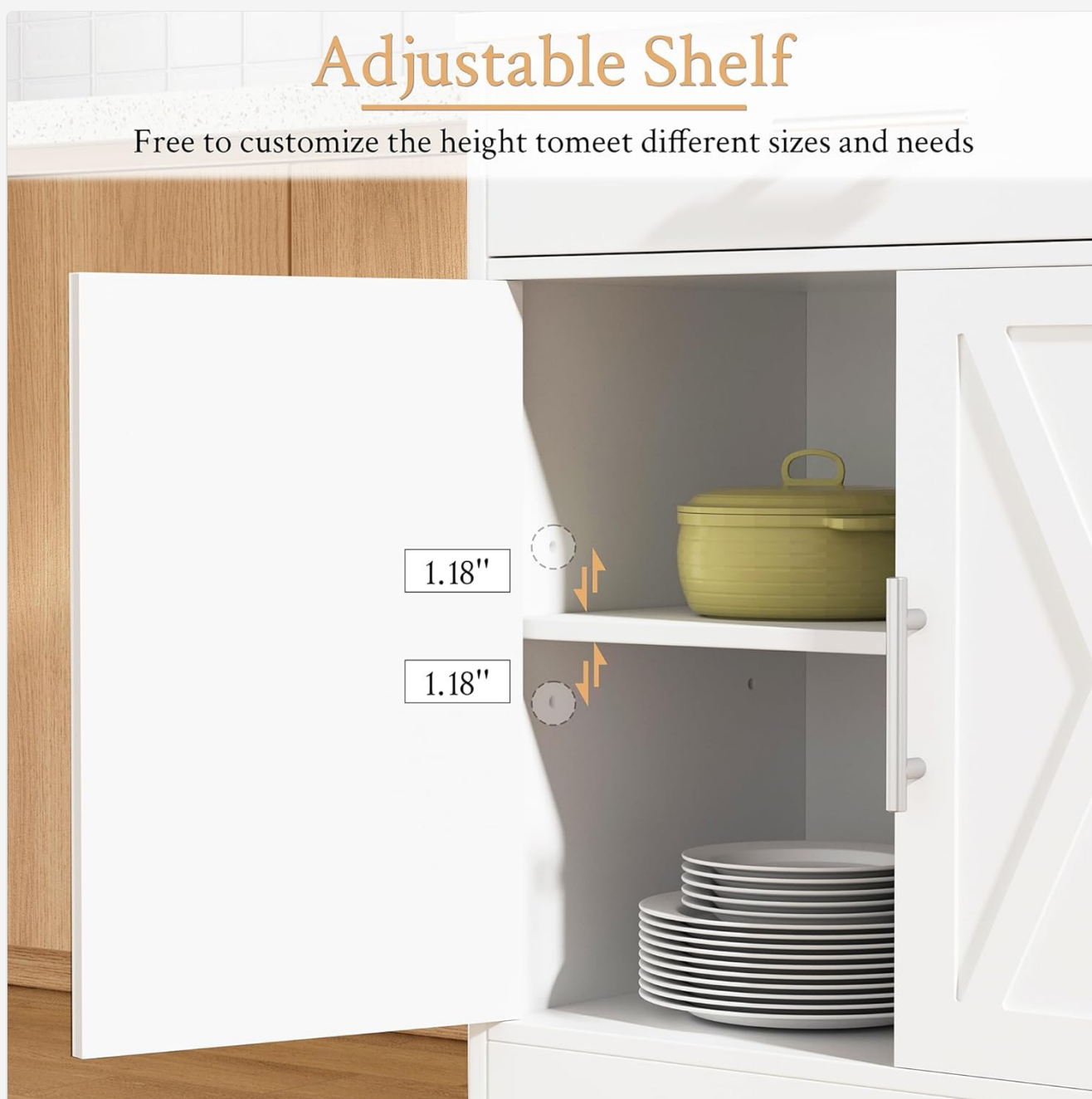
Image 5.1: View inside the cabinet showing the adjustable shelf and the multiple pre-drilled holes for height customization.