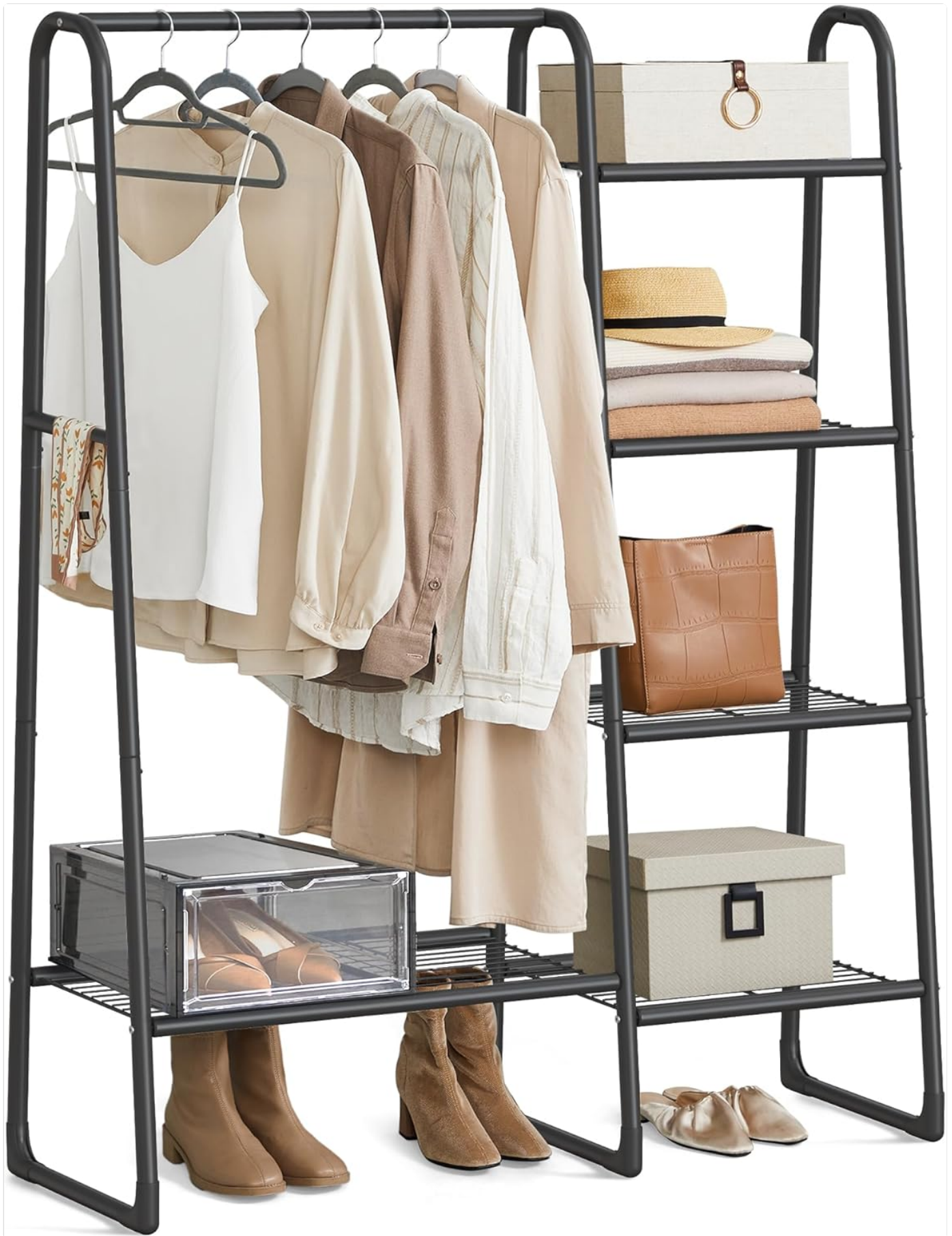
Figure 1: Overview of the SONGMICS Freestanding Clothes Rack, showcasing its hanging bar, multiple shelves, and overall capacity for organizing various items.