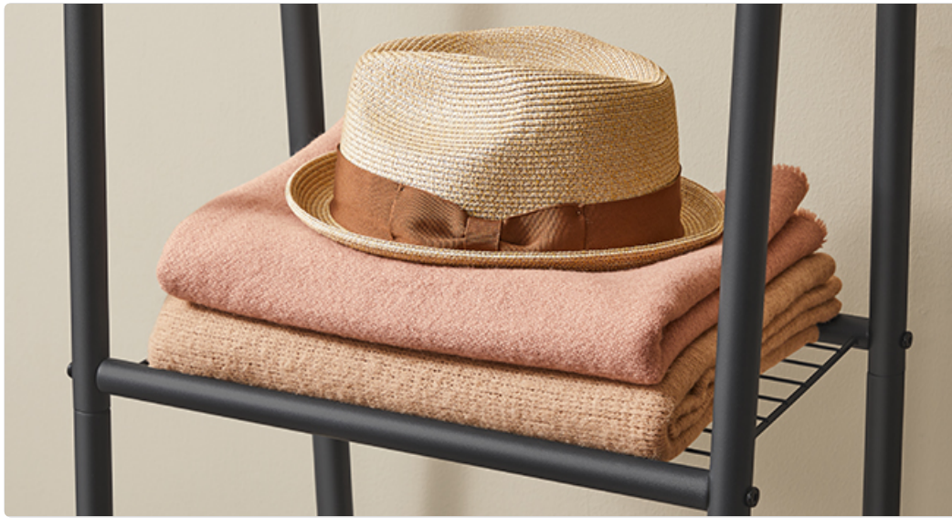
Figure 6: A shelf displaying a hat and neatly folded garments, illustrating the versatility of the storage shelves.