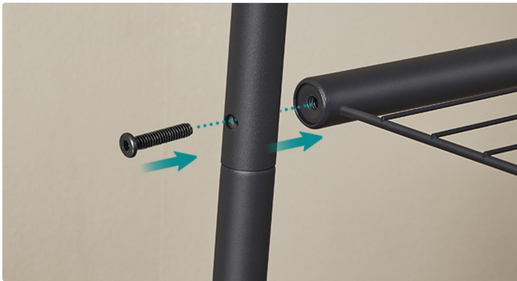
Figure 4: Illustration of how components connect using screws, indicating the ease of assembly.