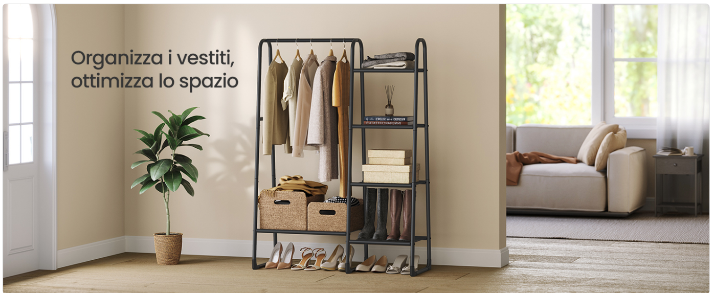
Figure 2: The clothes rack integrated into a living space, illustrating its ability to organize clothes and optimize room utility.