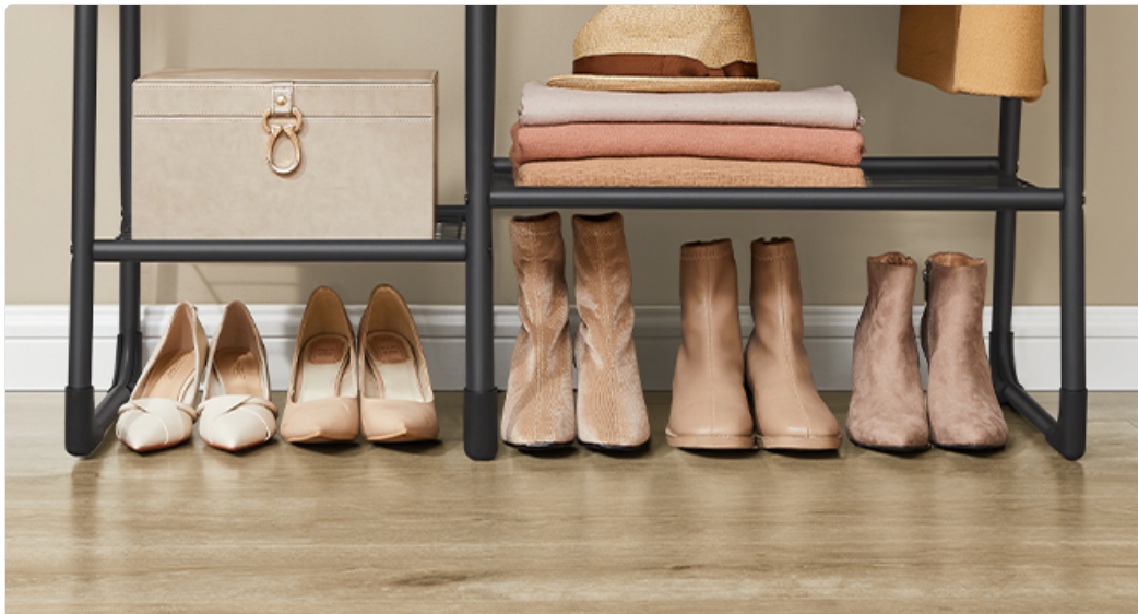
Figure 5: A close-up view of shoes and boots neatly stored on the lower shelves, demonstrating efficient footwear organization.