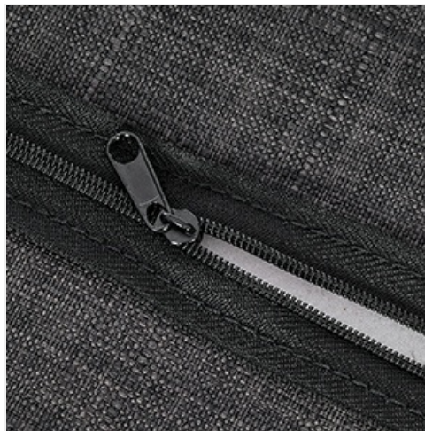
Image 6.1: The cushion cover can be removed via a zipper for cleaning.