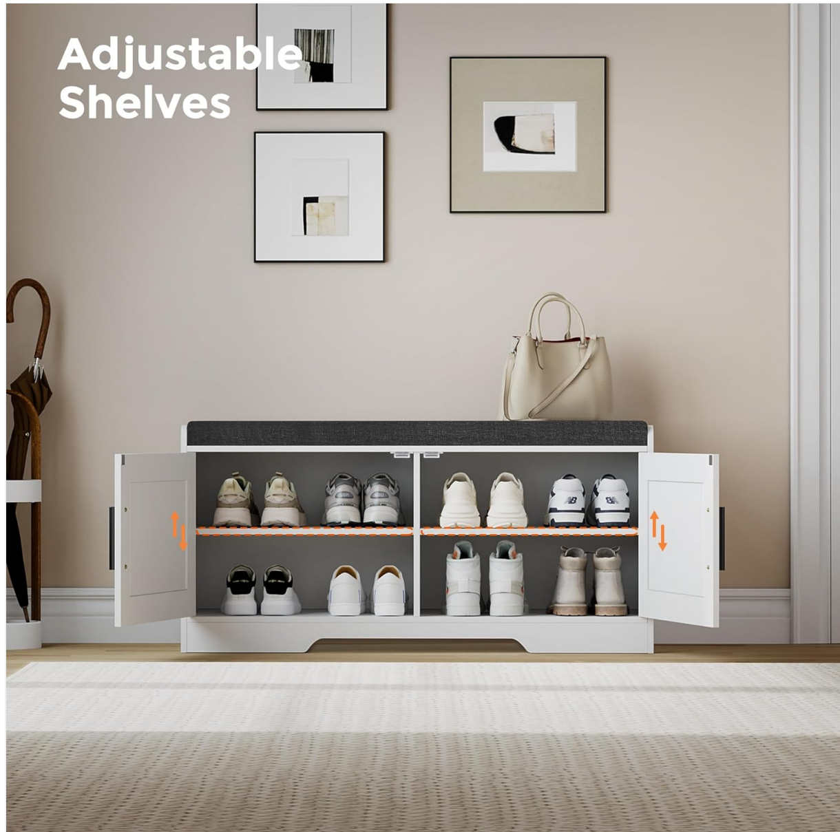
Image 4.1: The adjustable shelves allow for customized storage configurations.