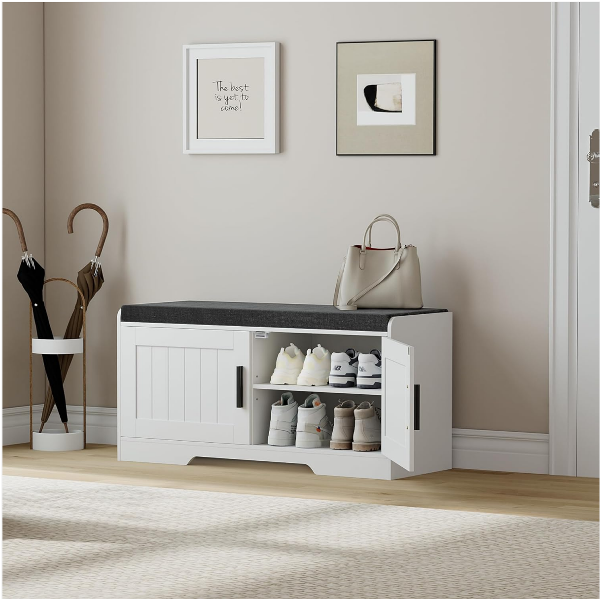
Image 5.1: The padded seat cushion provides comfort for changing shoes.