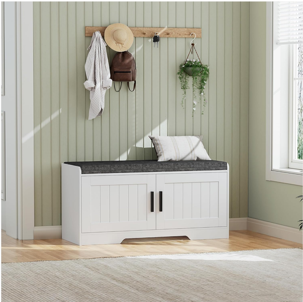
Image 1.1: The Homleke 2-Tier Storage Bench (Model BS30W) in a typical entryway setting.