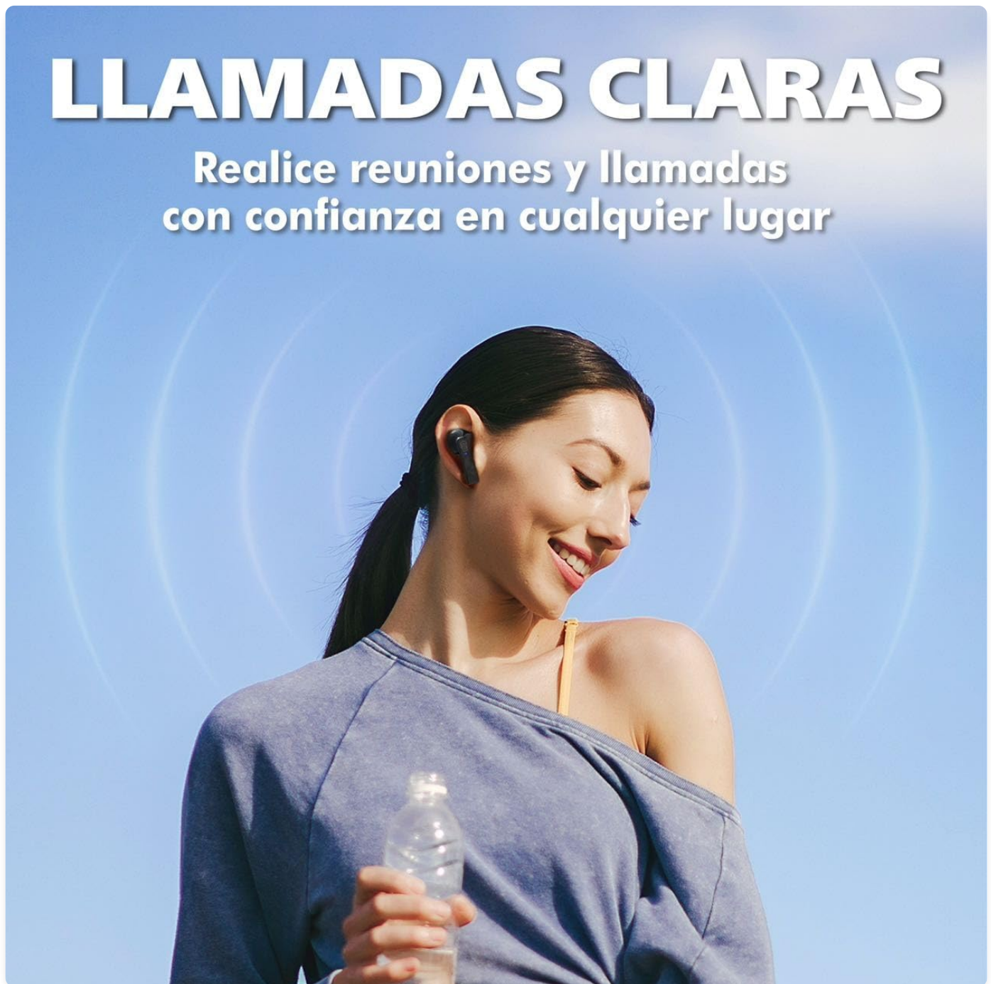
Image: A woman smiling and holding a water bottle, wearing KBOD C2 headphones, illustrating the clear call feature. Sound waves emanate from her head, symbolizing clear audio communication.

With the built-in microphone, you can easily manage calls.