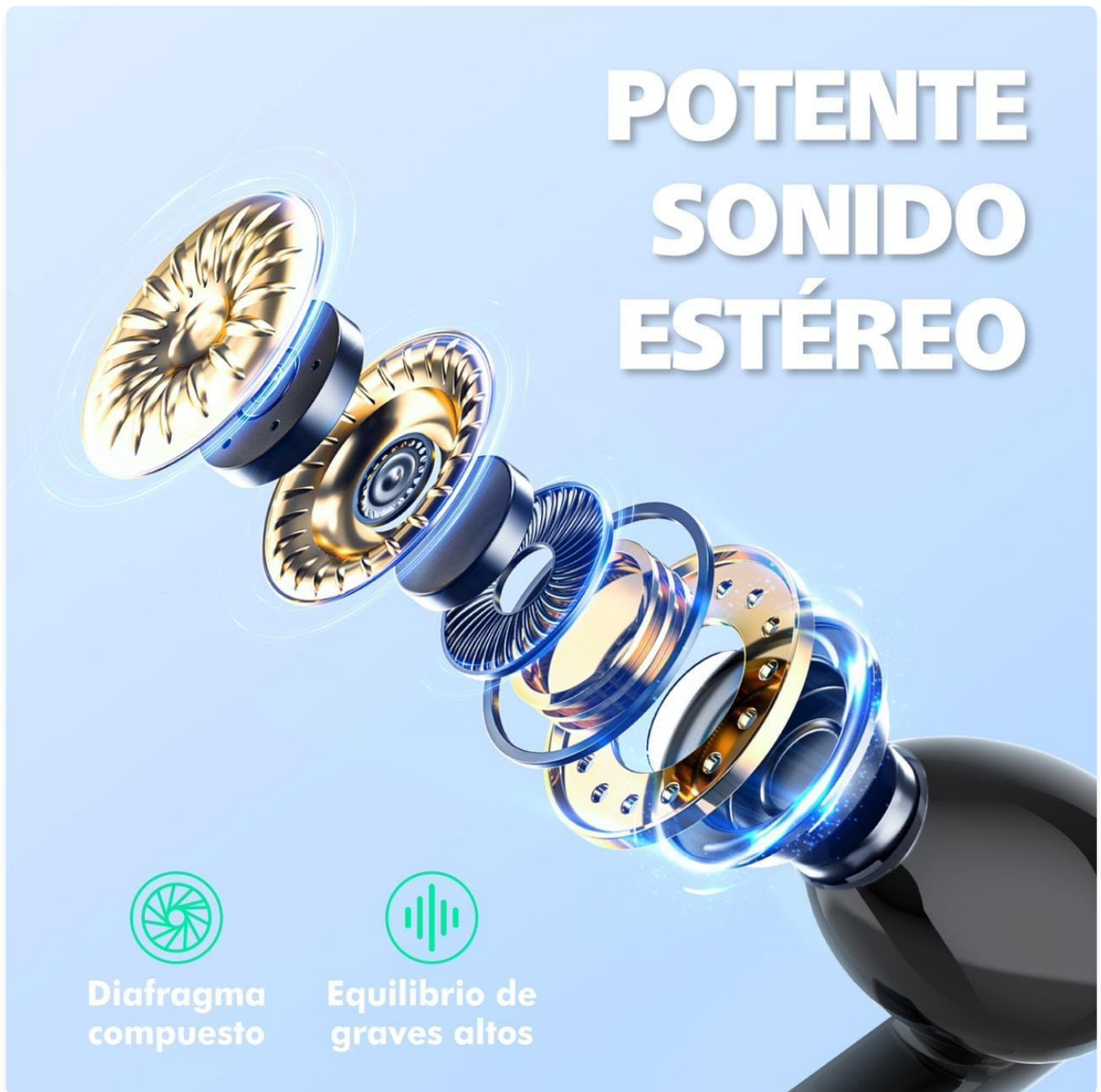
Image: An exploded view diagram showing the internal components of the KBOD C2 earbud, highlighting the composite diaphragm and high-bass balance for powerful stereo sound.

The KBOD C2 headphones deliver powerful stereo sound with high-definition audio and active noise cancellation.