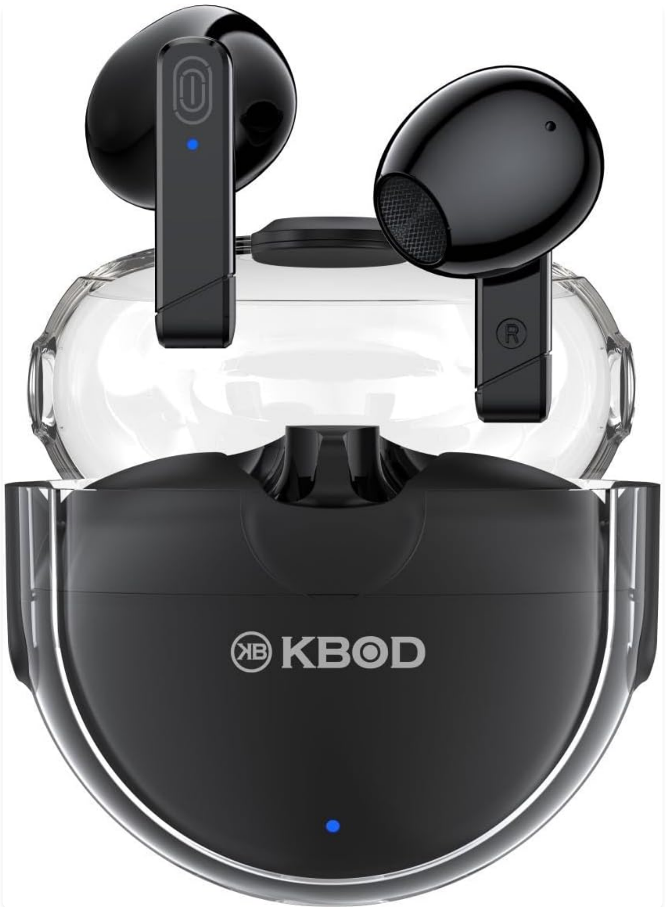
Image: The KBOD C2 wireless headphones, black in color, resting inside their transparent and black charging case. A blue indicator light is visible on the left earbud and on the front of the charging case, indicating power or connection status.