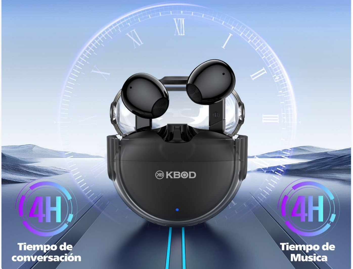
Image: An illustration highlighting the ultra-long battery life of the KBOD C2 headphones, showing "4H Talk Time" and "4H Music Time" with a clock background, indicating extended usage.