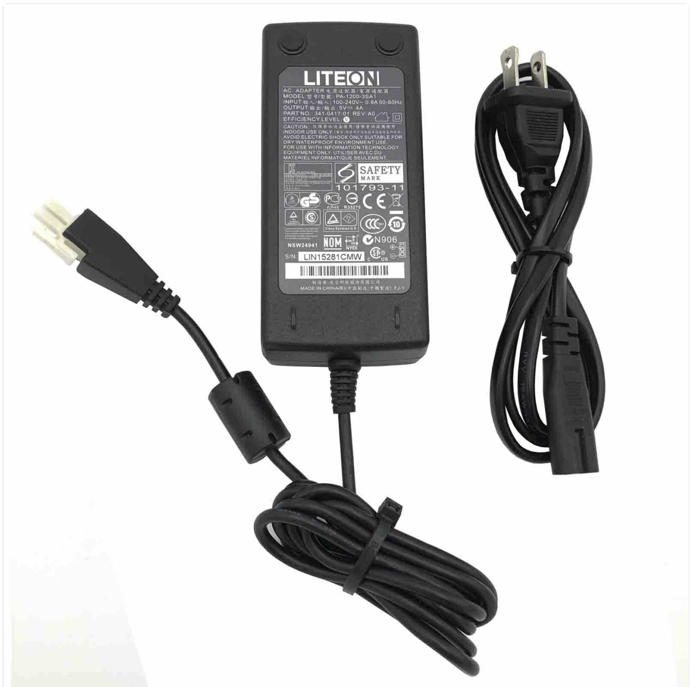
Image: The LiteOn PA-1200-3SA1 AC Adapter with its power cord, showcasing the complete unit.