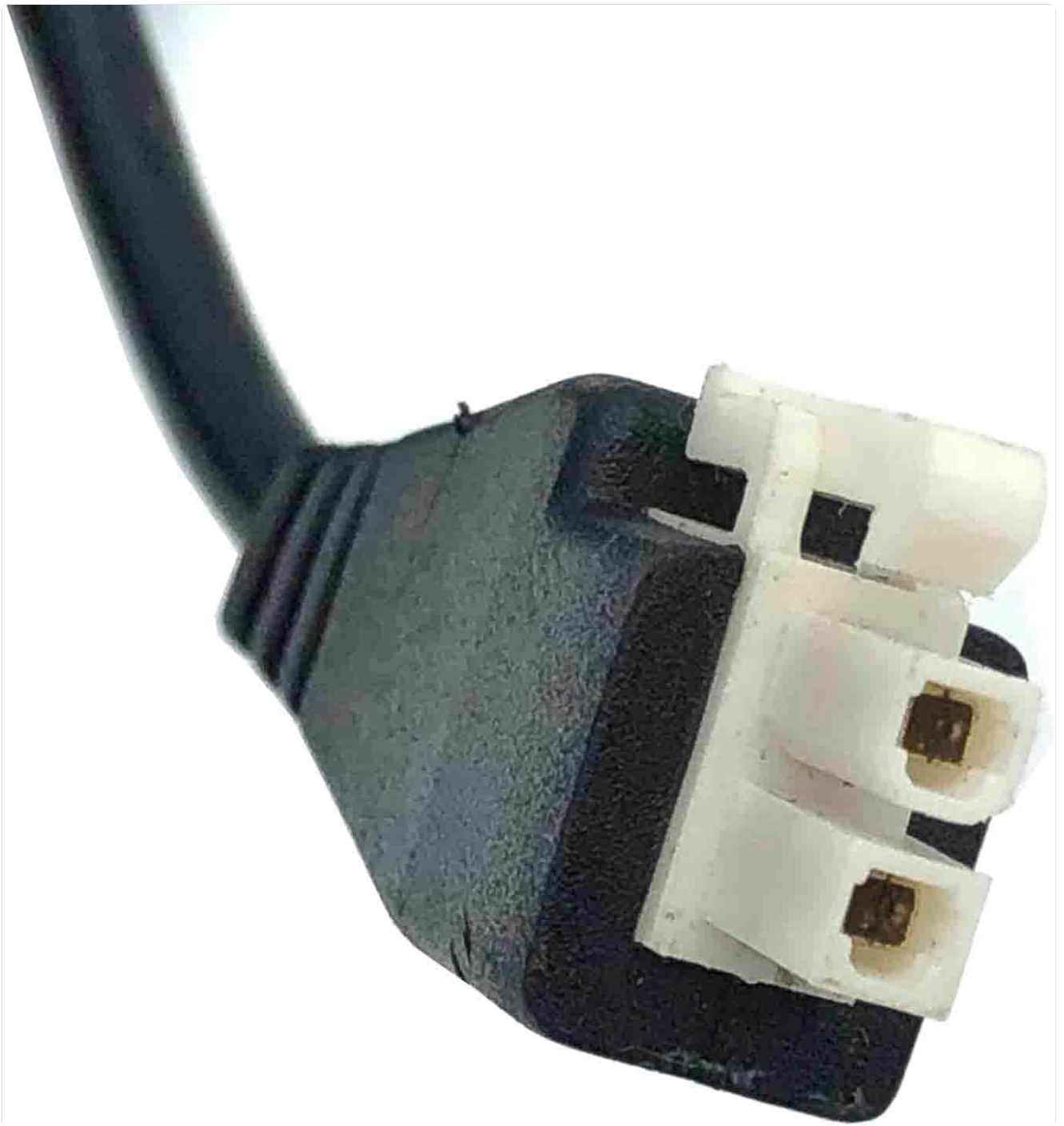
Image: A detailed view of the 2-pin output connector, highlighting its shape and pin configuration.