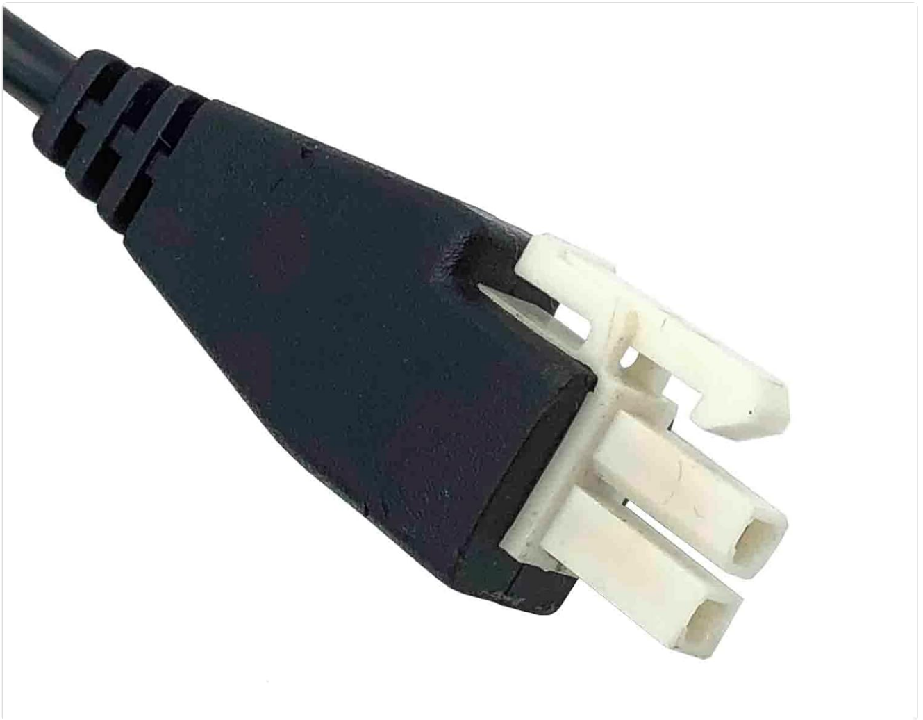
Image: An alternative perspective of the 2-pin output connector, showing its design from a different angle.