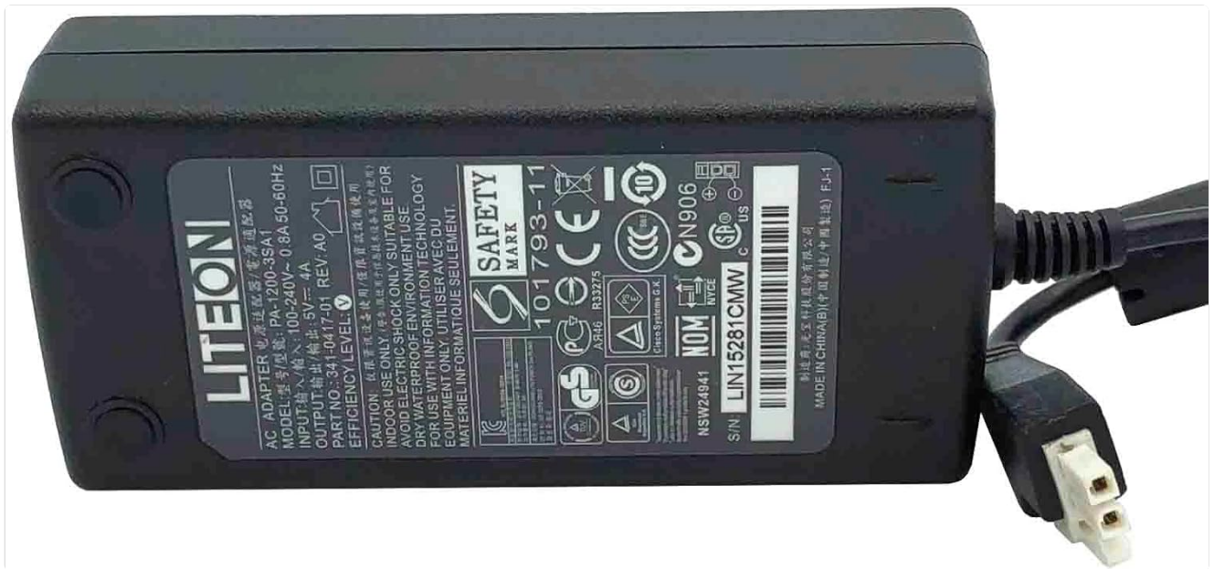
Image: The LiteOn AC adapter showing the input port where the AC power cord connects.