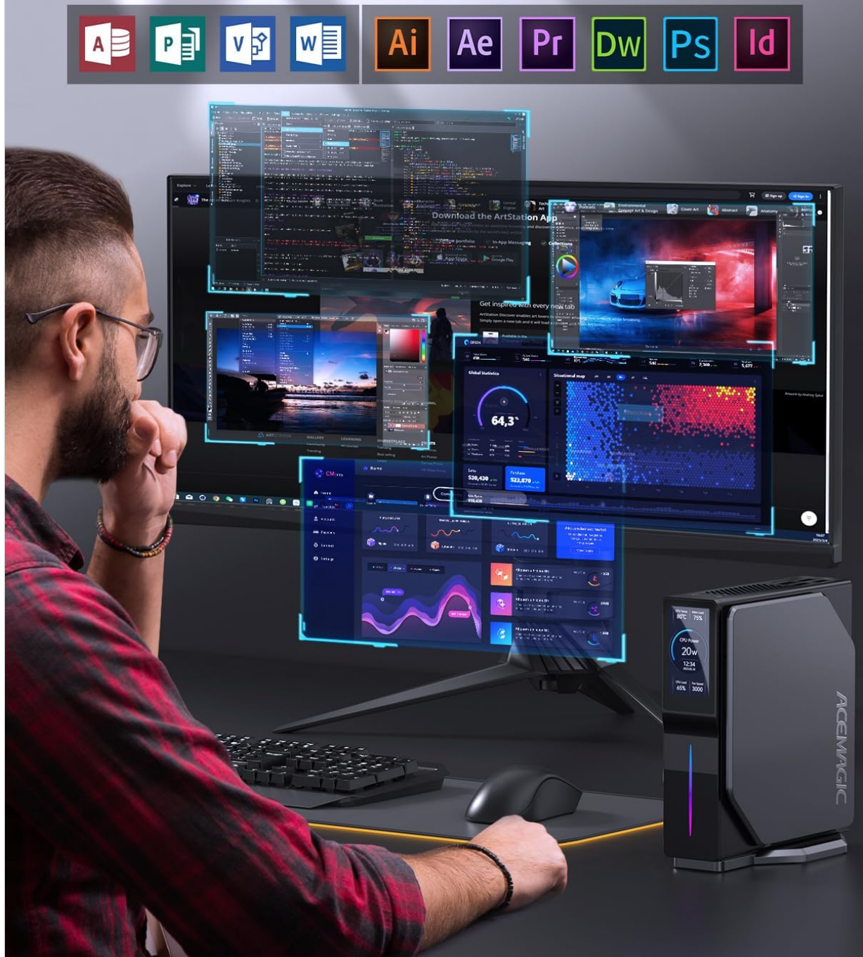
Image 1.1: The ACEMAGIC S1 Mini PC in a typical multi-monitor work environment, demonstrating its capability for various applications.

Daily operation and storage without burden