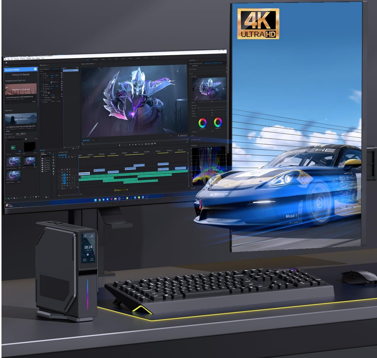
Image 5.2: A setup demonstrating the ACEMAGIC S1 Mini PC driving two 4K monitors, suitable for enhanced productivity. To set up dual displays: