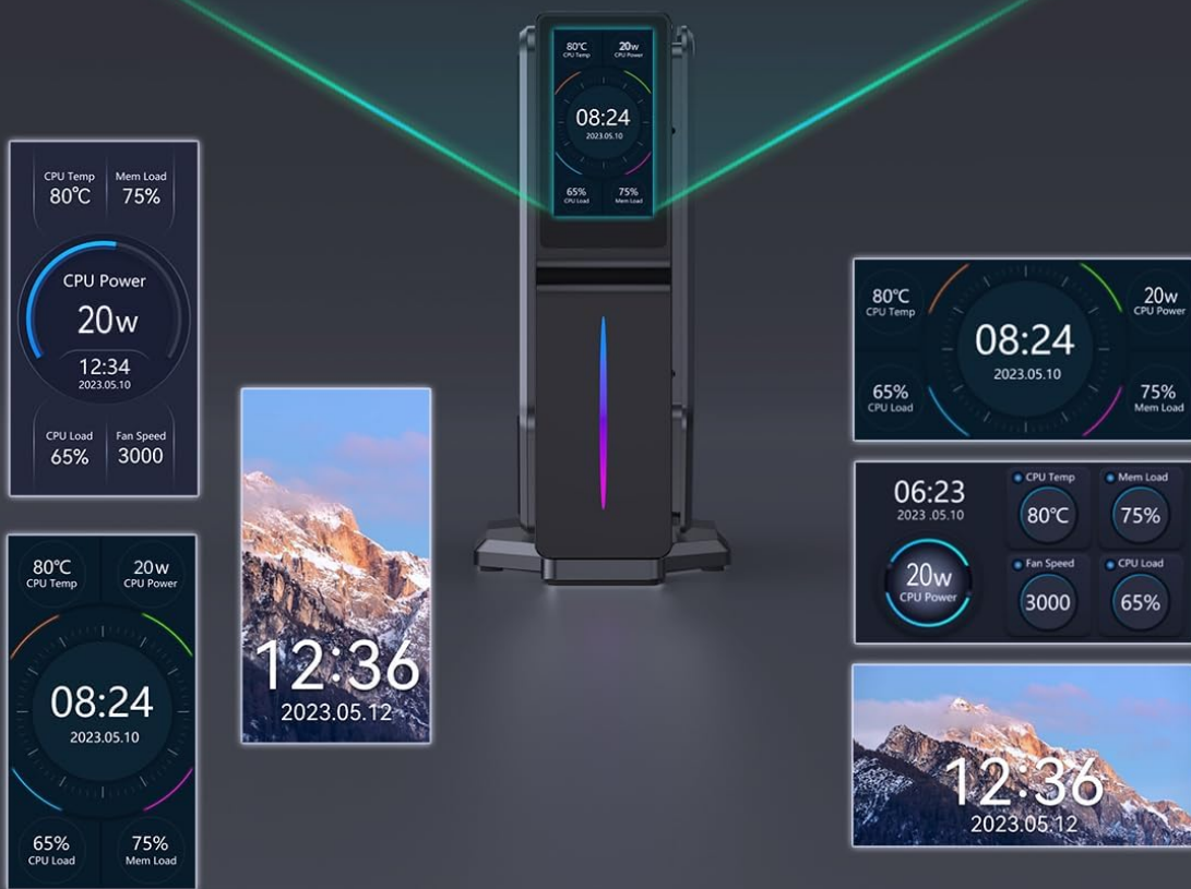
Image 5.1: Examples of the software interface for customizing the LCD display, including theme selection and data display options.

To customize the LCD display, use the dedicated software application pre-installed on the Mini PC. This application allows you to: