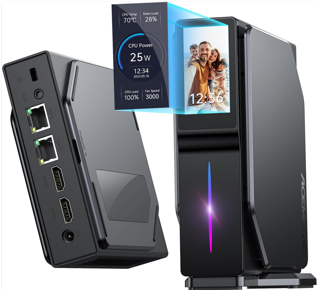
Image 3.1: Front view of the ACEMAGIC S1 Mini PC displaying system metrics on its LCD, alongside a rear view highlighting the available ports.

The ACEMAGIC S1 Mini PC is designed for compact and efficient computing. It features a range of ports for connectivity and an integrated LCD display for system information.