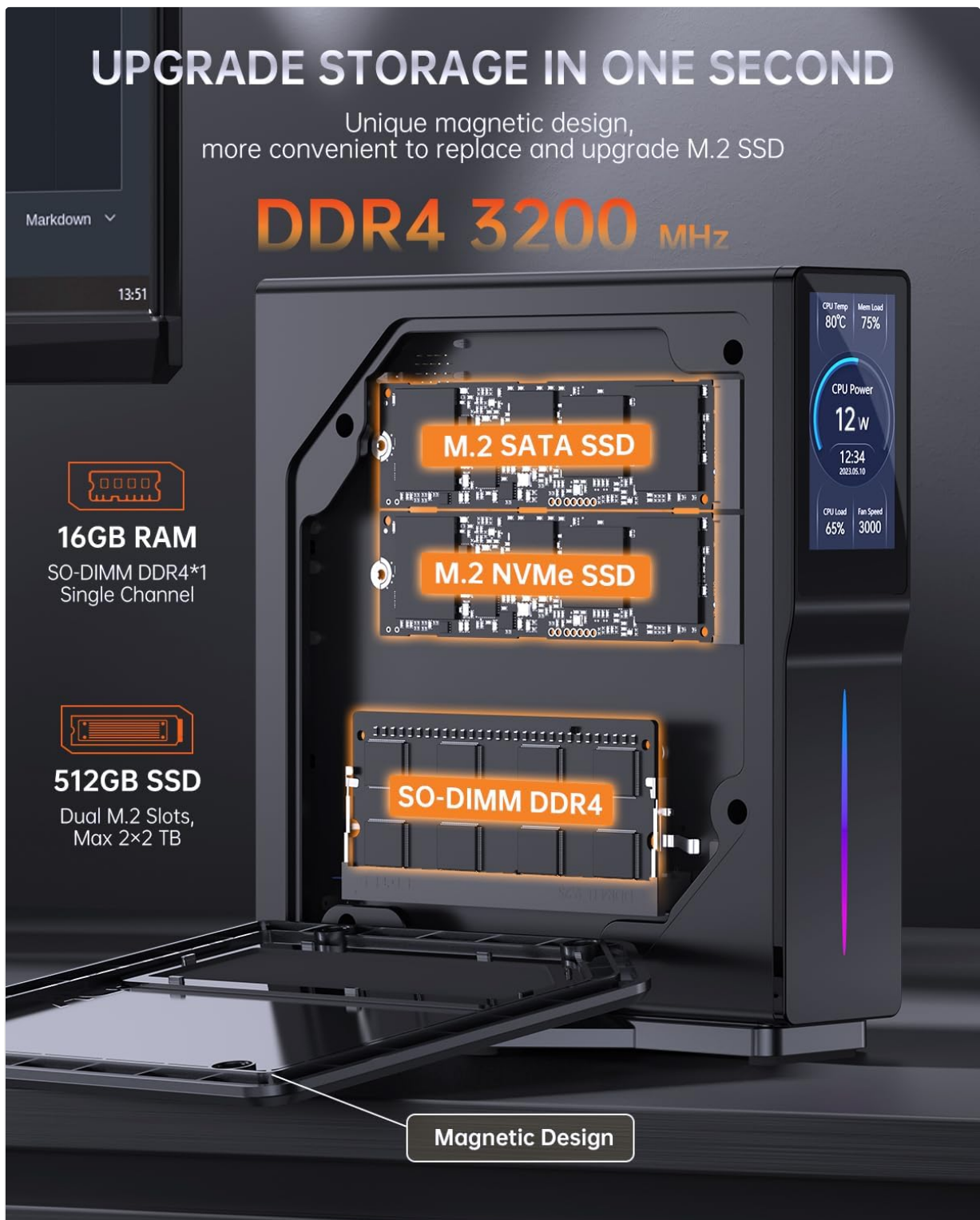
Image 6.1: An exploded view of the ACEMAGIC S1 Mini PC's interior, illustrating the accessible M.2 slots for SSDs (SATA and NVMe) and the SO-DIMM DDR4 RAM slot.

upgrade the memory (RAM) and storage (SSD).