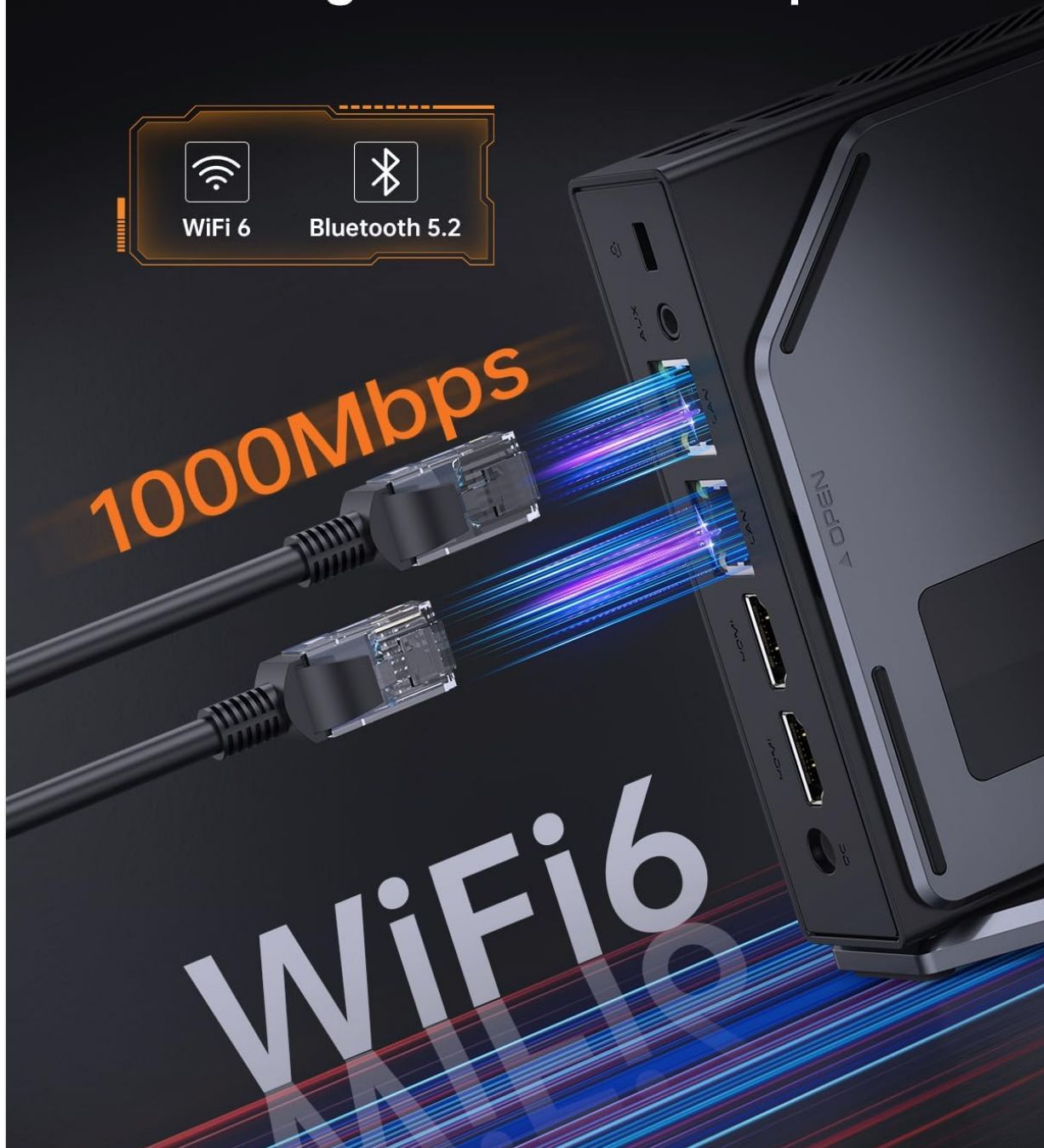
Image 7.1: Visual representation of the Mini PC's advanced connectivity features, including dual Gigabit LAN, WiFi 6, and Bluetooth 5.2.