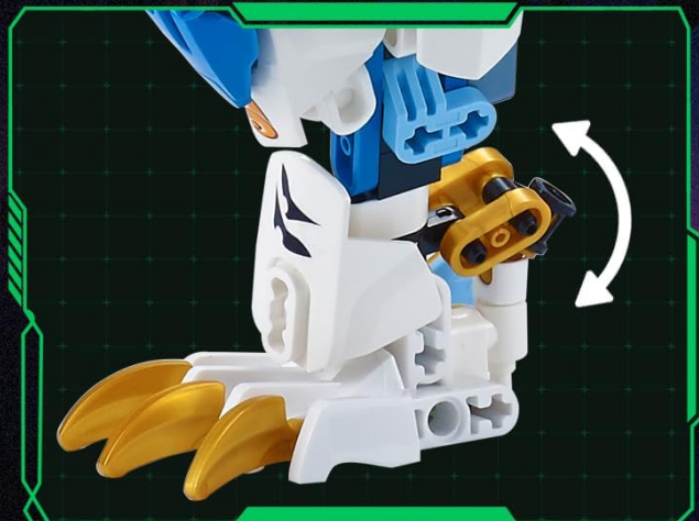
Joints are movable