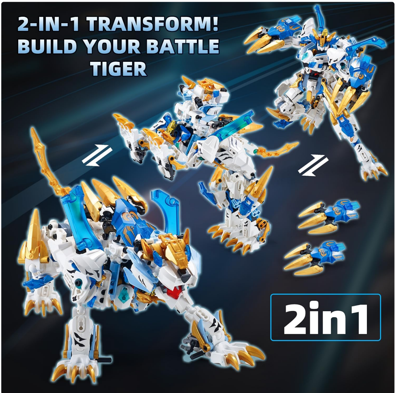
Figure 4.1: Visual guide illustrating the 2-in-1 transformation of the model.

To transform your model, follow the specific steps outlined in the instruction manual. The transformation involves rotating and repositioning various parts, including the head, limbs, and body sections. The design allows for a smooth transition between forms.