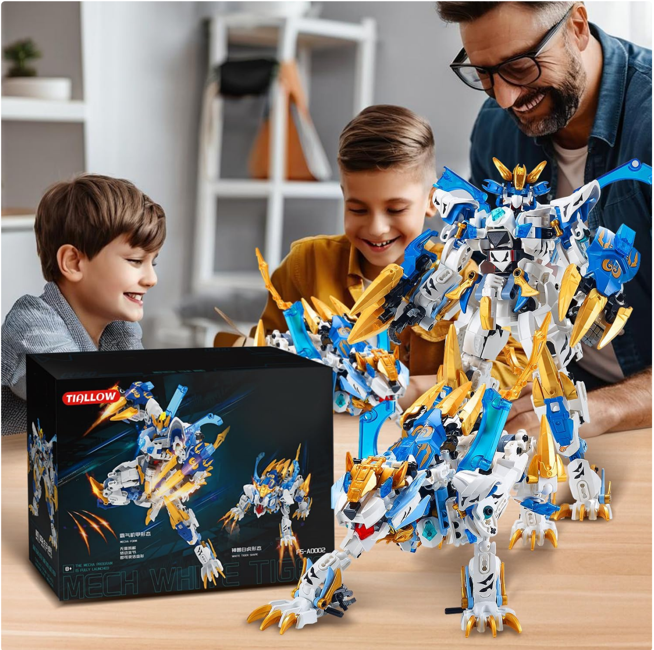
Figure 3.1: Children engaged in the assembly of the building set, highlighting the hands-on activity.