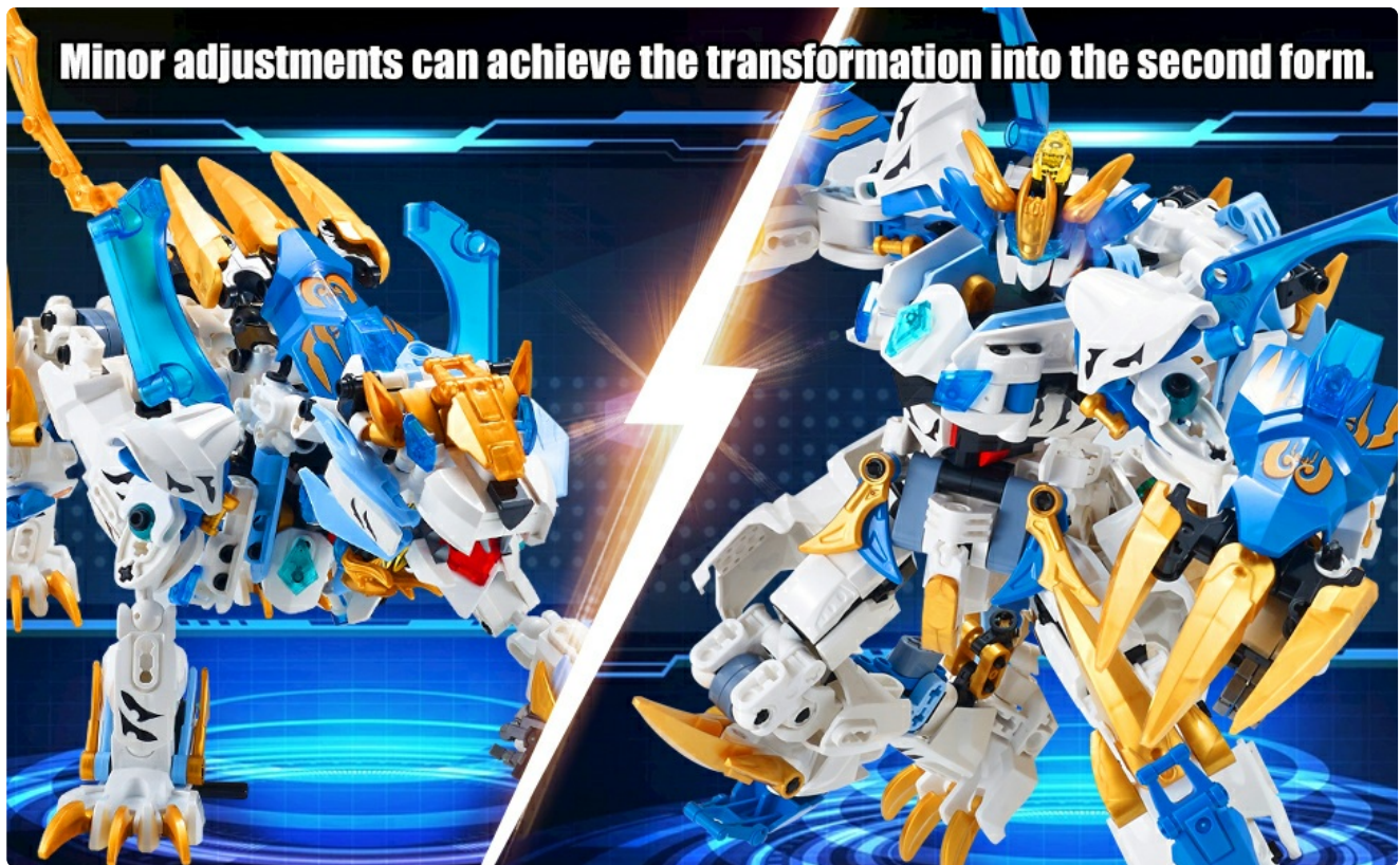
Figure 4.2: The model's ability to transform between forms with minimal adjustments.