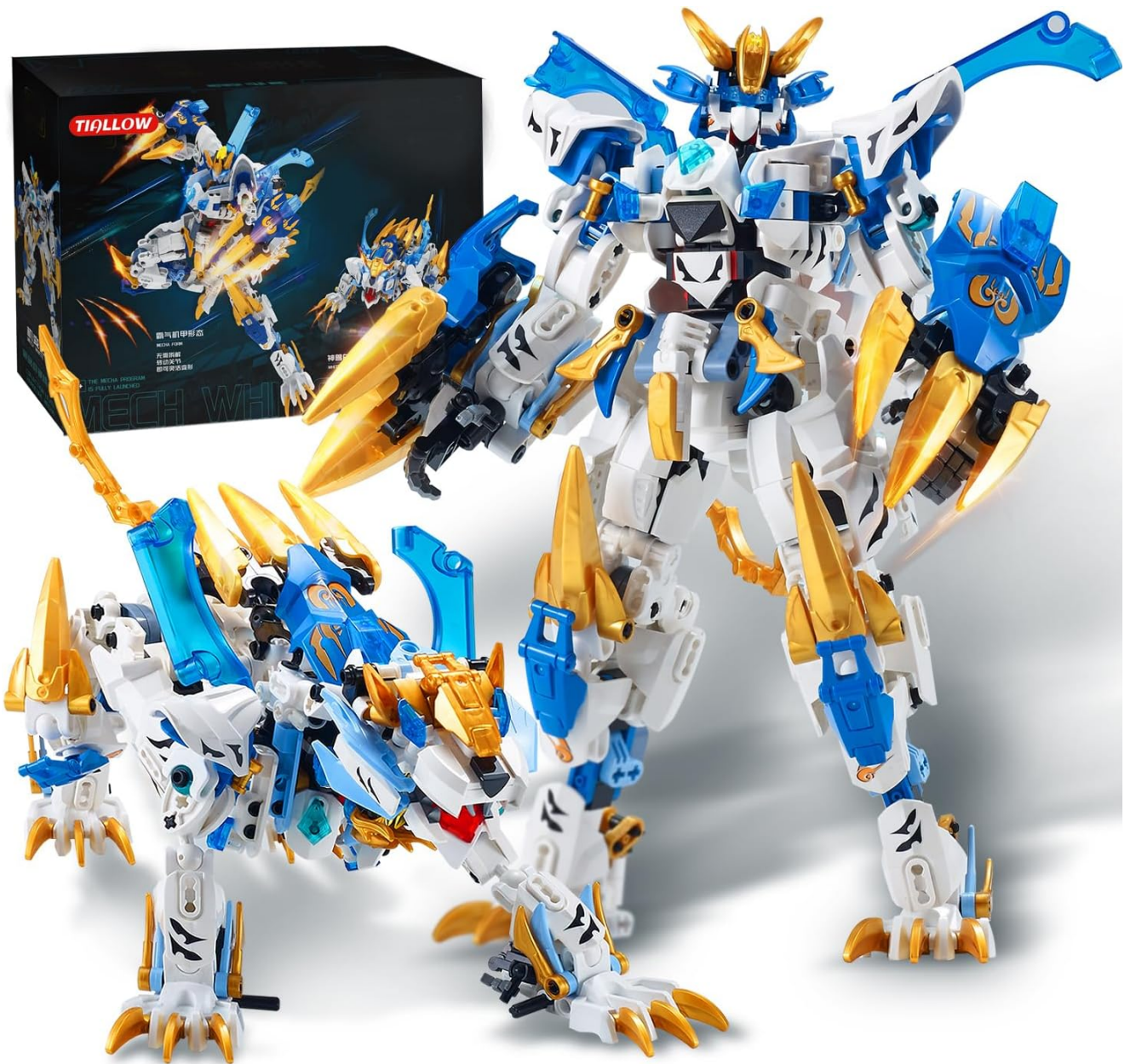
Figure 1.1: The TIALLOW White Tiger 2-in-1 Transforming Robot Building Set in both its robot and tiger forms, alongside the product packaging.