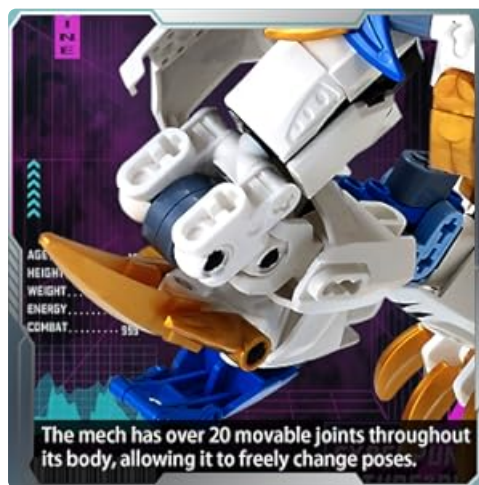
Figure 4.4: The mech's extensive movable joints for dynamic posing.

Your browser does not support the video tag.