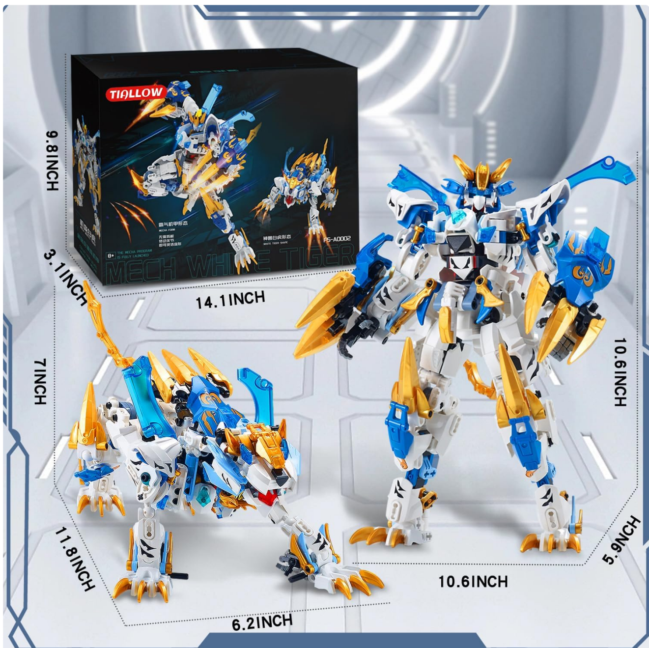
Figure 7.1: Dimensions of the White Tiger model in both robot and beast forms.