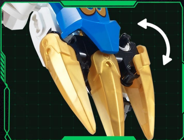
Cool weapon equipment