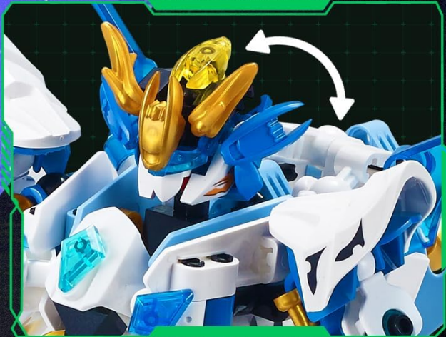
The head can rotate