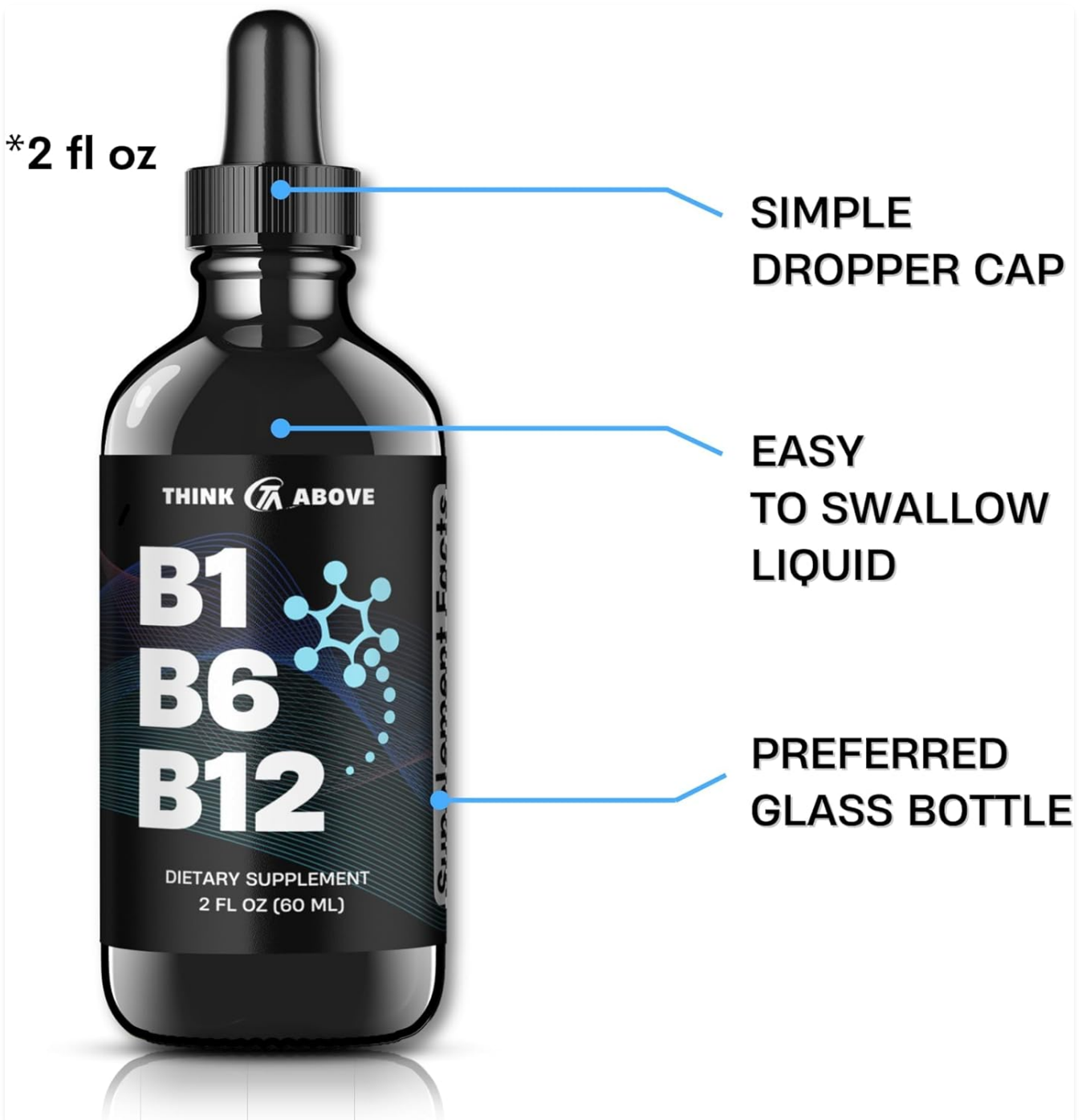
Image: The product bottle highlighting its features: simple dropper cap, easy-to-swallow liquid, and preferred glass