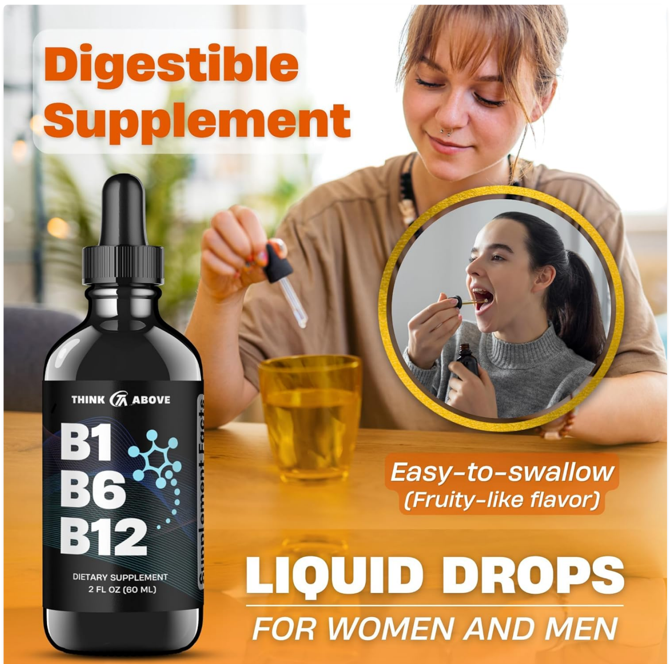
Image: A person using the dropper to take the liquid supplement, illustrating the ease of use.

Take 1 dropper (approximately 20 drops or 1 ml) per day. The liquid drops can be taken straight or mixed into a beverage of your choice, such as juice or water.