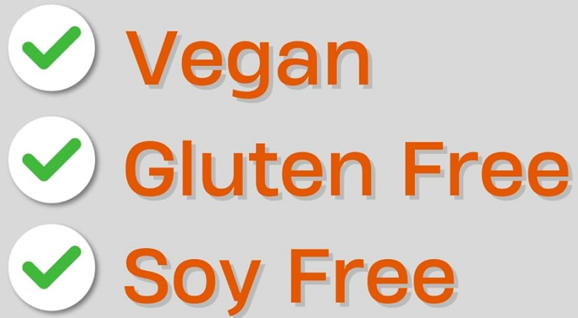
Image: Visual representation of the product being Vegan, Gluten Free, and Soy Free with green checkmarks.