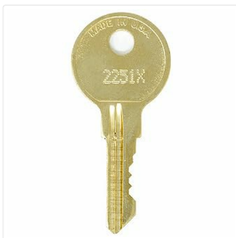
Image 1.1: The EasyKeys Replacement Key. This image displays a brass key with a code (e.g., '2251X') visible on its head, representing a key within the compatible series (2251X - 2500X). The key features a standard cut profile.

This document provides instructions for the EasyKeys Replacement Key, specifically designed for CompX Chicago locks requiring the 2402X key code. This custom-cut key is compatible with locks manufactured by Hudson and other brands within the CompX Chicago Key Series 2251X - 2500X range. It is crafted from durable brass material to ensure reliable performance.