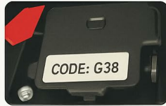
On a Label Inside/ Behind the Lock