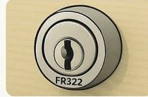
On the Lock Face