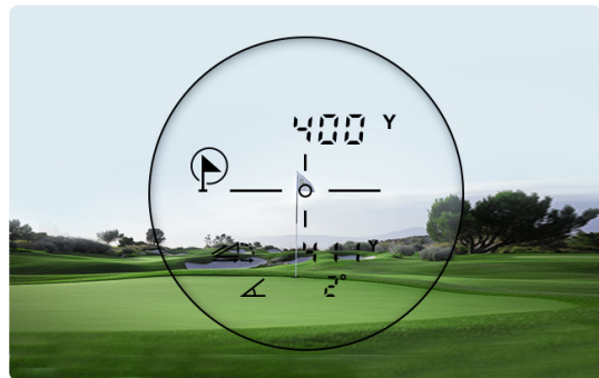
Flag lock in 400+ Yards